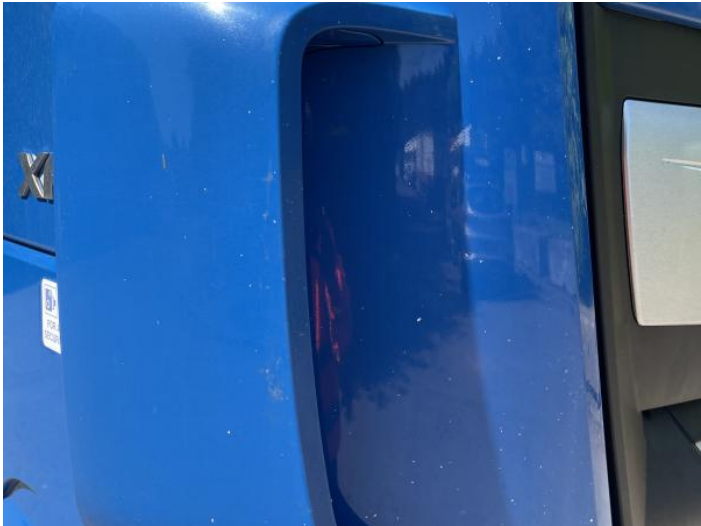
4: Wing osf Chipped Multiple Chips