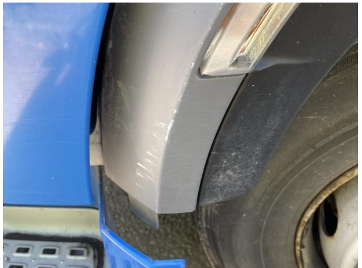
2: Door Moulding nsf Scuffed (Unpainted) Over 100mm