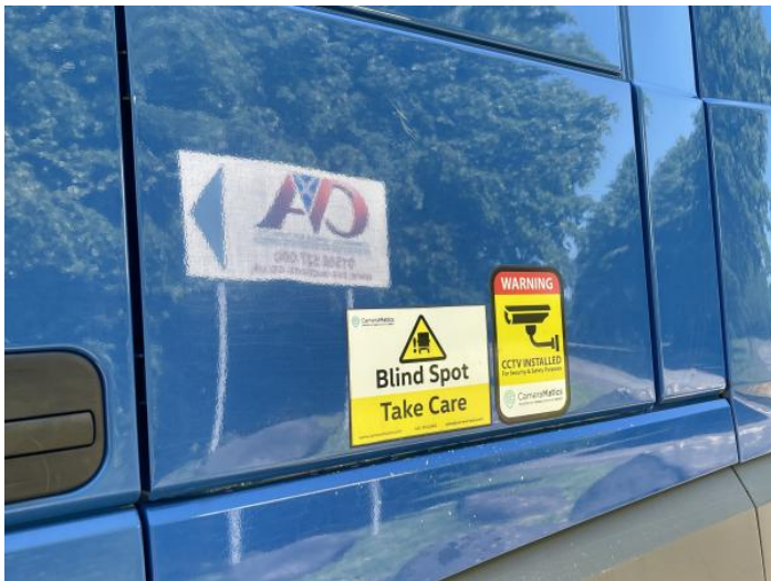
1: Qtr Panel nsr Scratched Over 25mm Thru Paint