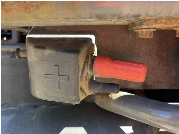
6: Unclassified Major Parts Missing Report Only

Carpet Condition Average Seat Condition Average