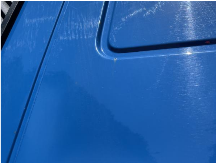
5: Qtr Panel osr Rusted Over 5mm