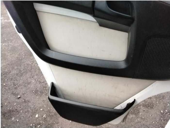
10: Door Pad nsf Soiled Heavy