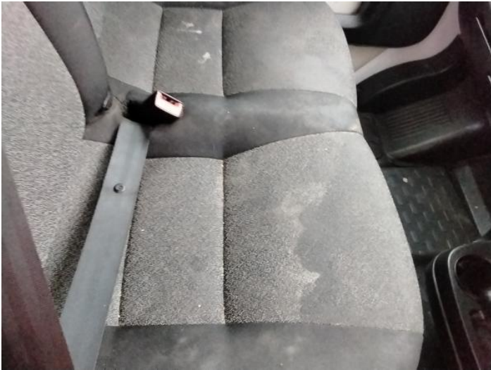
9: Seat Base Cover nsf Soiled Heavy