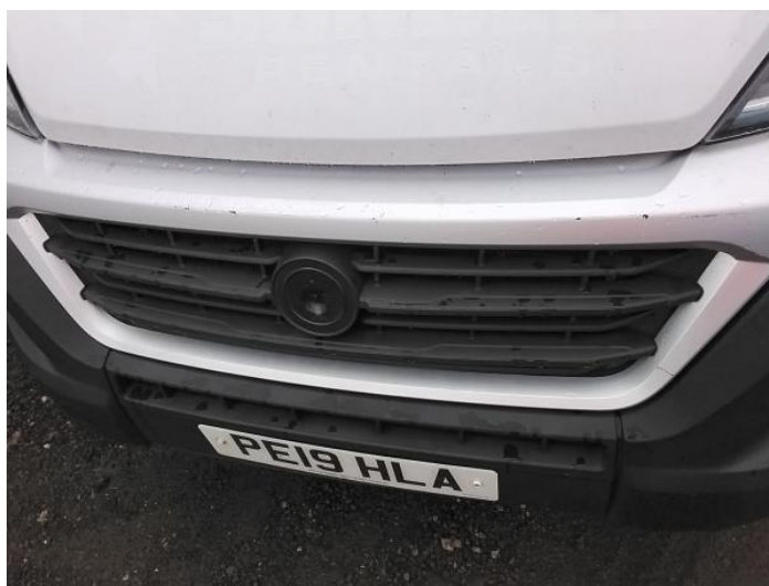
2: Panel Front Chipped Multiple Chips