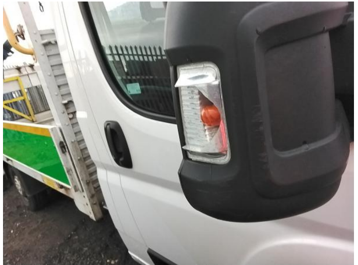
6: Door Mirror Assy osf Broken Replace