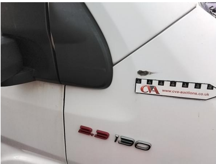
7: Wing osf Scratched Over 25mm Thru Paint