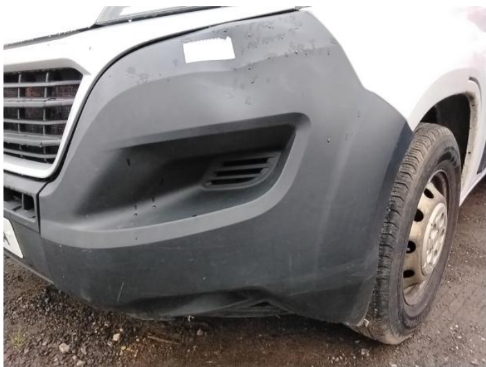
1: Bumper Front Dented Over 30% Of Panel