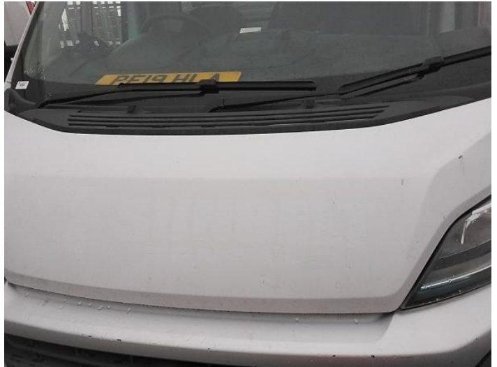
4: Bonnet Chipped Multiple Chips