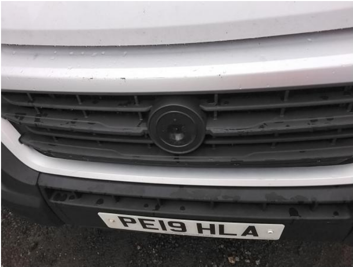
3: Badgedecal Front Missing Replace