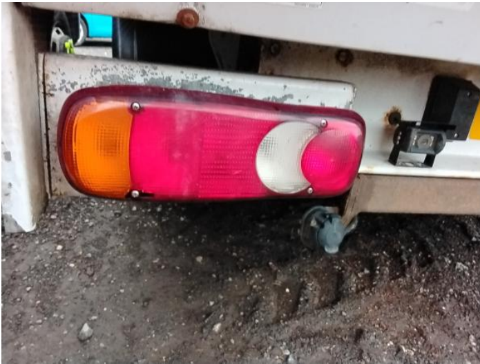
5: Lamp nsr Broken Replace