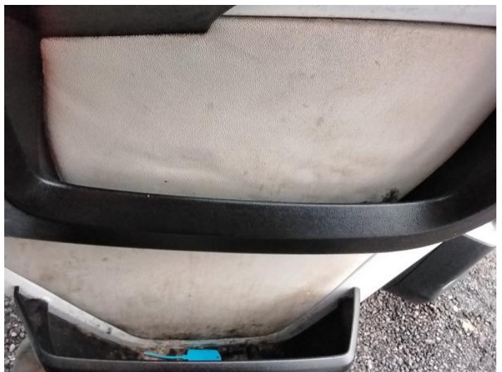
8: Door Pad osf Soiled Heavy