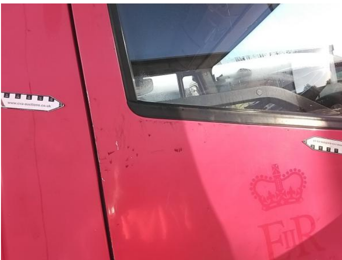
7: Door osf Scratched Over 25mm Thru Paint