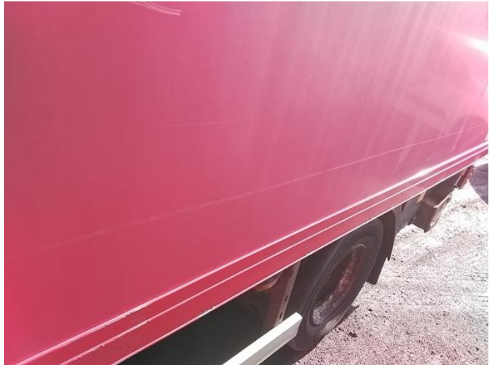
4: Qtr Panel nsr Scratched Over 25mm Thru Paint