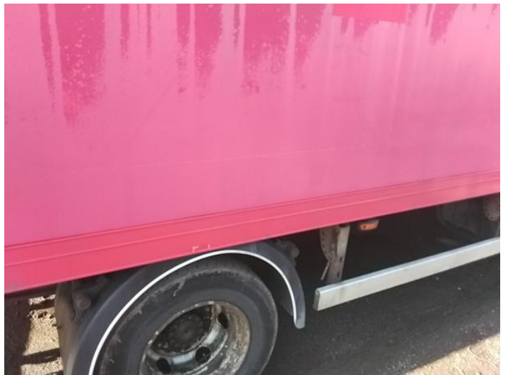
6: Qtr Panel osr Scratched Over 25mm Thru Paint