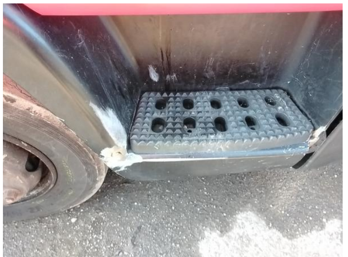
8: Wing osf Cracked Replace