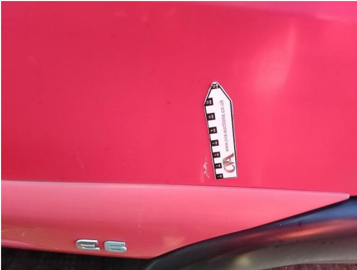
3: Door nsf Scratched Over 25mm Thru Paint