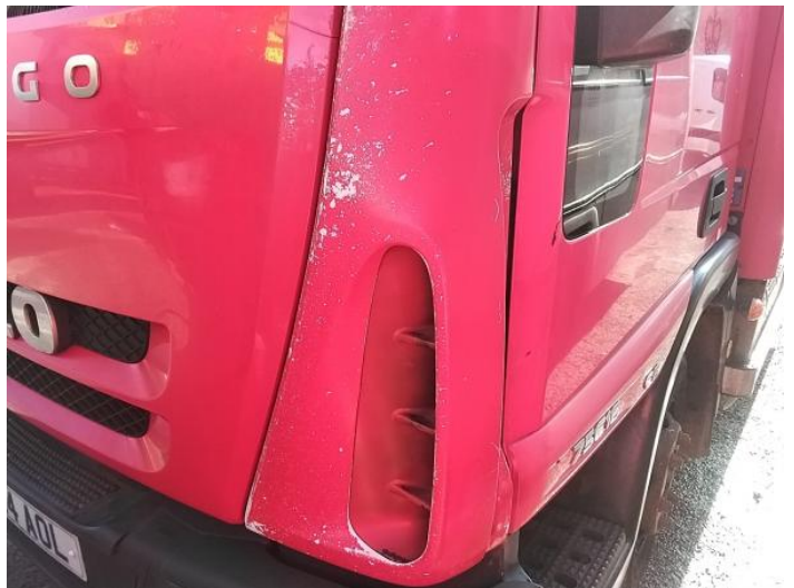
2: Panel Front Chipped Multiple Chips