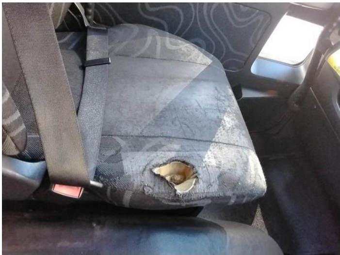
9: Seat Base Cover nsf Holed Over 3mm