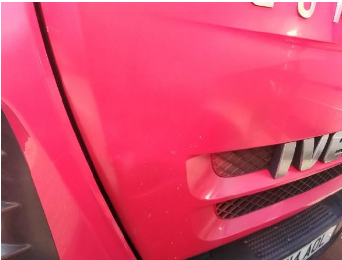
1: Bonnet Poor Previous Repair Rippled UpTo 30%