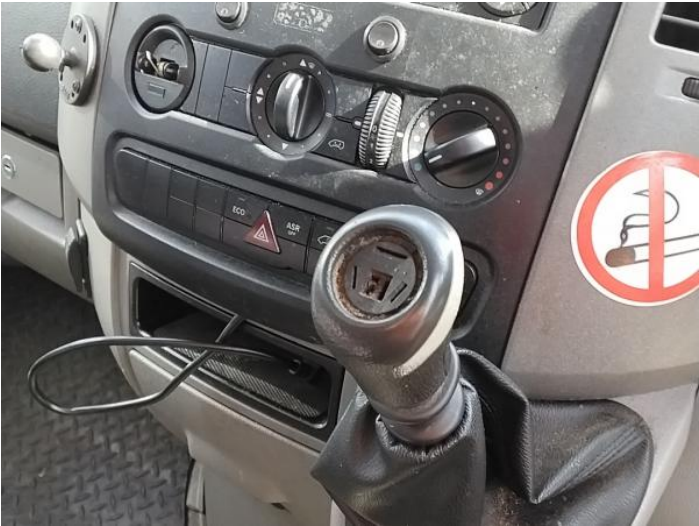
4: Other N/A N/A