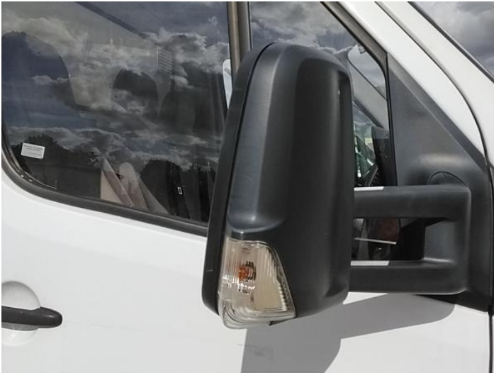
3: Door Mirror Assy osf Scuffed (Unpainted) UpTo 100mm