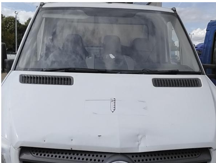
1: Bonnet Dented With Paint Damage