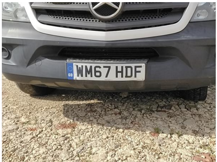
2: Number Plate Front Broken Replace