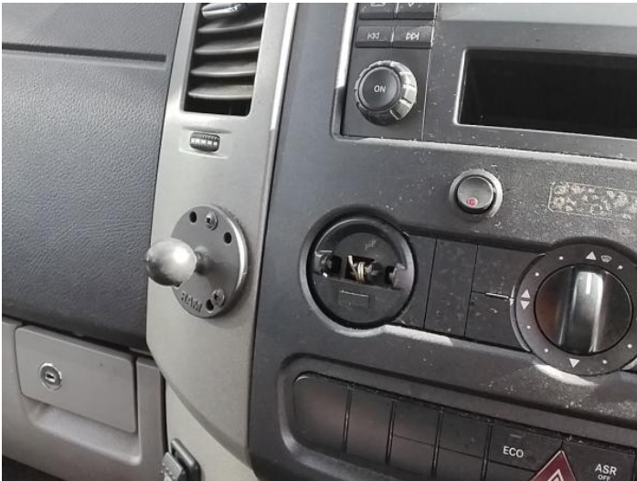
5: Other N/A N/A