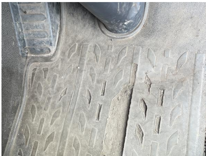
1: Carpets Front Holed Over 3mm