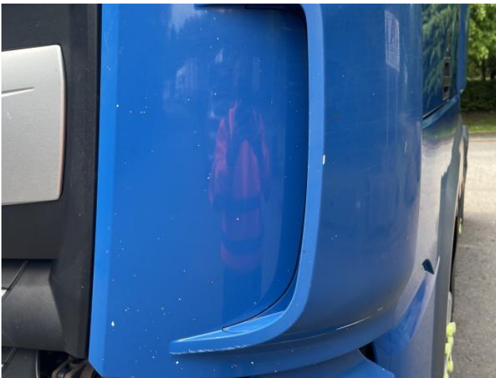
5: Wing nsf Chipped Multiple Chips