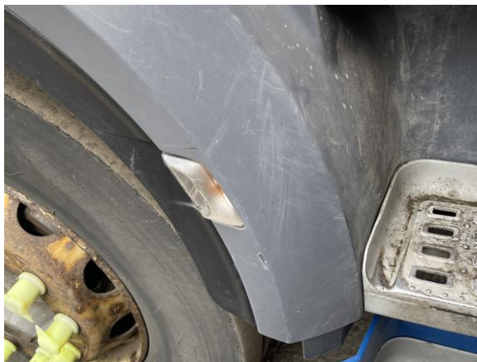
2: Door Moulding osf Scuffed (Unpainted) Over 100mm