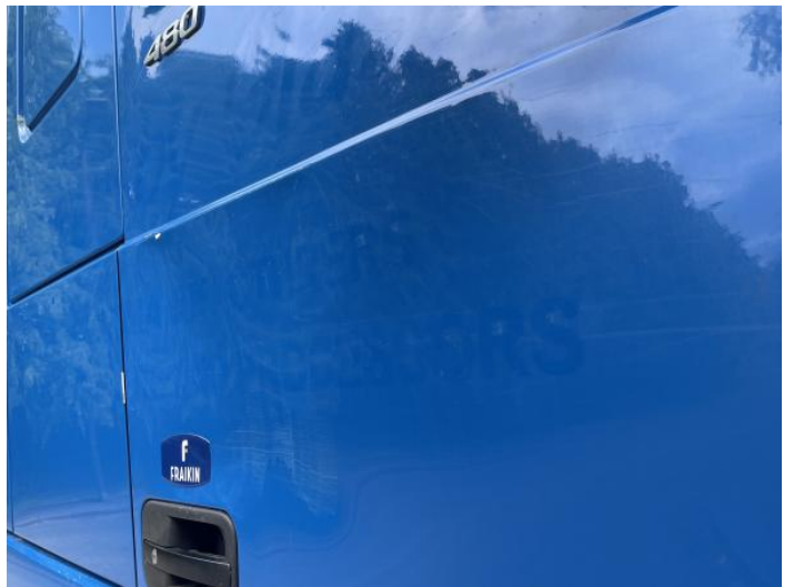
6: Door osf Dented With Paint Damage