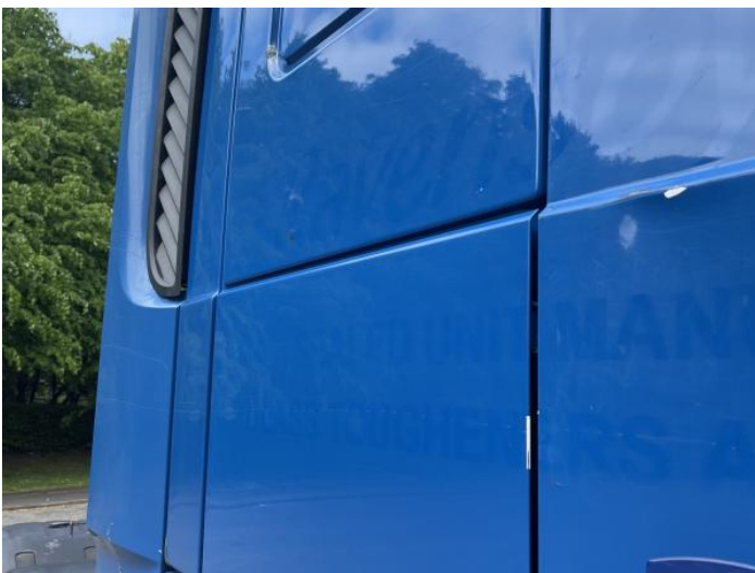
7: Qtr Panel osr Rusted Over 5mm