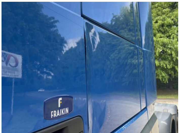
8: Qtr Panel nsr Dented With Paint Damage