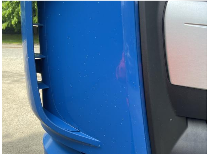
4: Wing osf Chipped Multiple Chips