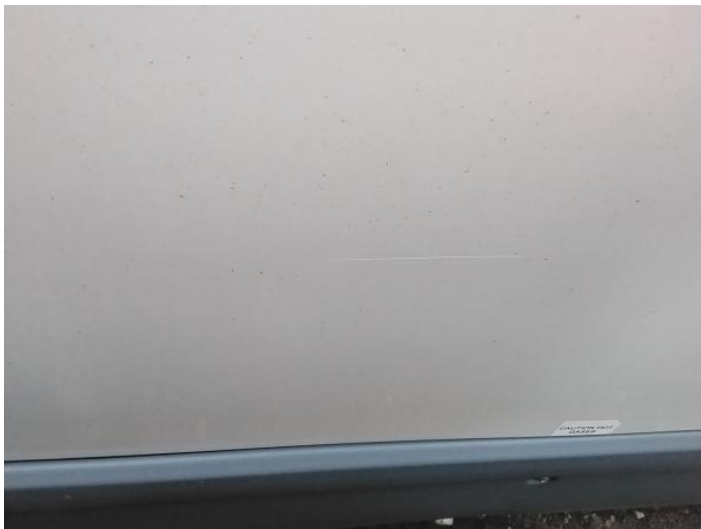
3: Qtr Panel osr Scratched Over 25mm Thru Paint