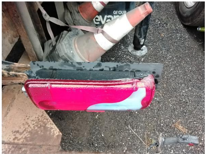
6: Lamp osr Broken Replace