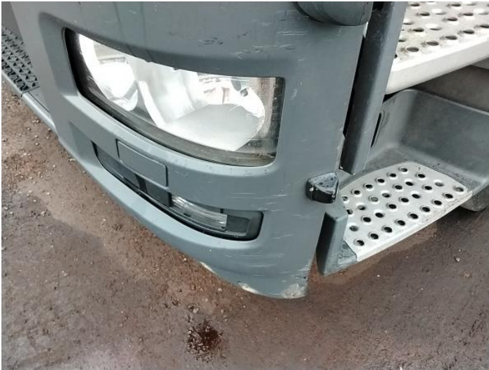
3: Bumper Front Scratched Over 100mm Thru Paint