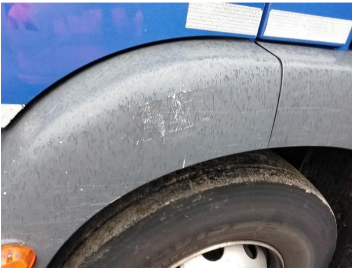
5: Wing nsf Scratched Over 25mm Thru Paint