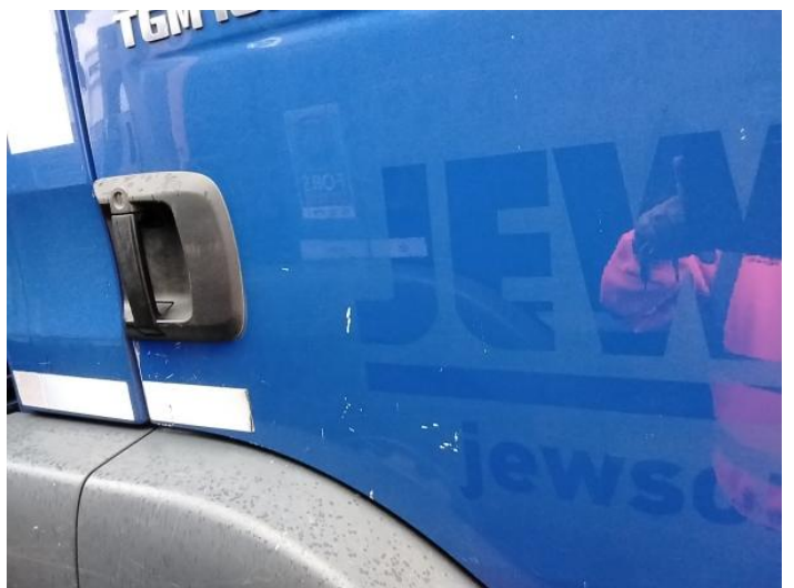
8: Door osf Scratched Over 25mm Thru Paint