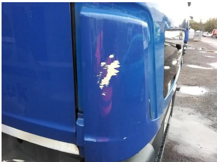
9: Panel Front Scratched Over 25mm Thru Paint