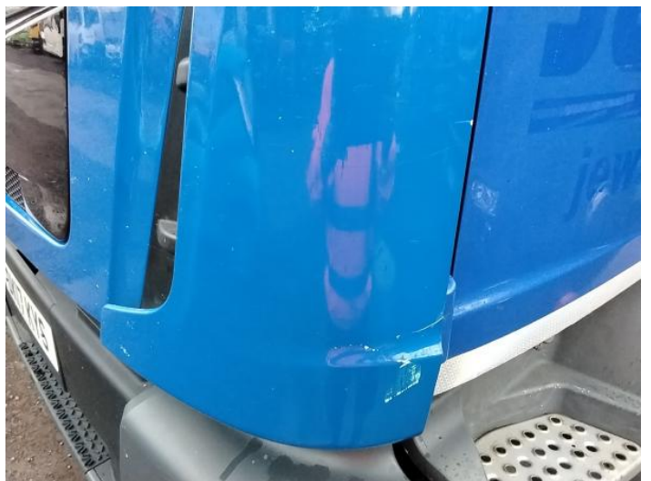
2: Panel Front Cracked Replace