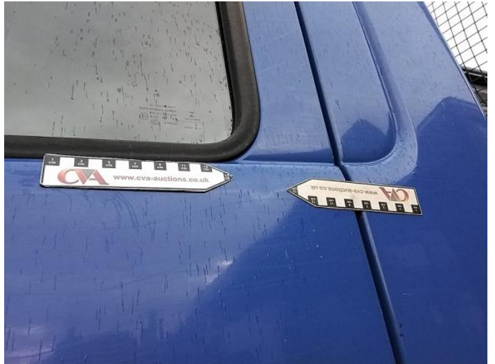
4: Door nsf Dented Over 30mm