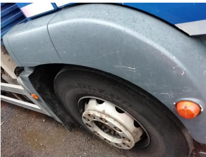
7: Wing osf Scratched Over 25mm Thru Paint