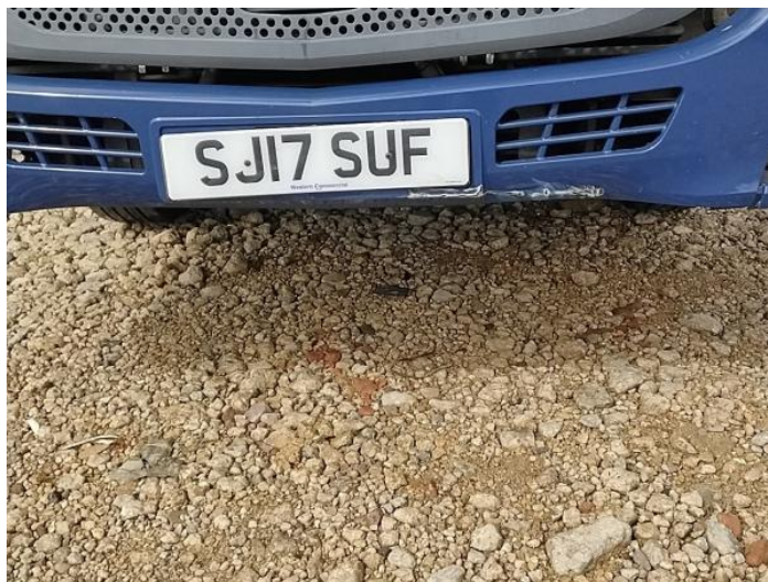
2: Bumper Front Scratched 25 to 100mm Thru Paint