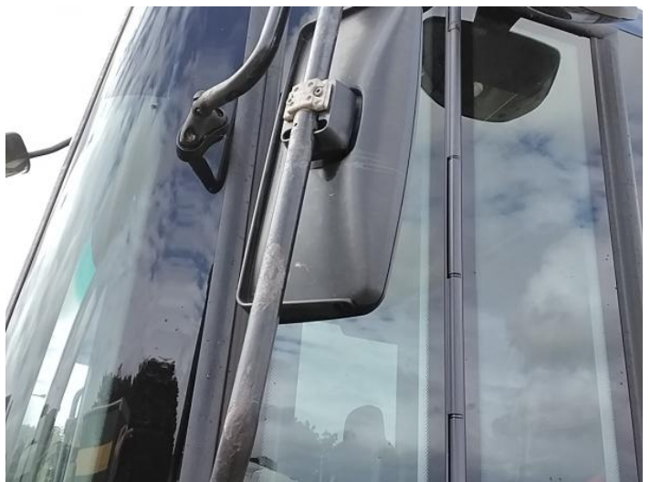
8: Door Mirror Assy nsf Scuffed (Unpainted) UpTo 100mm