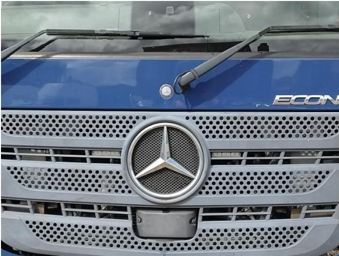
3: Panel Front Scratched UpTo 25mm Thru Paint