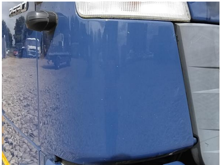
6: Wing osf Chipped Multiple Chips