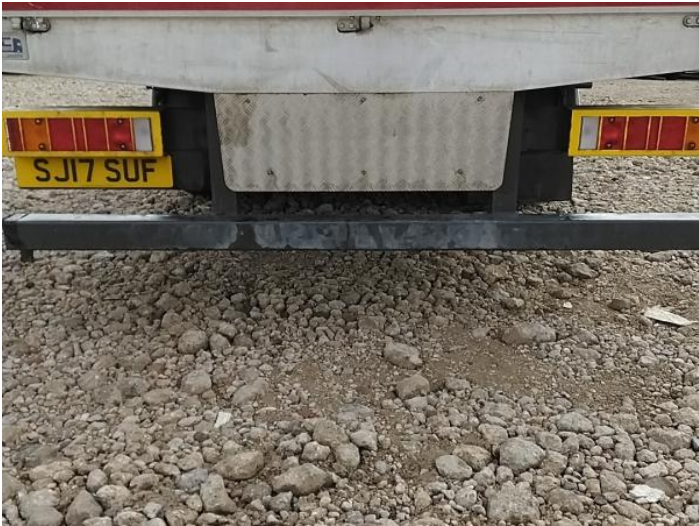
9: Bumper Rear Rusted Over 5mm