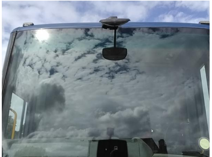
4: Screen Front Chipped UpTo 10mm