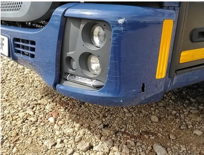
5: Fog Lamp Surround ns Broken Replace