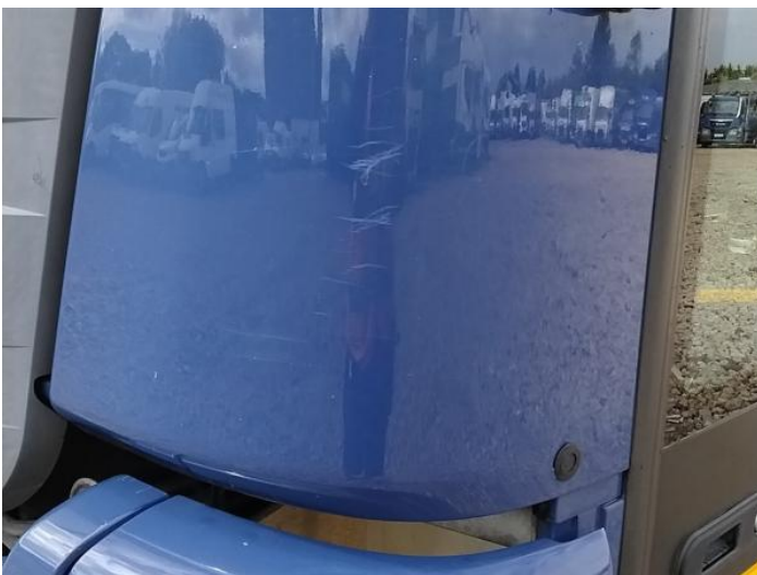
7: Wing nsf Scratched UpTo 25mm Not Thru Paint