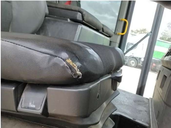
10: Seat Base Cover osf Holed Over 3mm