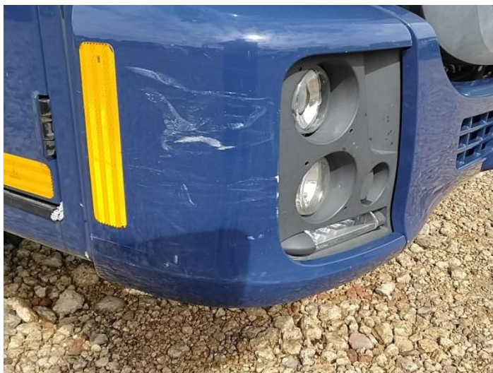
1: Fog Lamp Surround os Scratched (Painted) UpTo 25mm Thru Paint