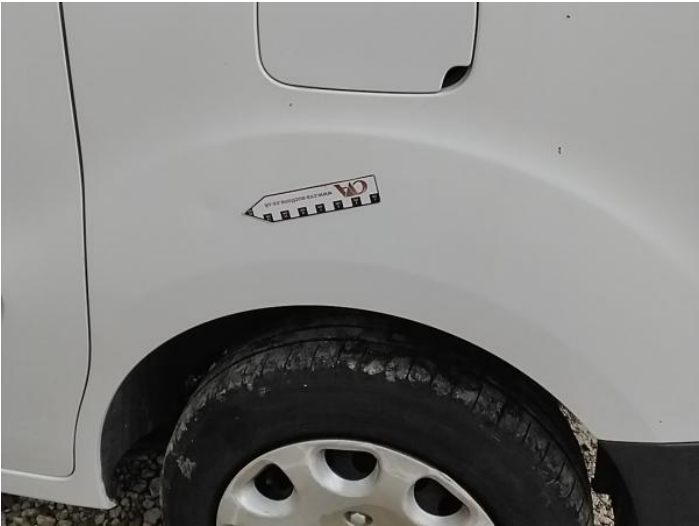
4: Qtr Panel nsr Dented Over 2 UpTo 10mm