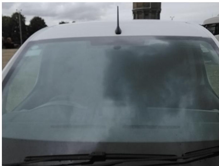
2: Screen Front Chipped UpTo 10mm