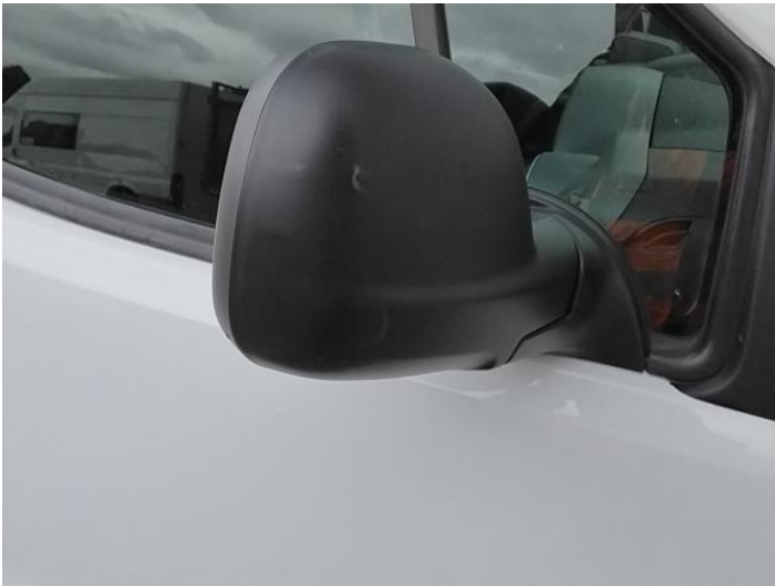
5: Door Mirror Assy osf Scuffed (Unpainted) UpTo 100mm