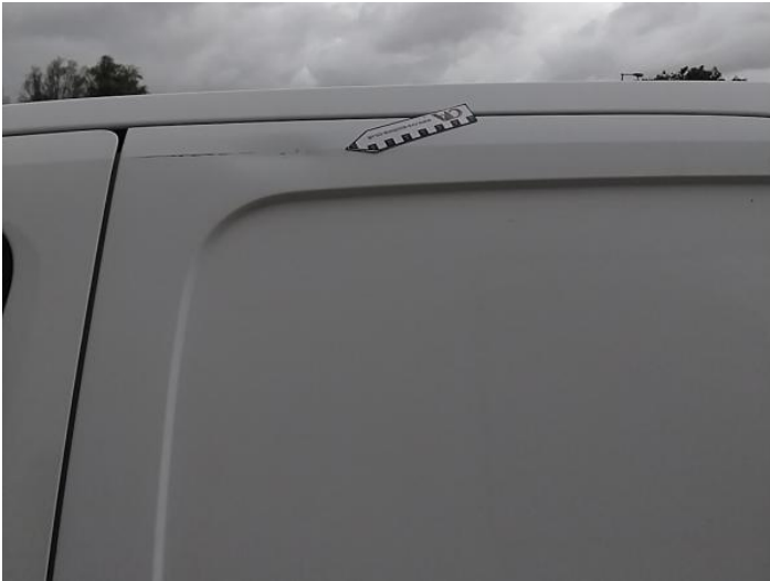
3: Door nsr Dented With Paint Damage