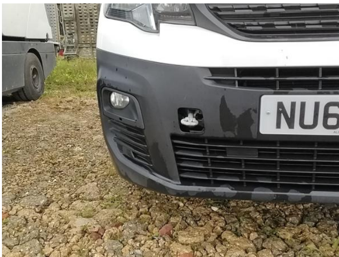
1: Front TowEye Cvr Missing Replace