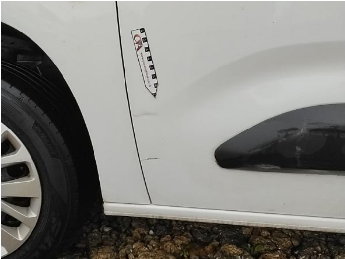
4: Door nsf Dented Between 10mm + 30mm