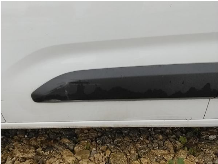
5: Door Moulding nsf Scuffed (Unpainted) UpTo 100mm