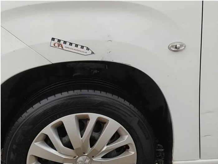
3: Wing nsf Scratched UpTo 25mm Thru Paint