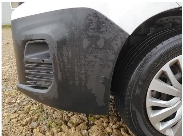
2: Bumper Front Moulding Scuffed (Unpainted) UpTo 100mm