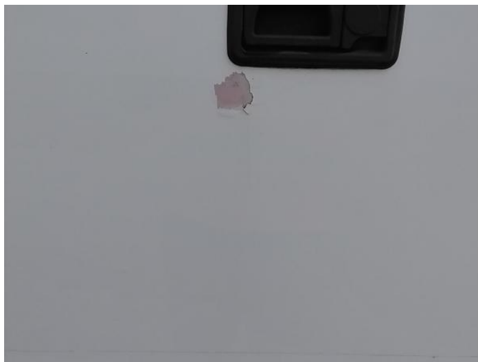
2: Door nsr Rusted Over 5mm