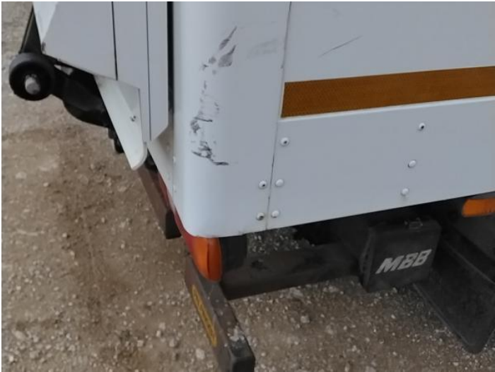
3: Panel Rear Scratched UpTo 25mm Not Thru Paint