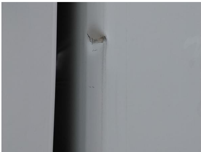
1: Qtr Panel osr Dented Over 30mm