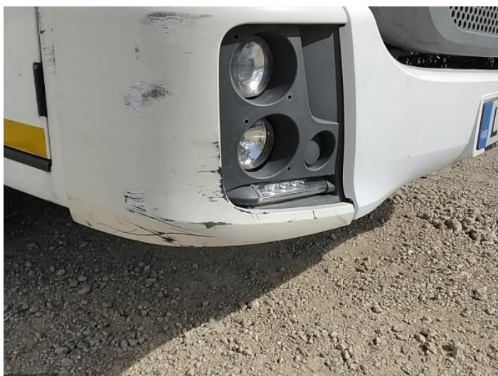
1: Fog Lamp Surround as Scratched (Painted) Over 25mm Thru Paint