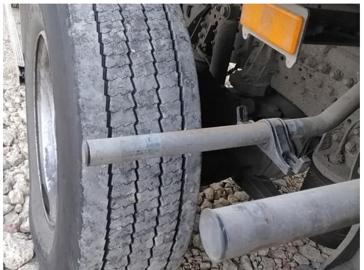
8: Wheel nsr Missing Replace