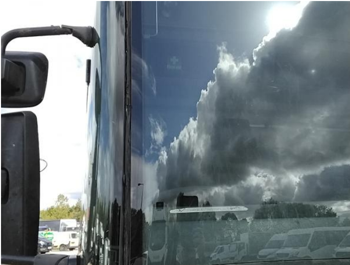
3: Other N/A N/A