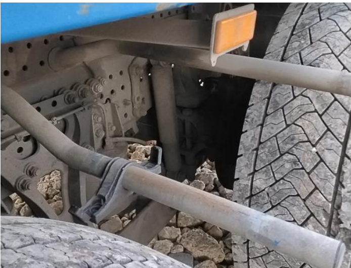
11: Wheel nsr Missing Replace