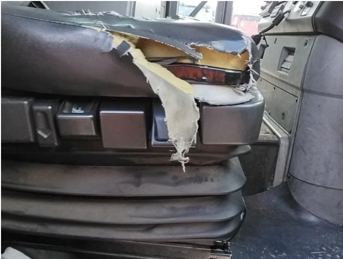
21: Seat Base Cover osf Holed Over 3mm