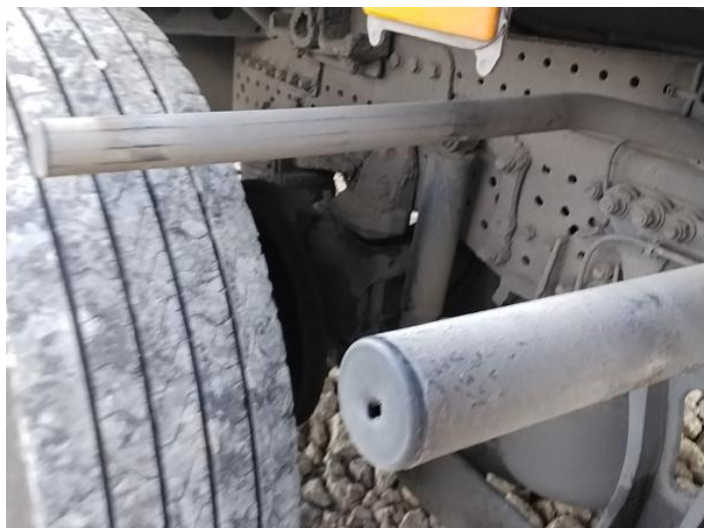
14: Wheel osr Missing Replace