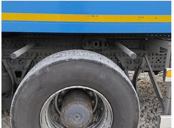
18: Other N/A N/A