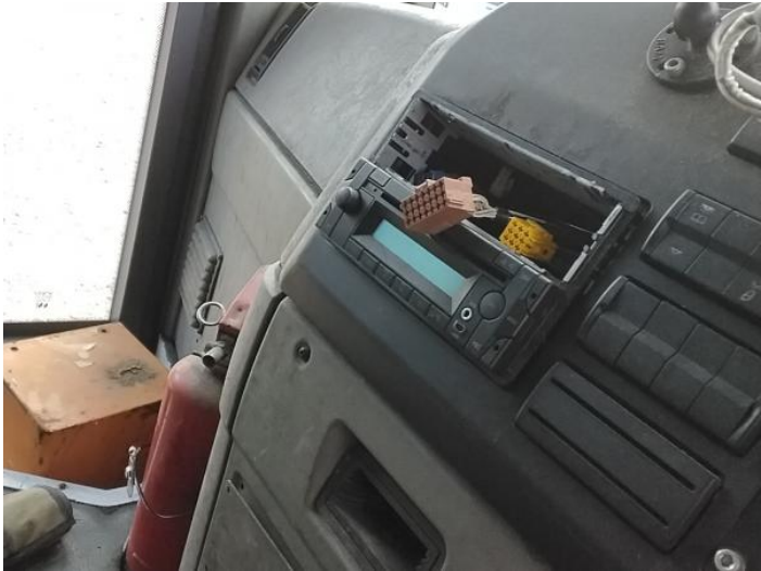
22: Other N/A N/A