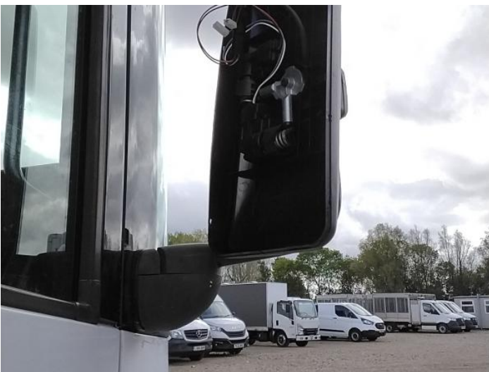
19: Door Mirror Glass os Missing Replace