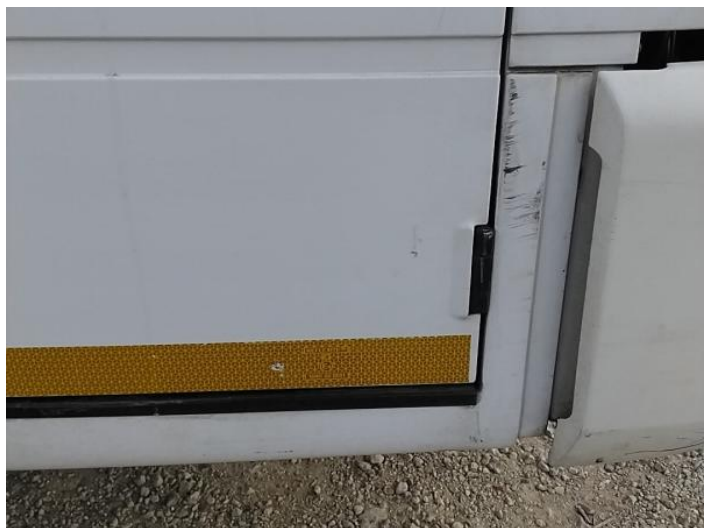
20: Door osf Scratched UpTo 25mm Thru Paint