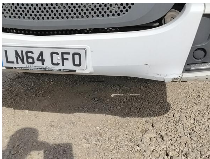
2: Bumper Front Cracked Up To 25mm