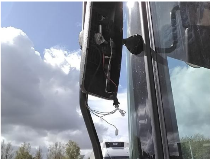
5: Door Mirror Glass ns Missing Replace