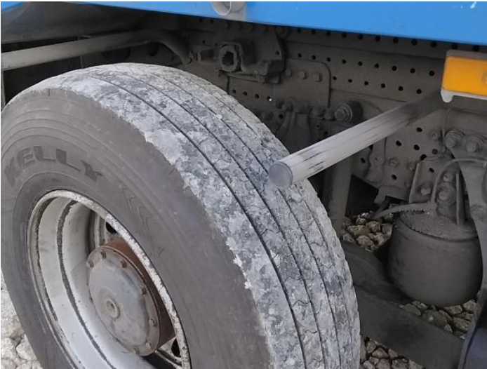
15: Other N/A N/A