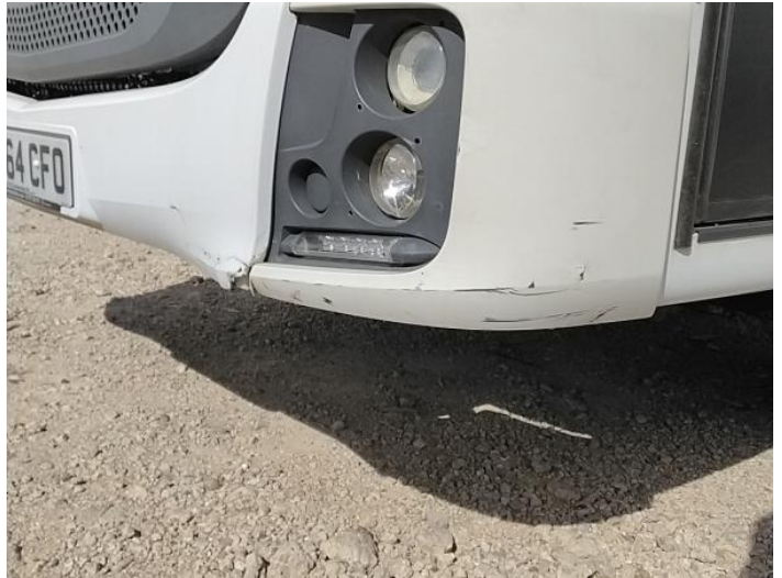
4: Fog Lamp Surround ns Scratched (Painted) Over 25mm Thru Paint