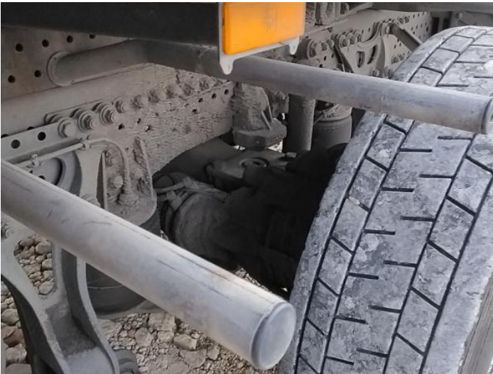
17: Wheel osr Missing Replace