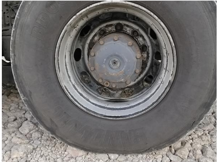
16: Other N/A N/A