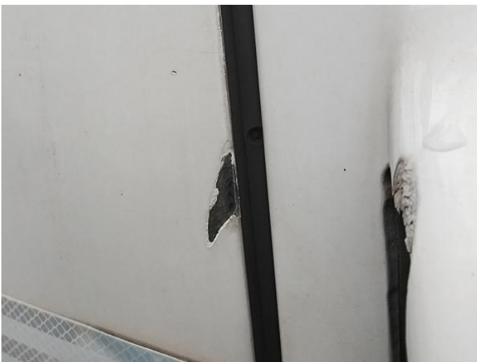
7: Door osf Chipped Over 5mm