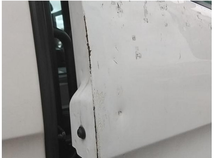
4: Door osf Chipped Edge Chip