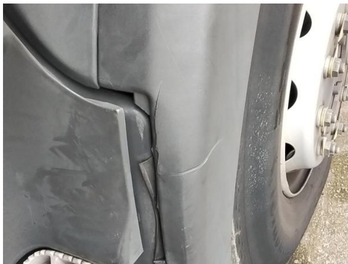
2: Moulding nsf Wing Broken Replace