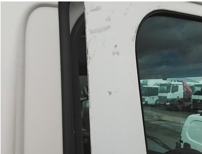
5: Door osf Chipped Edge Chip