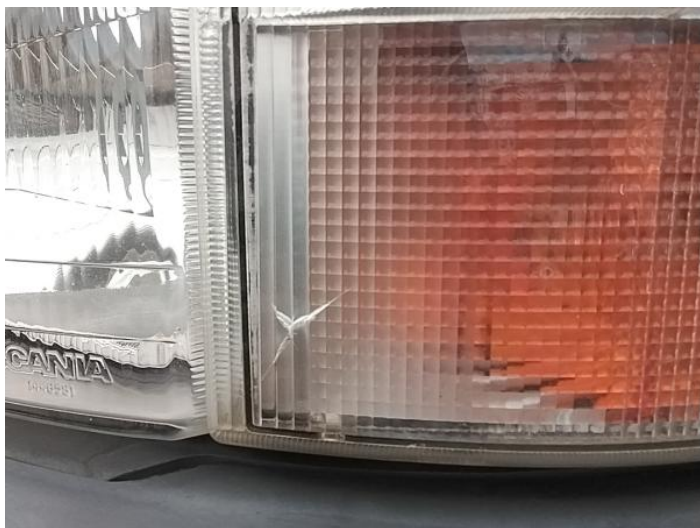
1: Headlamp ns Broken Replace