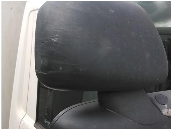
6: Door Mirror Assy osf Scuffed (Unpainted) Over 100mm