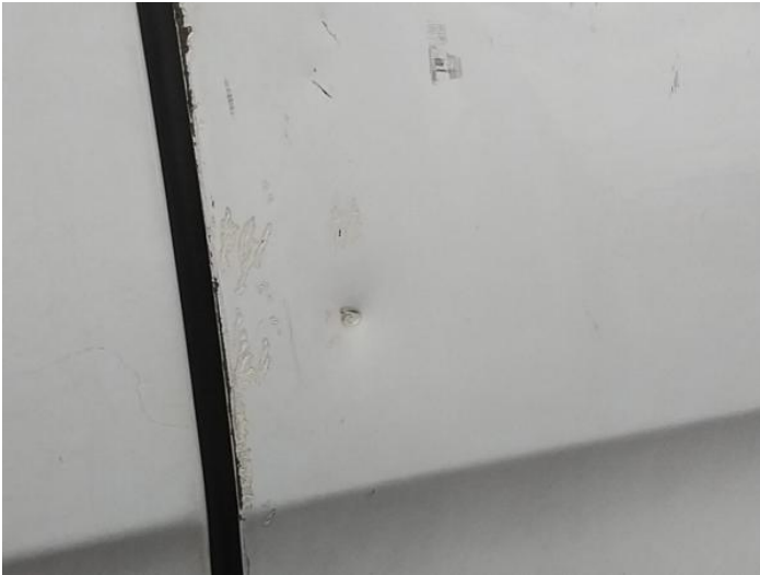
3: Door osf Dented Over 30mm