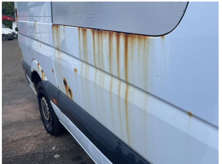
6: Qtr Panel osr Rusted Over 5mm