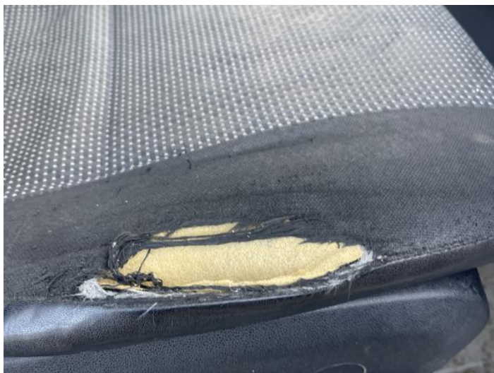
1: Seat Base Cover osf Torn Over 3mm