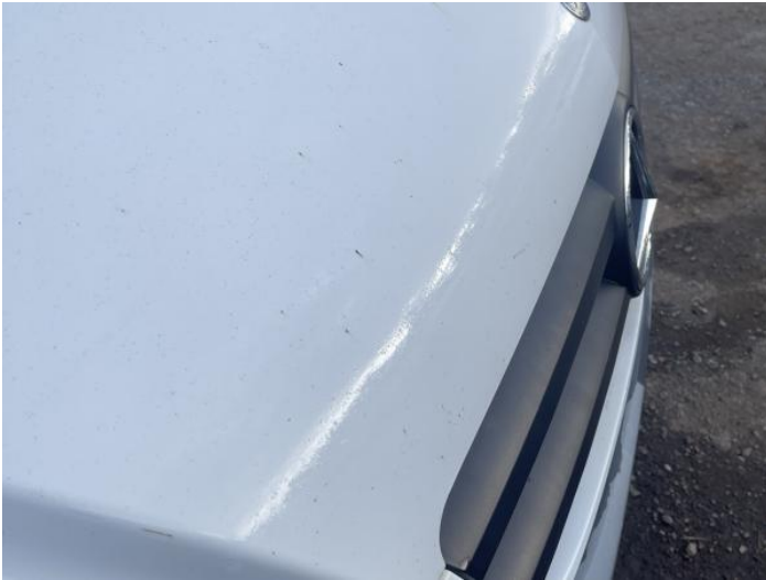
3: Bonnet Rusted Over 5mm