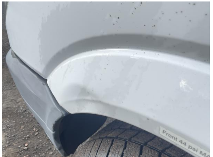
12: Wing nsf Dented With Paint Damage