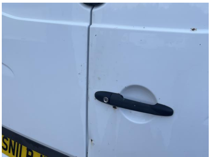
8: Tailgate Dented With Paint Damage