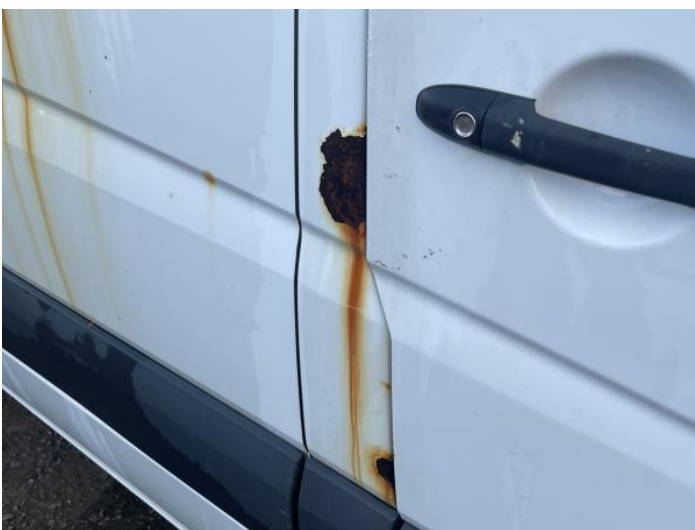
7: B Post os Rusted Over 5mm