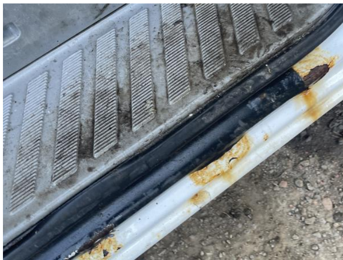
2: Sill os Rusted Over 5mm