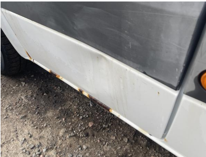
11: Door nsf Dented With Paint Damage