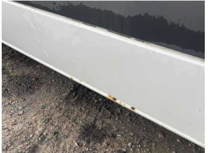
10: Sill ns Rusted Over 5mm