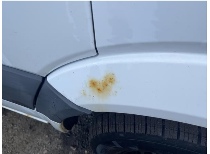
4: Wing osf Rusted Over 5mm