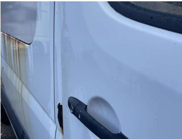
5: Door osf Dented Over 30mm