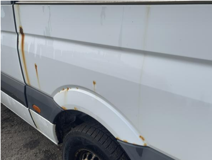
9: Qtr Panel nsr Rusted Over 5mm