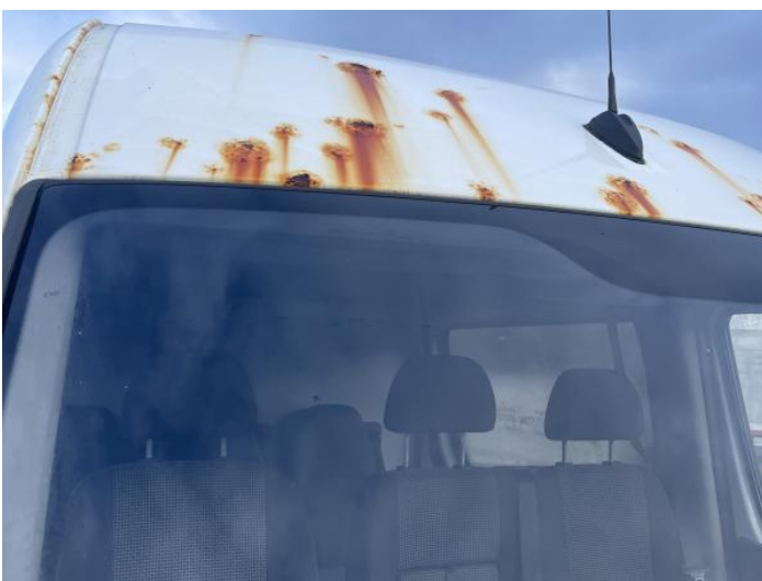
13: Roof Rusted Over 5mm