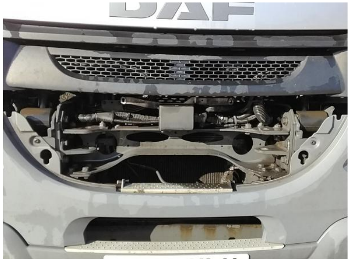
2: Grille Front Missing Replace