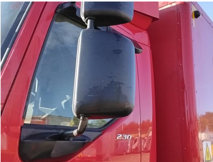
5: Door Mirror Assy nsf Scuffed (Unpainted) UpTo 100mm