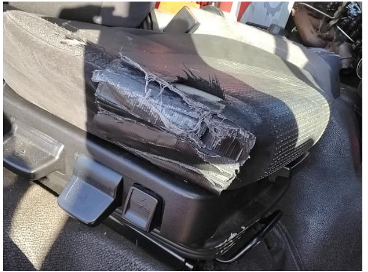
12: Seat Base Cover osf Torn Over 3mm