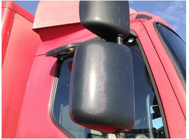
10: Door Mirror Assy osf Scuffed (Unpainted) UpTo 100mm