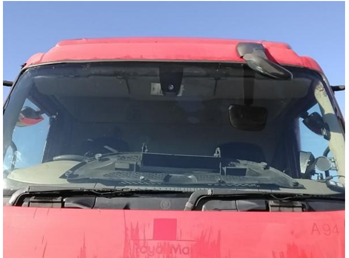
4: Screen Front Chipped Over 10mm