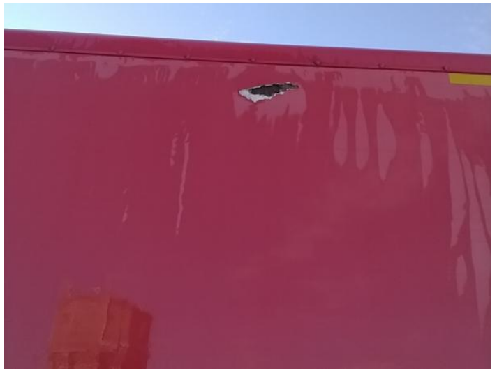
6: Qtr Panel nsr Scratched Over 25mm Thru Paint