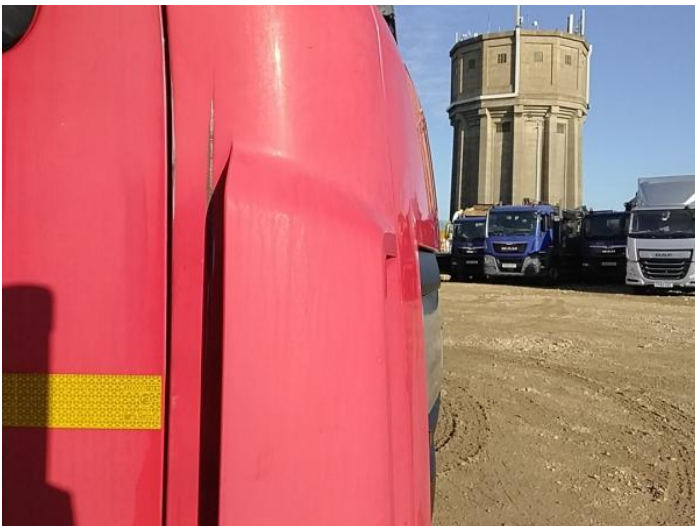
1: Wing osf Scratched Over 25mm Thru Paint