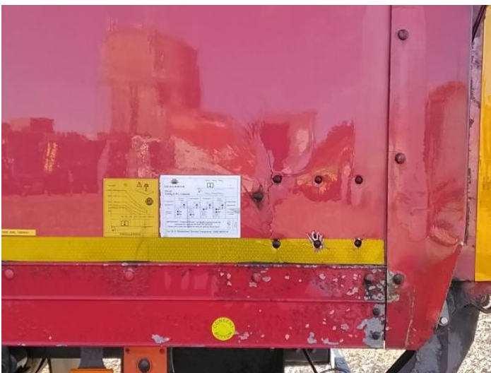
7: Qtr Panel nsr Cracked Replace