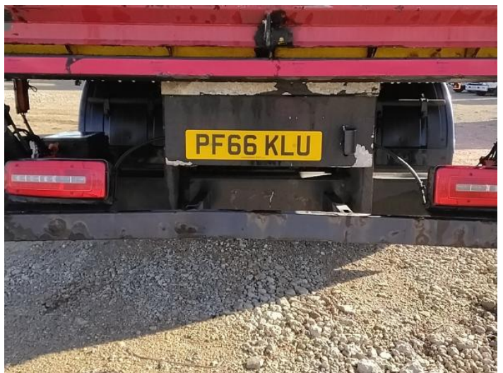
8: Bumper Rear Rusted Over 5mm