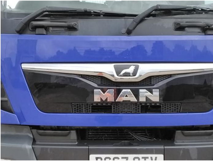
3: Bonnet Chipped Multiple Chips