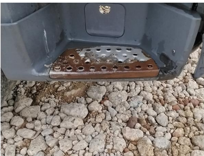
13: Other N/A N/A