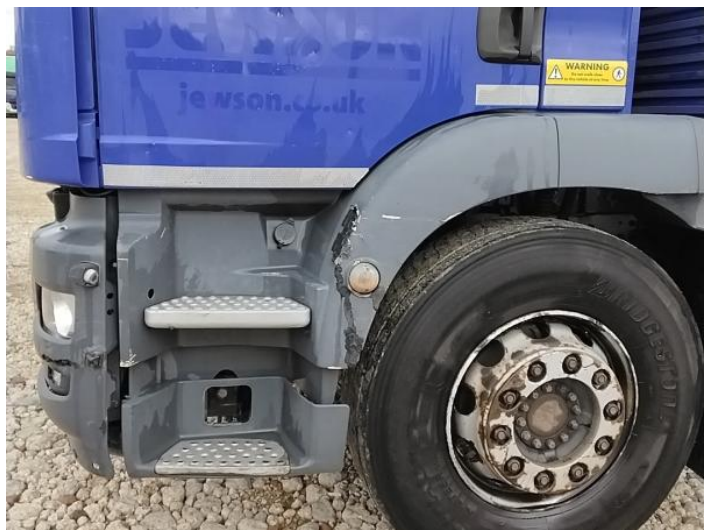
8: Other N/A N/A