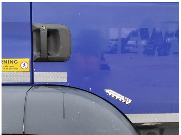
14: Door osf Scratched UpTo 25mm Thru Paint