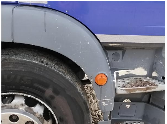
12: Other N/A N/A