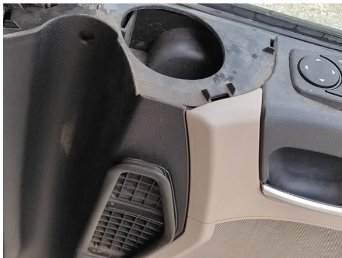
15: Seat Base Cover osf Holed Over 3mm