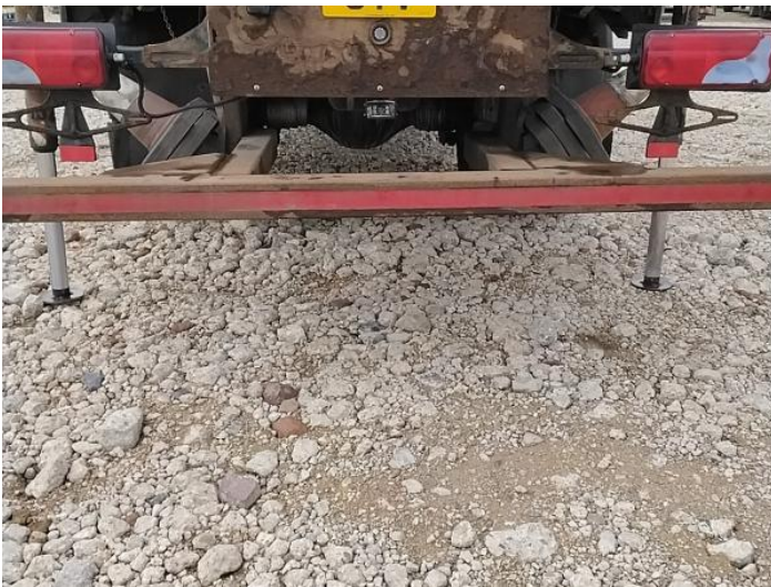
11: Bumper Rear Rusted Over 5mm