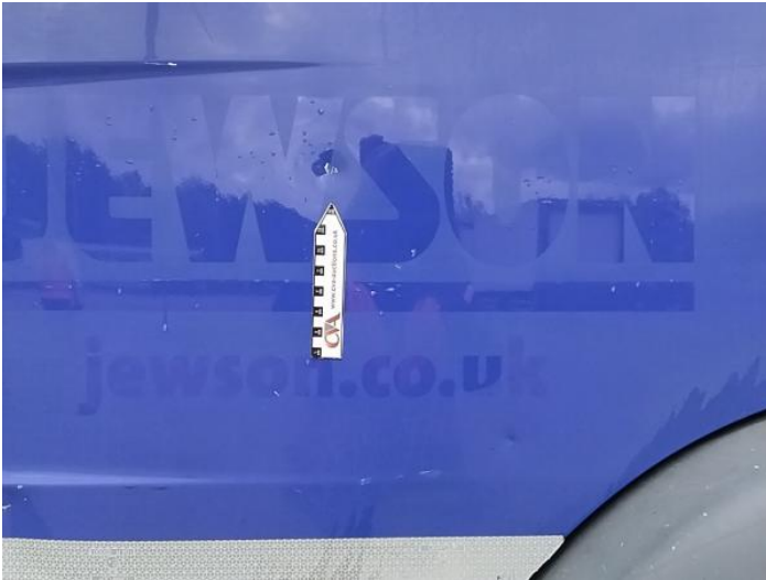
9: Door nsf Dented With Paint Damage