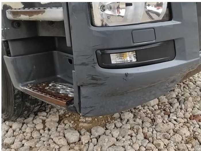
1: Fog Lamp Surround is Scuffed (Unpainted) Over 100mm