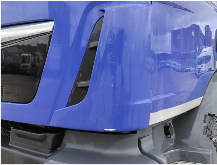
5: Wing nsf Scratched UpTo 25mm Thru Paint