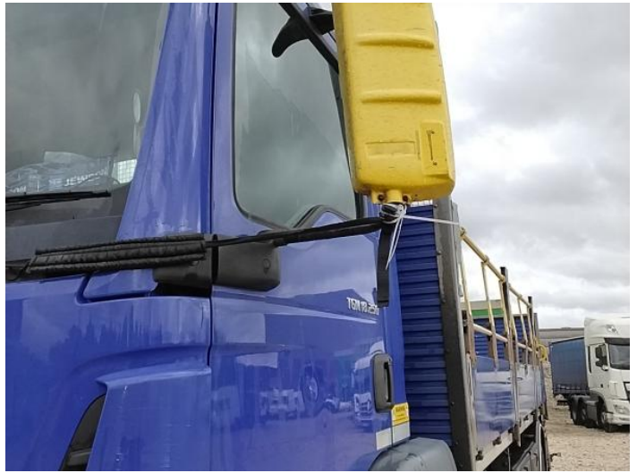
6: Door Mirror Assy nsf Broken Replace