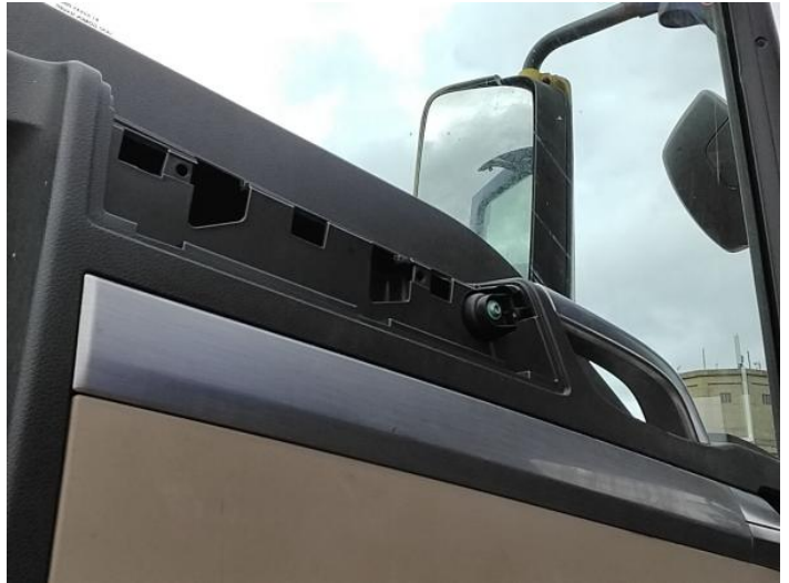
10: Door Pad nsf Missing Replace