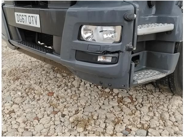
4: Fog Lamp Surround ns Broken Replace