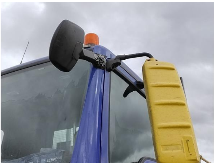
7: Door Mirror Assy nsf Missing Replace