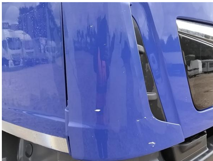
2: Wing is Scratched Up To 25mm Thru Paint