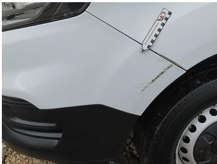
2: Bumper Front Scratched Over 25mm Not Thru Paint