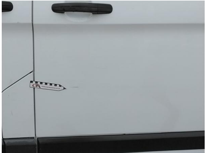
4: Door nsr Scratched UpTo 25mm Not Thru Paint