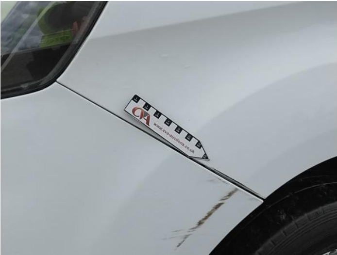
3: Wing nsf Scratched UpTo 25mm Not Thru Paint