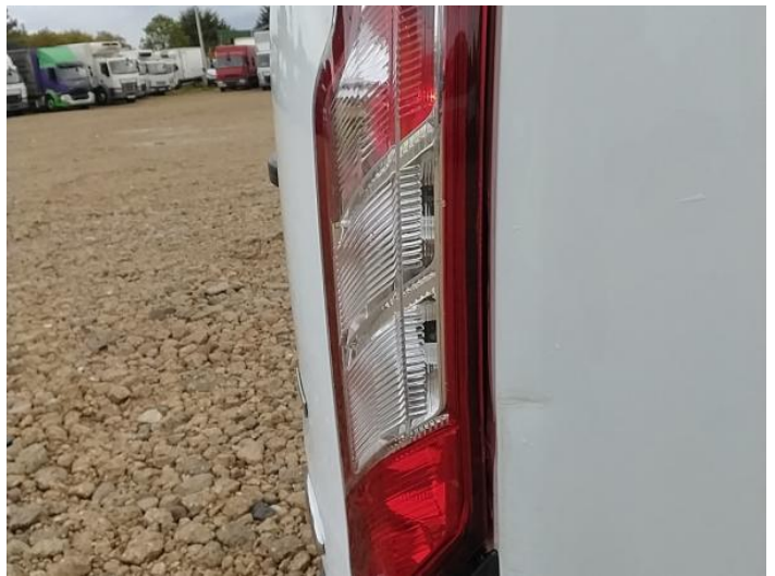
6: Lamp osr Broken Replace