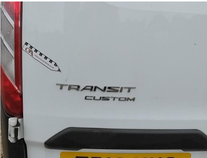
5: Door nsr Scratched UpTo 25mm Thru Paint