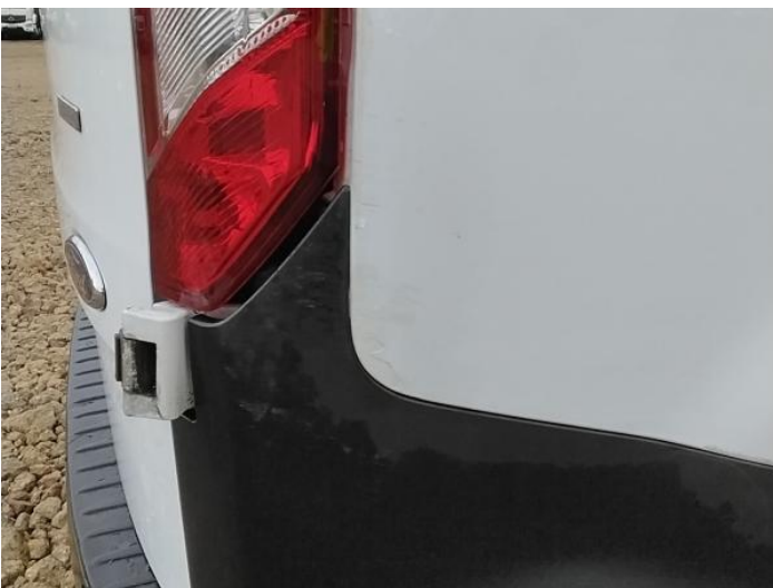
7: Qtr Panel osr Dented With Paint Damage