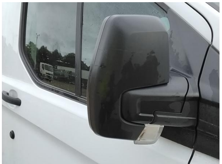
8: Door Mirror Assy osf Scuffed (Unpainted) UpTo 100mm