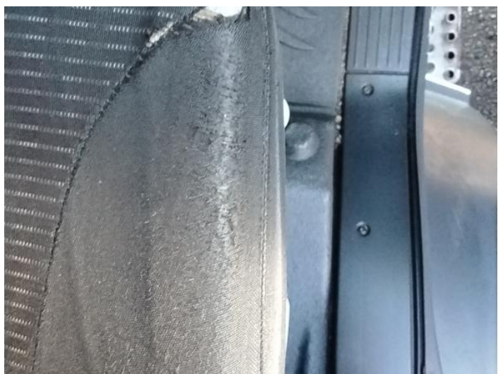
8: Seat Base Cover osf Torn Over 3mm