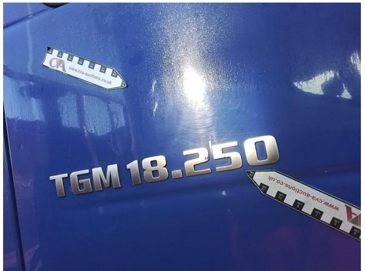
6: Door osf Scratched Over 25mm Thru Paint