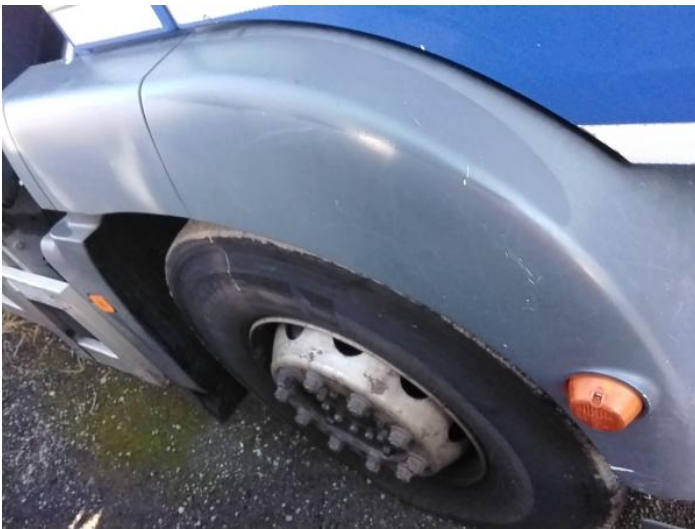
5: Wing osf Scratched Over 25mm Thru Paint