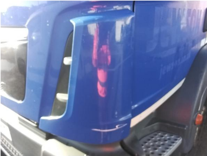
3: Panel Front Scratched Over 25mm Thru Paint