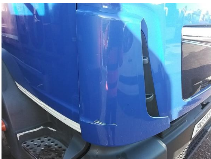
1: Panel Front Scratched Over 25mm Thru Paint