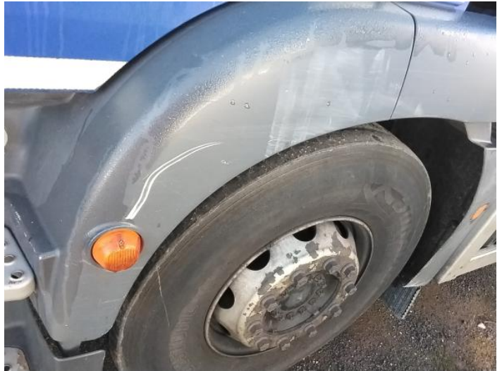
4: Wing nsf Scratched Over 25mm Thru Paint