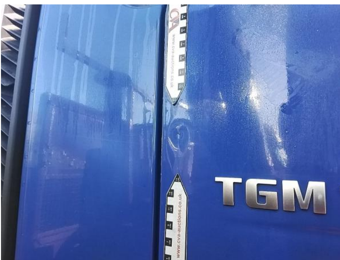
7: Door osf Dented Over 30mm