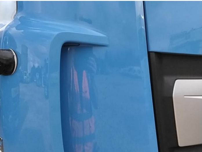
1: Wing osf Chipped Multiple Chips