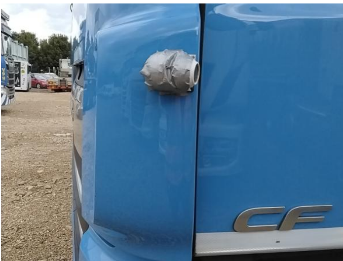
7: Other N/A N/A