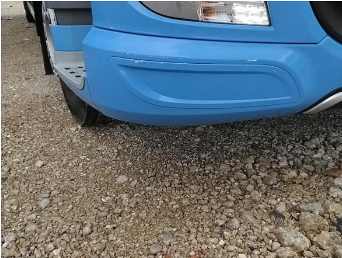
3: Bumper Front Chipped Multiple Chips