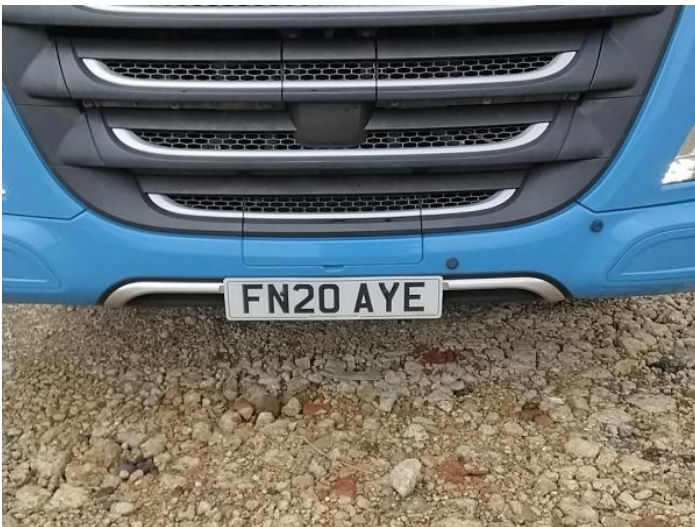
5: Bumper Front Chipped Multiple Chips