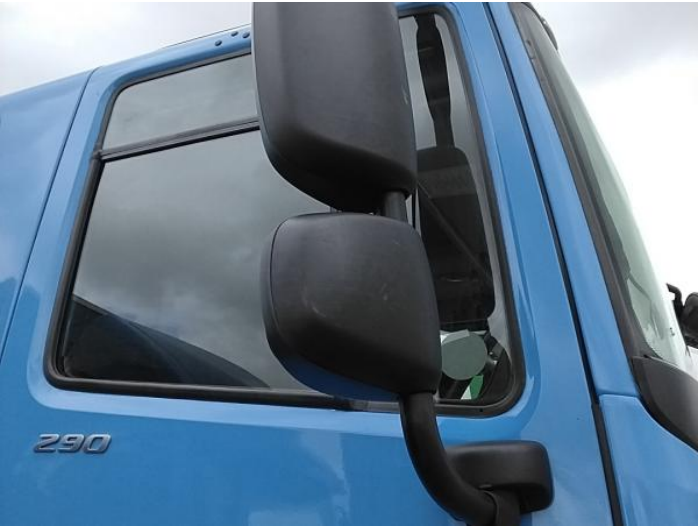
9: Other N/A N/A