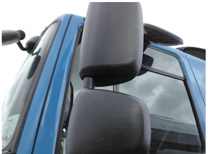
8: Door Mirror Assy nsf Scuffed (Unpainted) UpTo 100mm