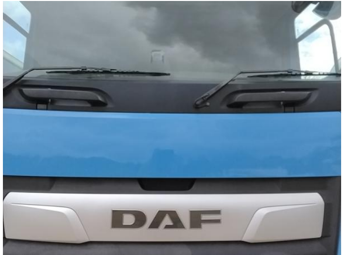
4: Bonnet Chipped Multiple Chips