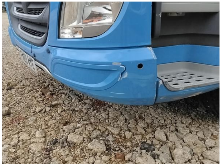
6: Bumper Front Scratched 25 to 100mm Thru Paint