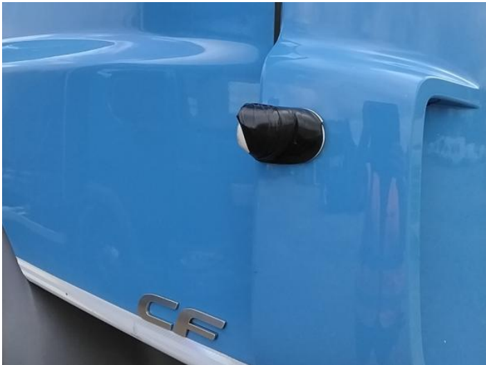
2: Other N/A N/A