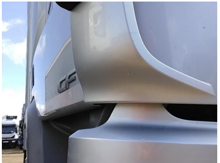
2: Wing osf Scratched UpTo 25mm Thru Paint