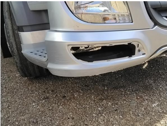
1: Bumper Front Moulding Missing Replace