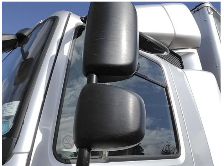
6: Door Mirror Assy nsf Scuffed (Unpainted) UpTo 100mm