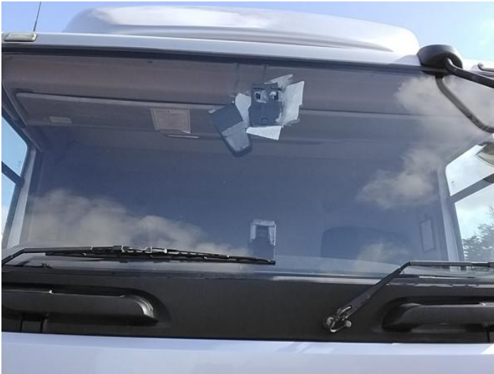
3: Screen Front Chipped UpTo 10mm