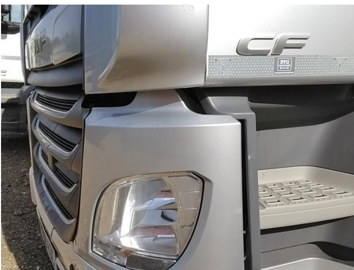
7: Fog Lamp Surround ns Scratched (Painted) UpTo 25mm Not Thru Paint