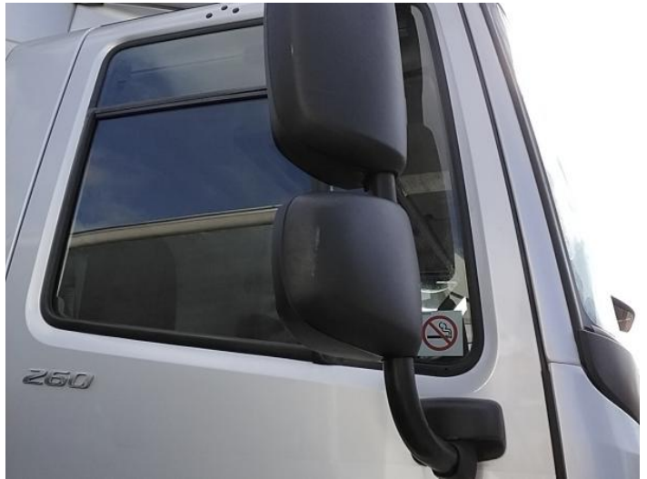
12: Door Mirror Assy osf Scuffed (Unpainted) UpTo 100mm