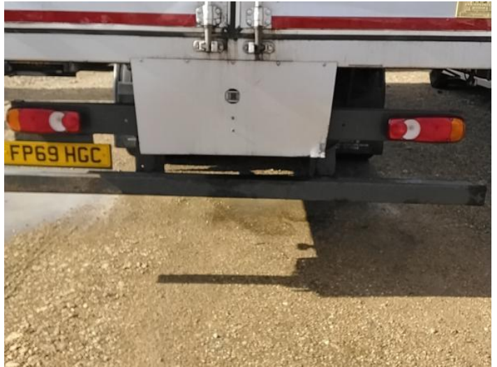
10: Bumper Rear Rusted Over 5mm