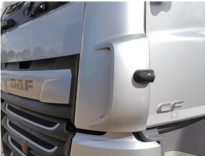
5: Wing nsf Scratched UpTo 25mm Thru Paint