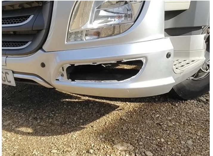
4: Bumper Front Moulding Missing Replace