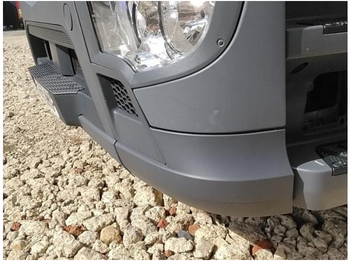
4: Fog Lamp Surround ns Scuffed (Unpainted) UpTo 100mm