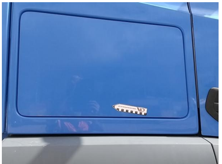
14: Other N/A N/A