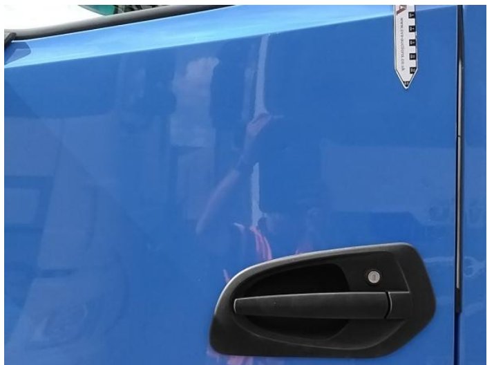
8: Door nsf Dented 2 Or Less UpTo 10mm