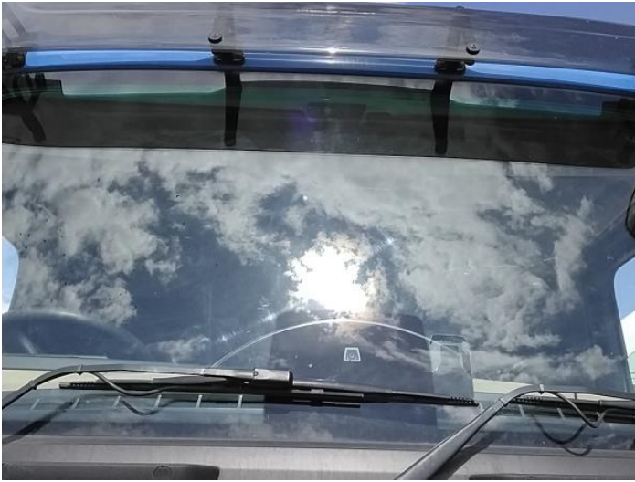
3: Screen Front Chipped UpTo 10mm