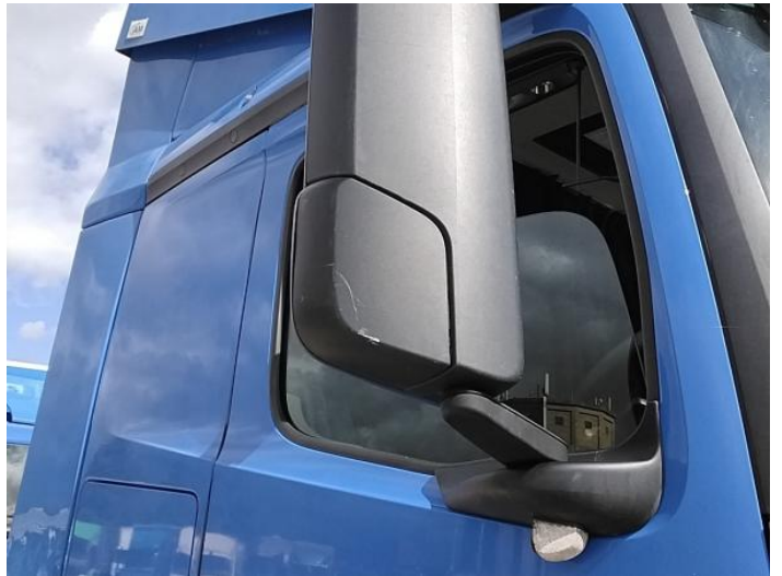
12: Door Mirror Assy osf Scuffed (Unpainted) UpTo 100mm