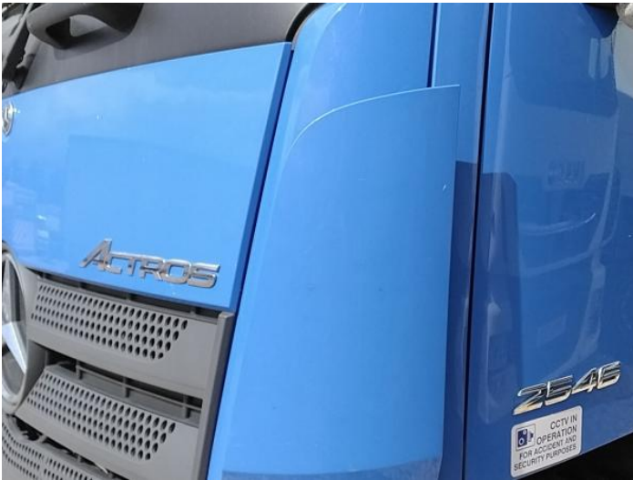
5: Wing nsf Chipped Multiple Chips