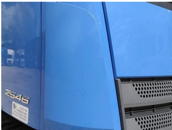
1: Wing osf Chipped Multiple Chips