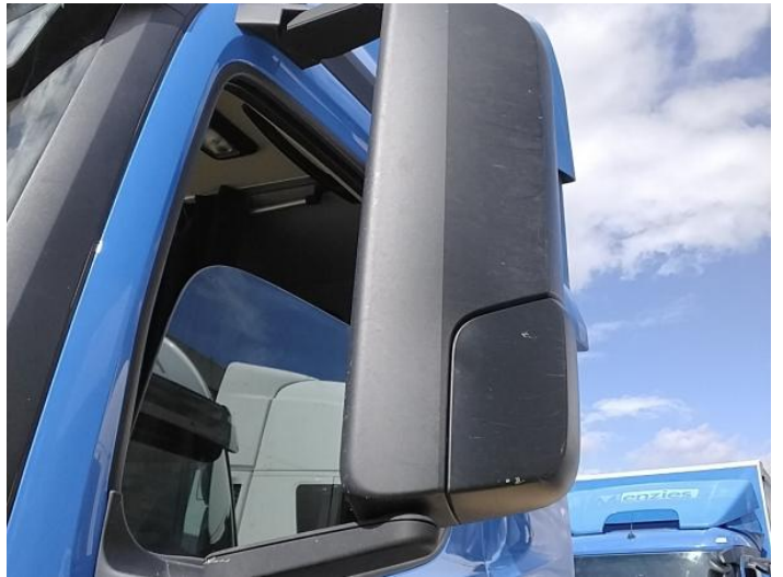
6: Door Mirror Assy osf Scuffed (Unpainted) UpTo 100mm