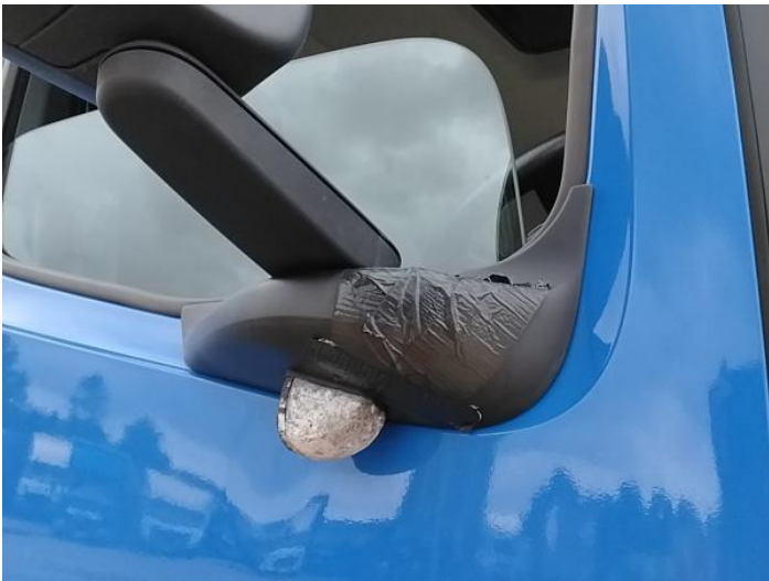
7: Door Mirror Assy osf Broken Replace