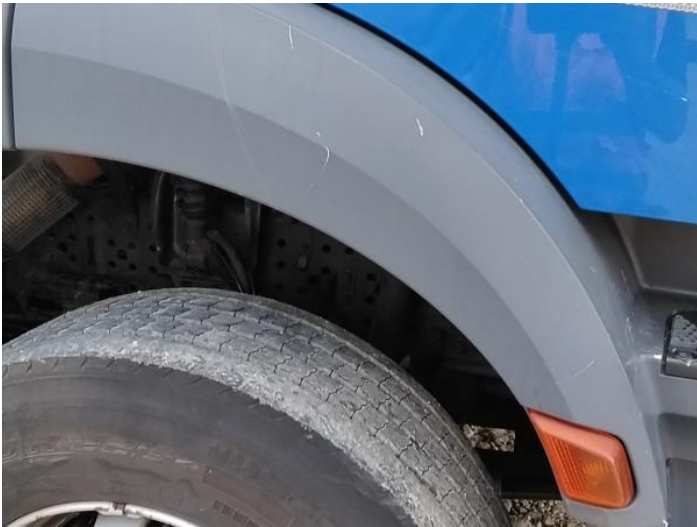
5: Other N/A N/A