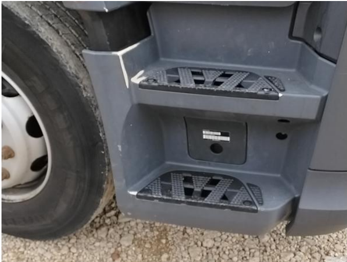
4: Other N/A N/A