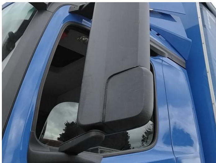
2: Door Mirror Assy nsf Scuffed (Unpainted) UpTo 100mm