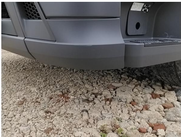
1: Bumper Front Moulding Scuffed (Unpainted) UpTo 100mm