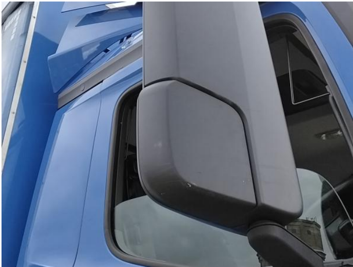
6: Door Mirror Assy osf Scuffed (Unpainted) UpTo 100mm