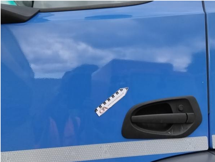
3: Door nsf Dented 2 Or Less UpTo 10mm