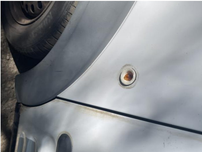
5: Flasher Side Repeater ns Broken Replace

Carpet Condition Average Seat Condition Average