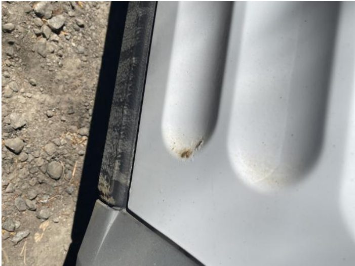
4: Door nsr Rusted Over 5mm