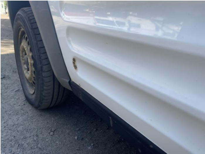
3: Qtr Panel osr Rusted Over 5mm