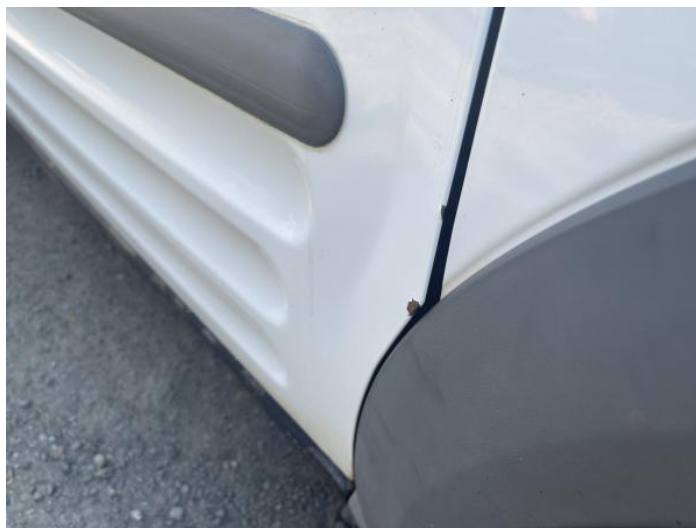
2: Door osf Dented Over 30mm