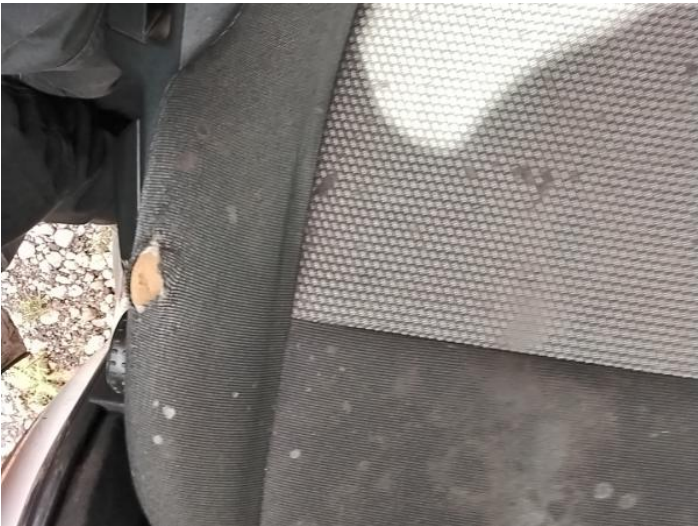
1: Seat Base Cover osf Holed Over 3mm