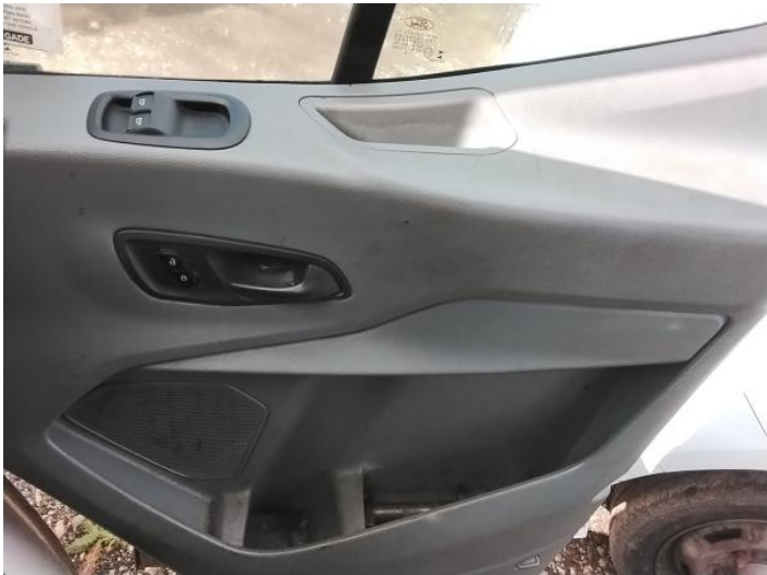
2: Door Pad osf Soiled Heavy