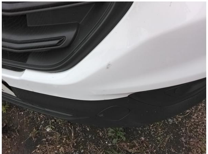
2: Panel Front Chipped Over 5mm