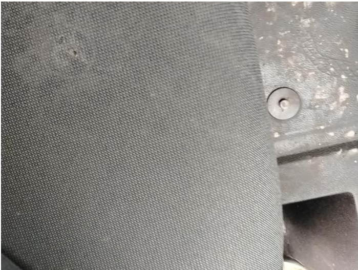
5: Seat Base Cover osf Burn Over 3mm