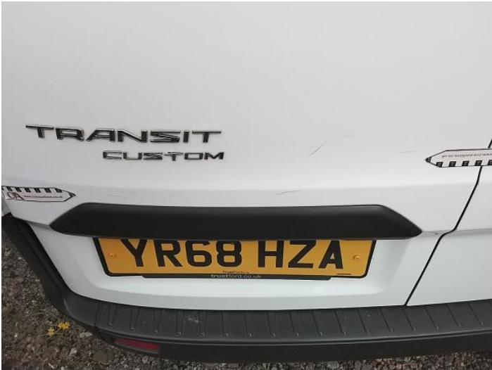
3: Door nsr Scratched Over 25mm Not Thru Paint