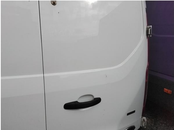
4: Door osr Chipped Multiple Chips