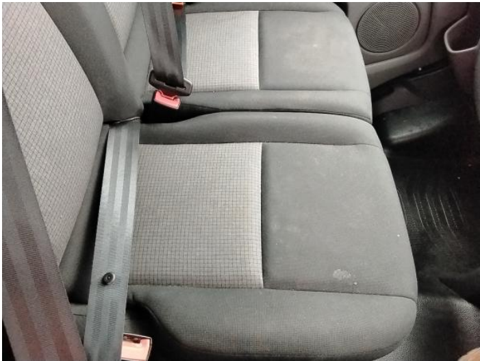
6: Seat Base Cover nsf Soiled Heavy