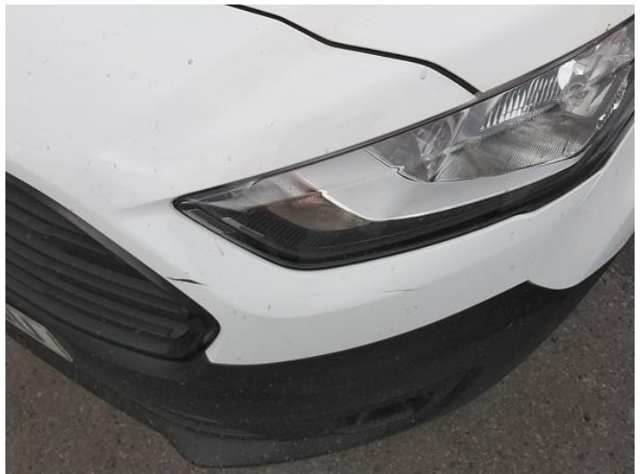
2: Panel Front Scratched Over 25mm Thru Paint