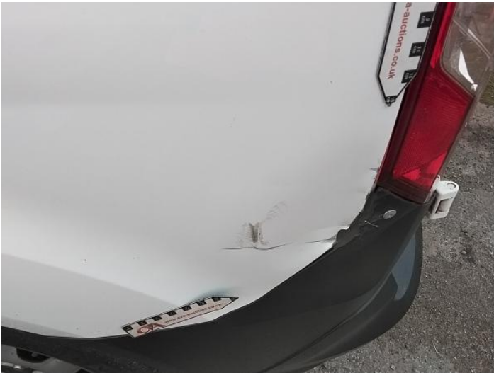
5: Qtr Panel nsr Dented With Paint Damage