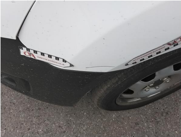
3: Wing nsf Dented With Paint Damage