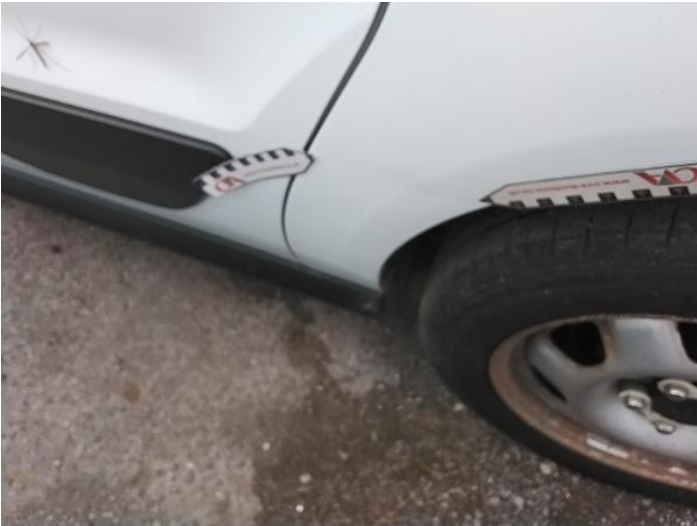
4: Qtr Panel nsr Dented Over 30mm