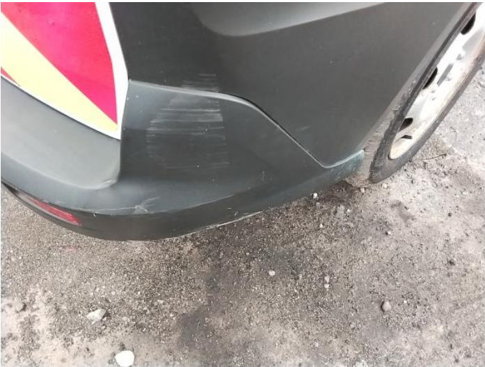
6: Bumper Rear Scratched Over 100mm Thru Paint