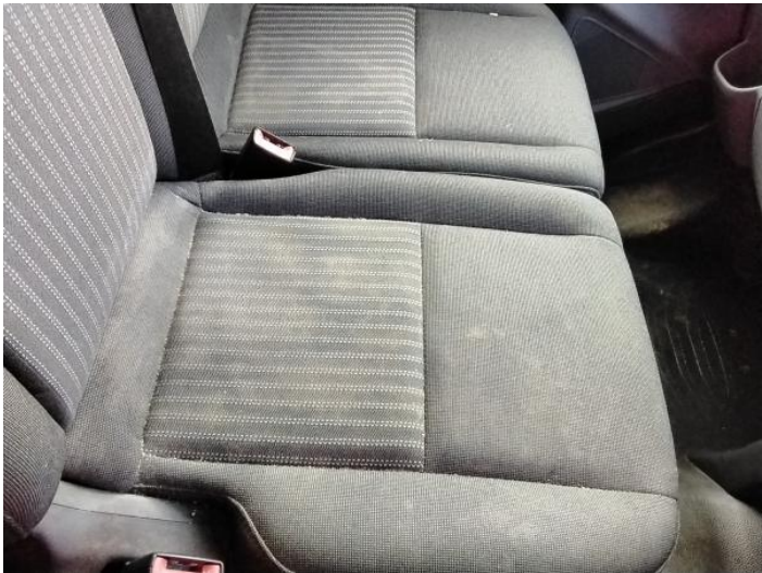
6: Seat Base Cover nsf Soiled Heavy