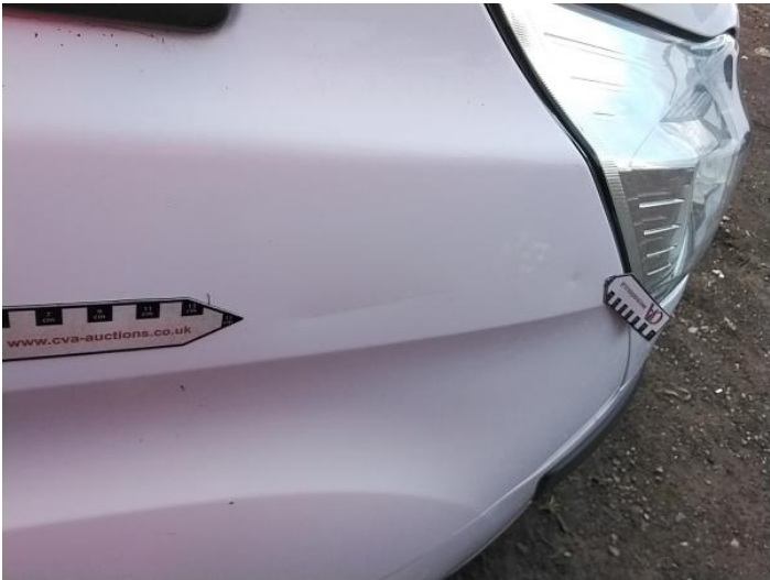
5: Wing osf Dented Over 30mm