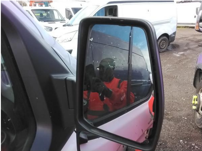
4: Door Mirror Glass os Broken Replace