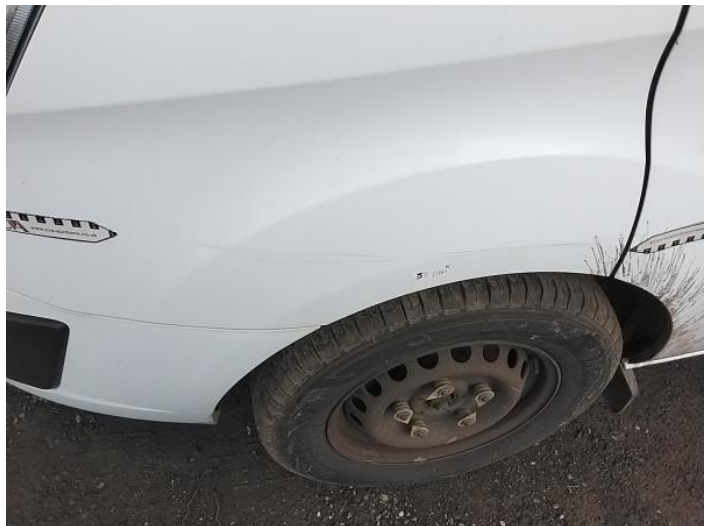
2: Wing nsf Scratched Over 25mm Not Thru Paint