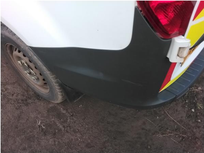
3: Qtr Panel Moulding ns Scuffed (Unpainted) Over 100mm