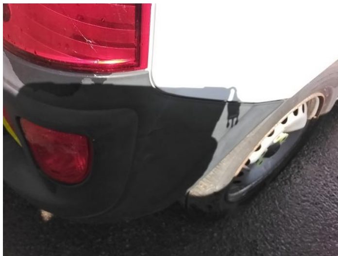
2: Bumper Rear Dented Over 30mm