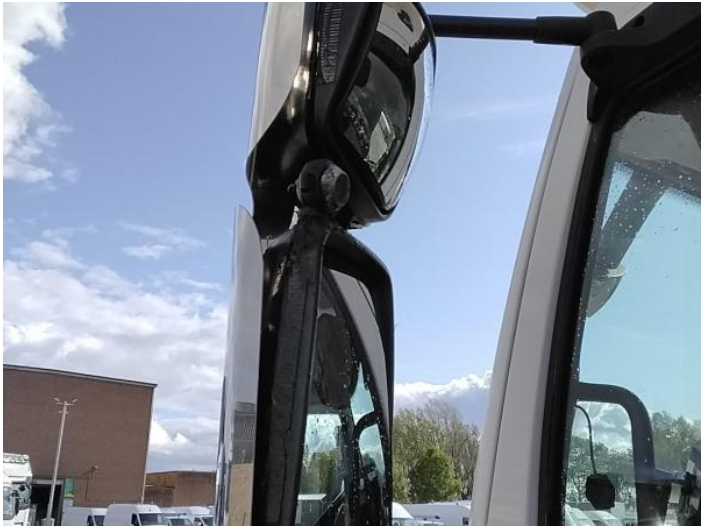
4: Door Mirror Assy nsf Broken Replace