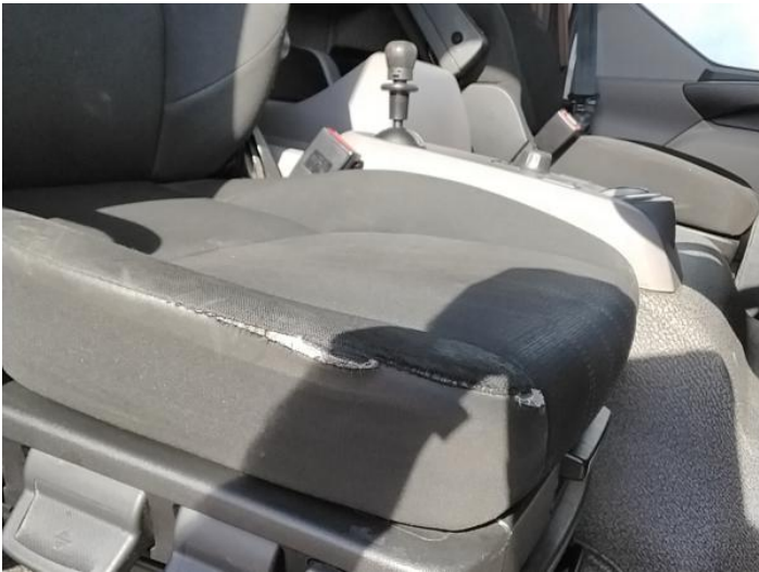
5: Seat Base Cover osf Torn Over 3mm