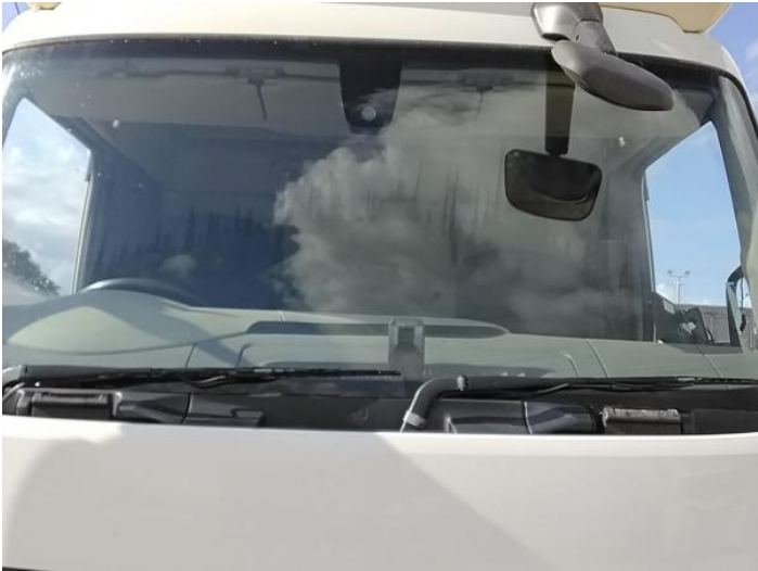
3: Screen Front Chipped UpTo 10mm