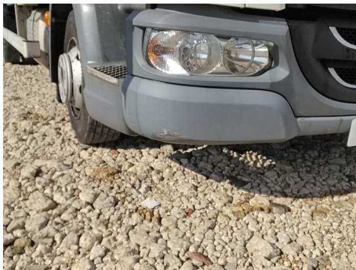
2: Bumper Front Moulding Scuffed (Unpainted) UpTo 100mm