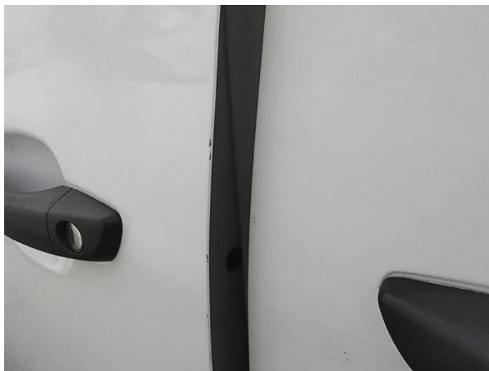
2: Door nsf Chipped Edge Chip