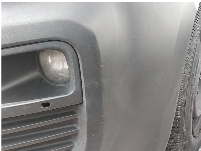
1: Bumper Front Moulding Scuffed (Unpainted) UpTo 100mm