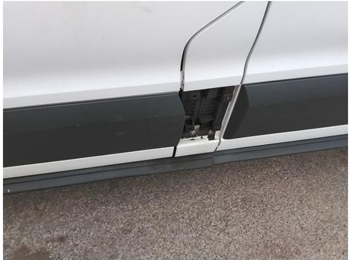
10: Door Moulding nsf Missing Replace