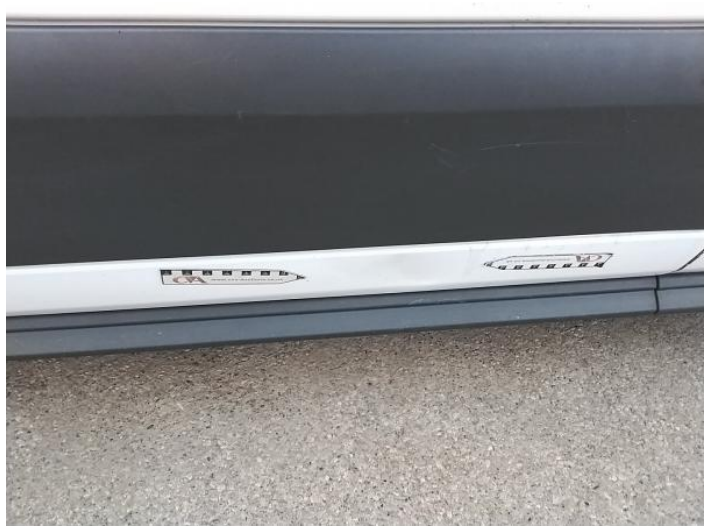
16: Qtr Panel osr Dented Over 30mm