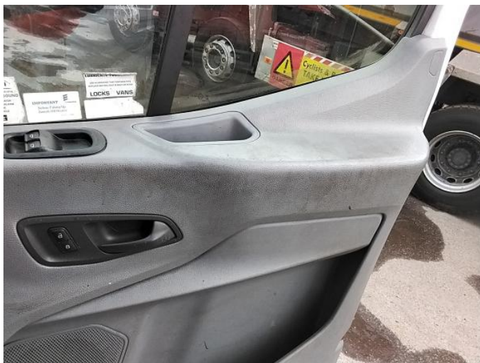
1: Door Pad osf Soiled Heavy