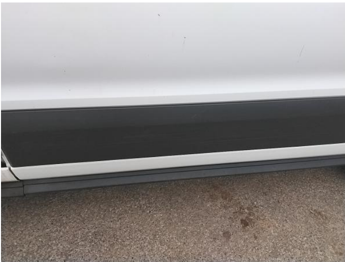
11: Qtr Panel Moulding ns Scuffed (Unpainted) Over 100mm