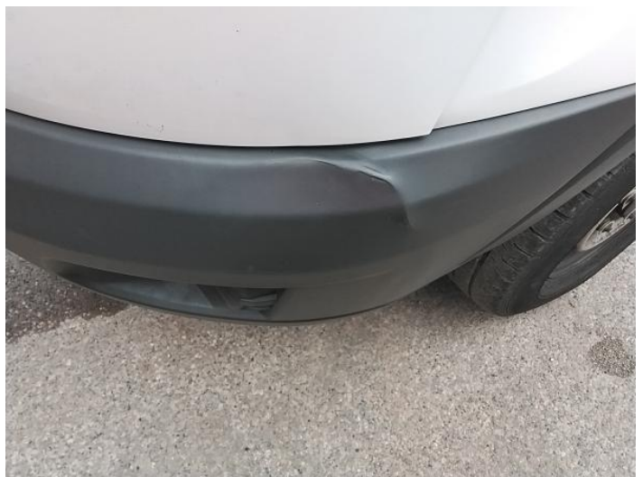
8: Bumper Front Dented Over 30mm