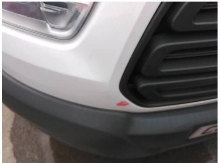
6: Panel Front Scratched Over 25mm Thru Paint