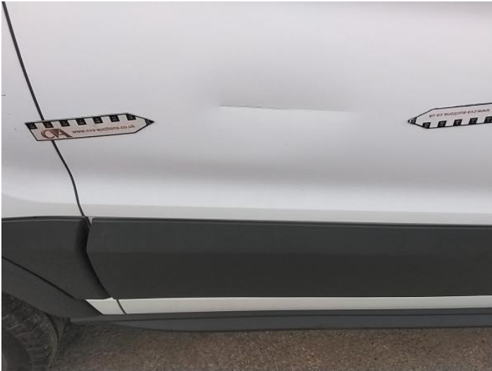
15: Qtr Panel osr Dented With Paint Damage