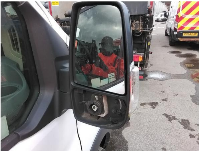
17: Door Mirror Glass os Missing Replace