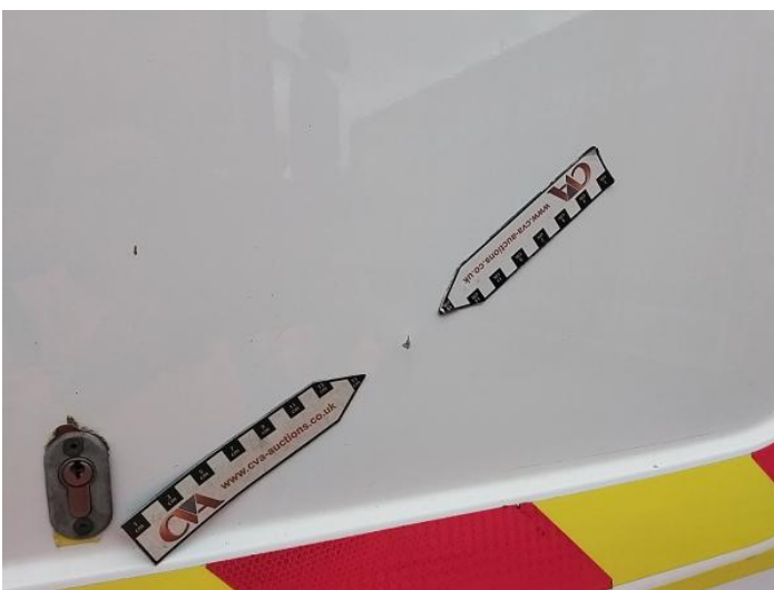
13: Door osr Dented With Paint Damage