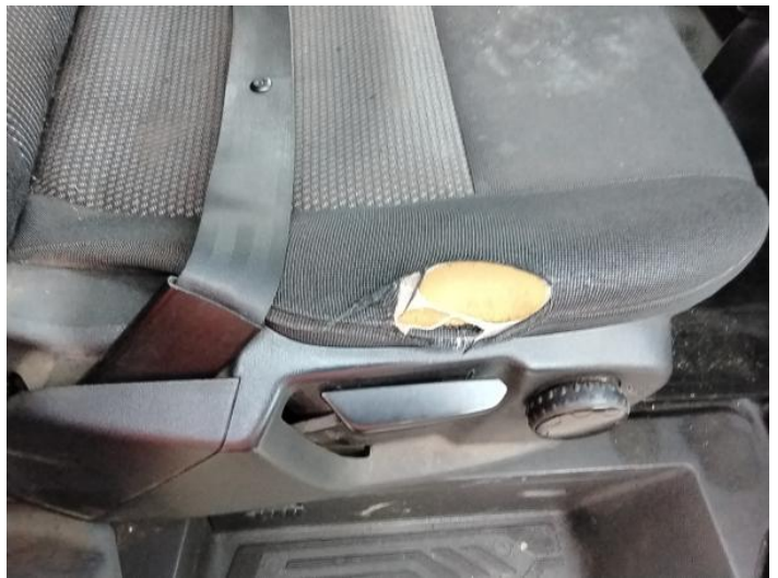
18: Seat Base Cover osf Holed Over 3mm