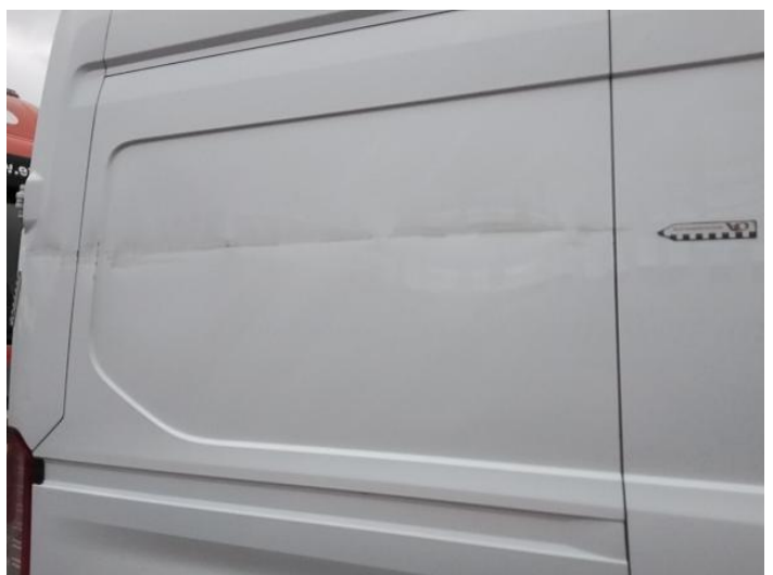
14: Qtr Panel osr Dented With Paint Damage