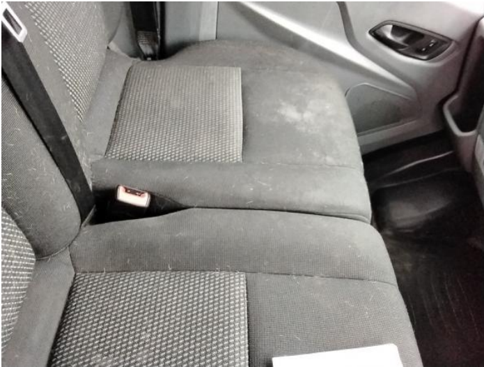
3: Seat Base Cover nsf Soiled Heavy