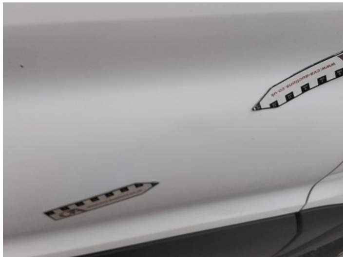
12: Qtr Panel nsr Dented Over 30mm