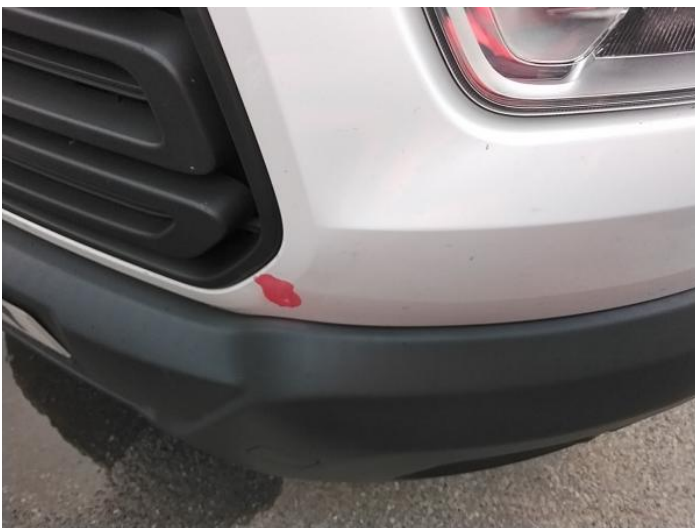
7: Panel Front Scratched Over 25mm Thru Paint