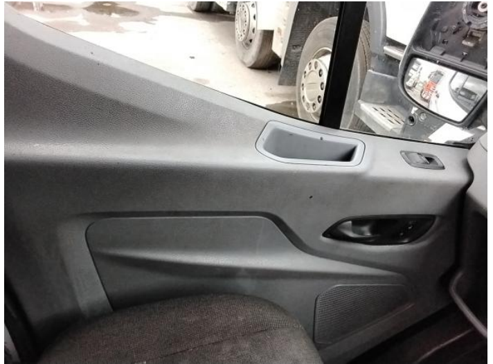
4: Door Pad nsf Soiled Heavy