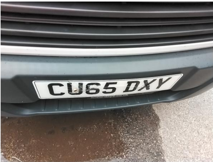
5: Number Plate Front Broken Replace