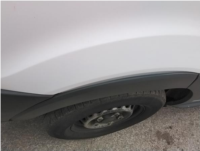
9: Wing Front Arch Extension ns Broken Replace