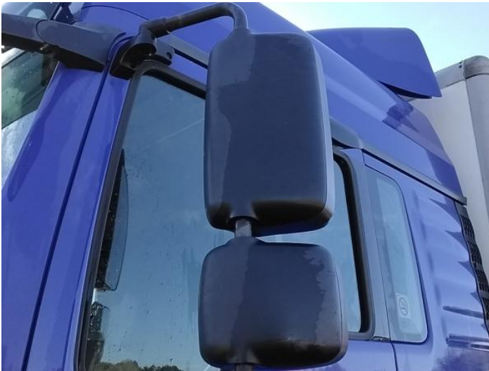
5: Door Mirror Assy nsf Scuffed (Unpainted) UpTo 100mm