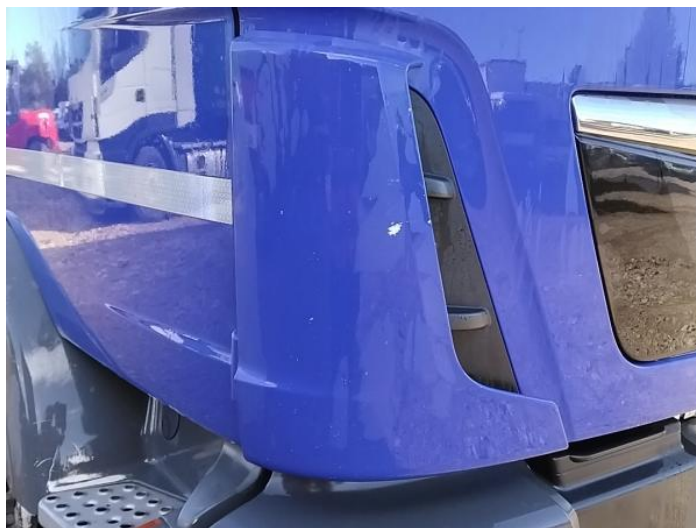
2: Wing osf Scratched UpTo 25mm Thru Paint