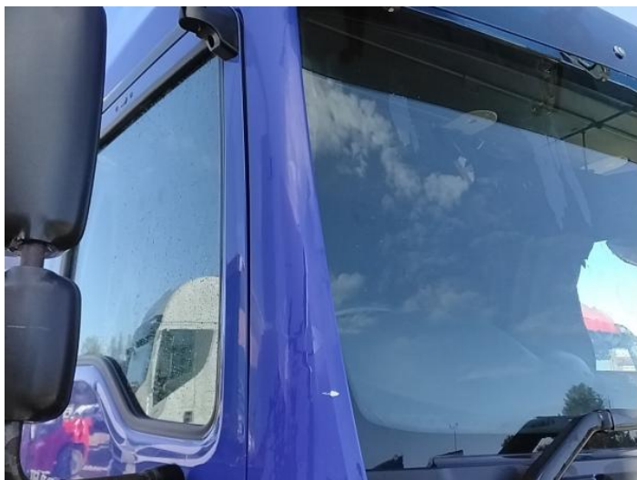
1: A Post os Scratched UpTo 25mm Thru Paint