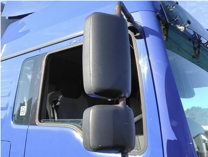
9: Door Mirror Assy osf Scuffed (Unpainted) UpTo 100mm