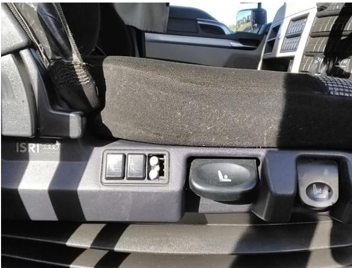
11: Other N/A N/A