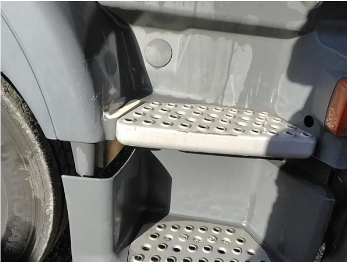
10: Other N/A N/A