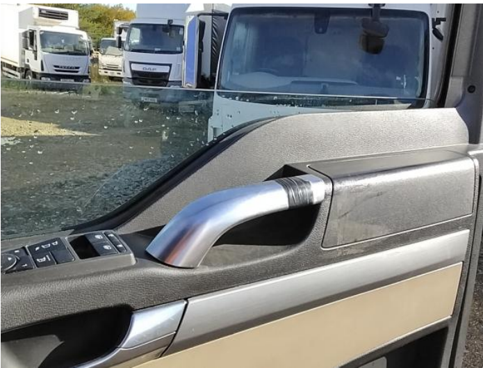
12: Handle Inner osf Damaged Replace