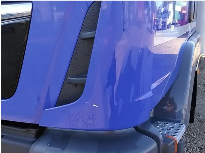
4: Wing nsf Scratched UpTo 25mm Thru Paint