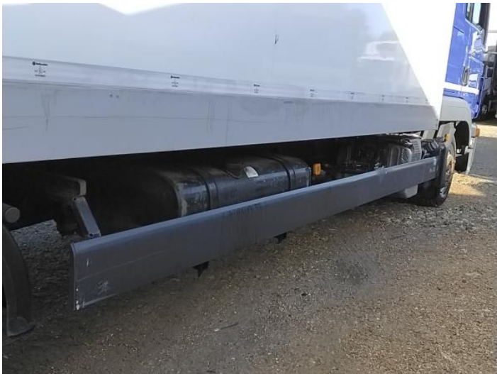
8: Other N/A N/A