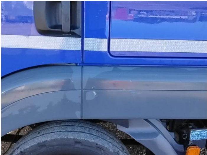
6: Other N/A N/A