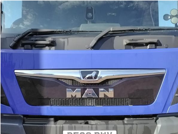
3: Bonnet Chipped Multiple Chips