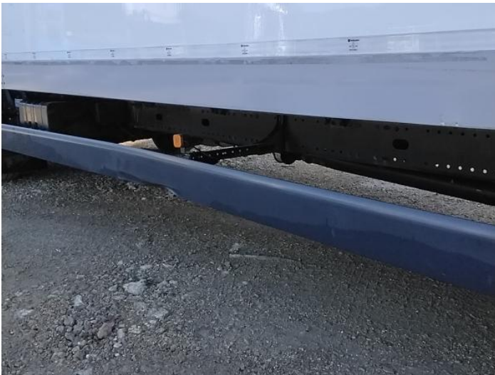
7: Other N/A N/A