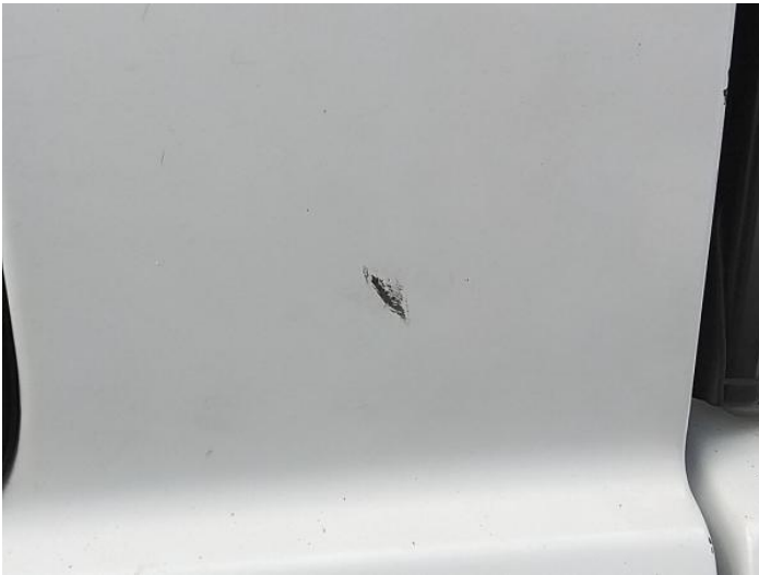
5: Door nsf Scratched UpTo 25mm Thru Paint