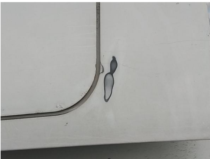
7: Roof Scratched Over 25mm Thru Paint