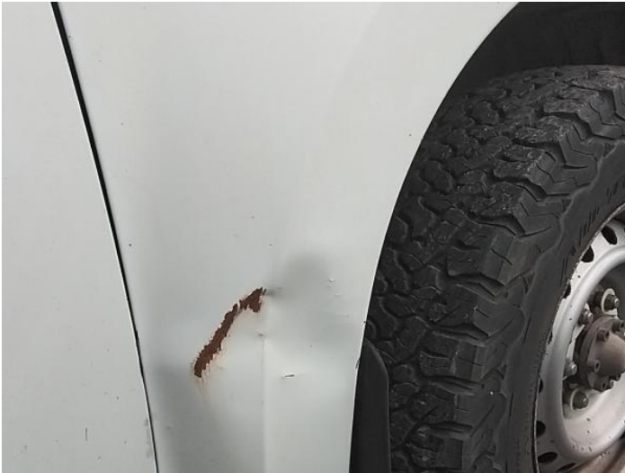
3: Wing osf Dented With Paint Damage