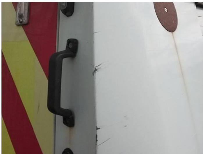
1: Boot Lid Scratched Over 25mm Thru Paint