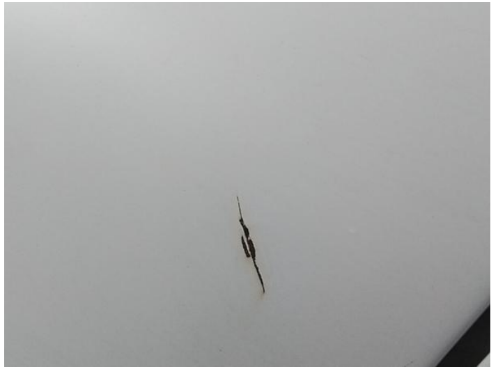
6: Wing nsf Scratched Rusted