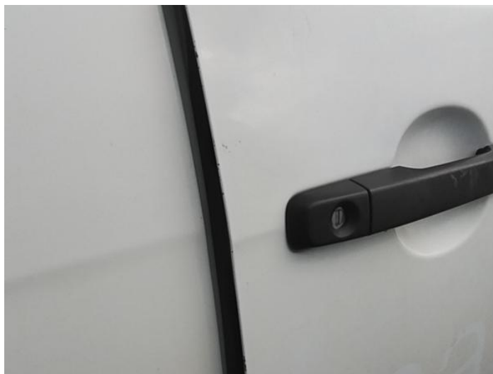
2: Door osf Chipped Edge Chip