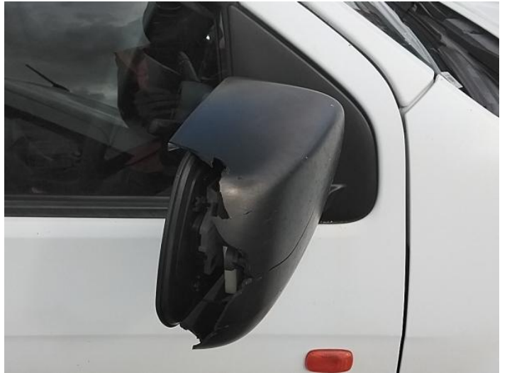
4: Door Mirror Assy osf Broken Replace