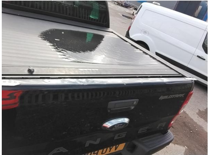
4: Tailgate Dented With Paint Damage