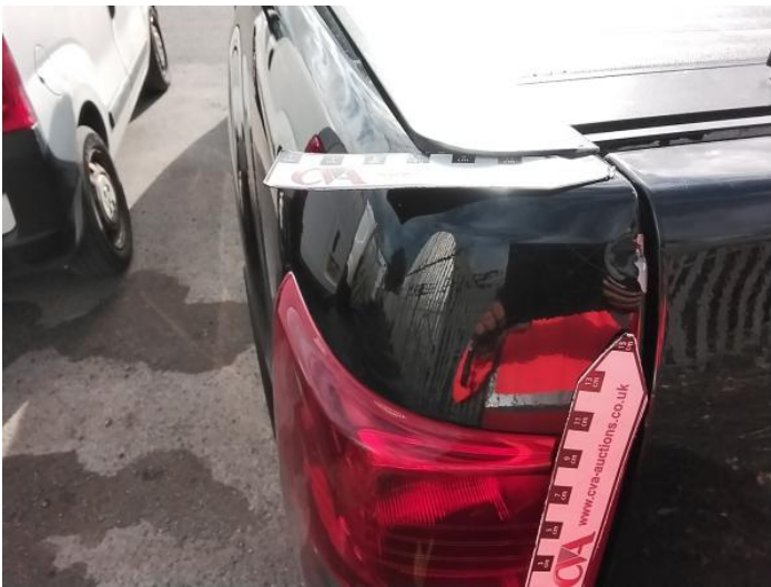
5: Qtr Panel nsr Dented With Paint Damage