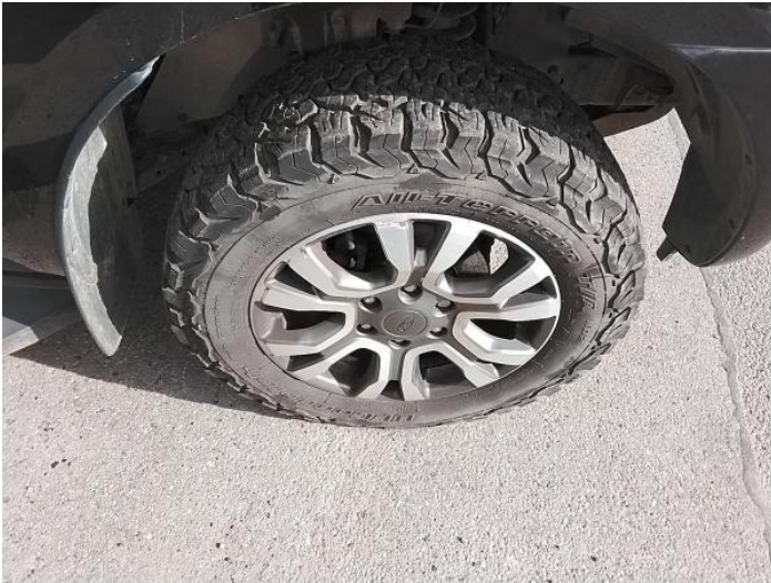
9: Wheel osf Scratched Over 50mm