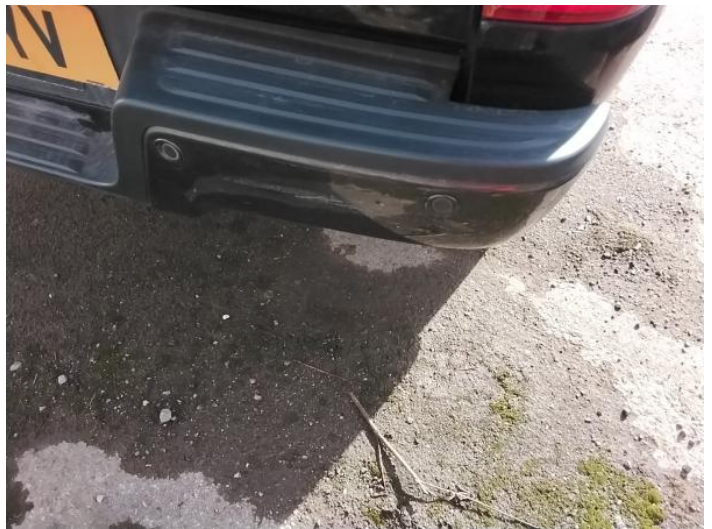
6: Bumper Rear Scratched Over 100mm Thru Paint