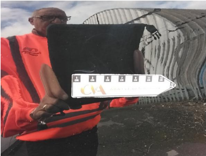
3: Qtr Panel nsr Scratched Over 25mm Thru Paint