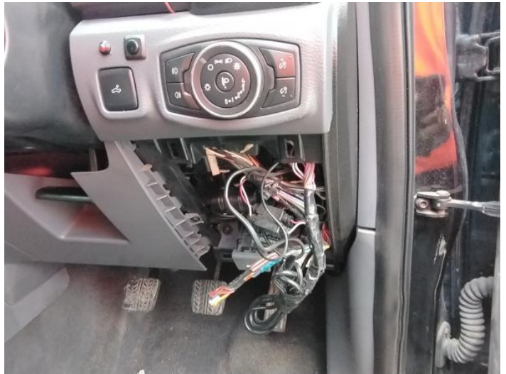
12: Fascia Panel Missing Replace