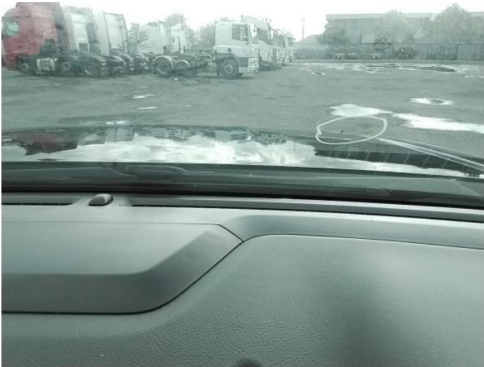
11: Screen Front Chipped Over 10mm