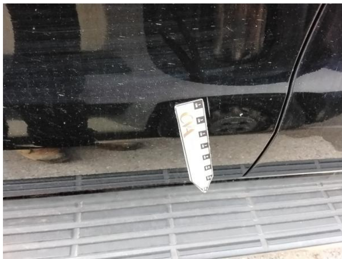
2: Door nsf Scratched Over 25mm Thru Paint