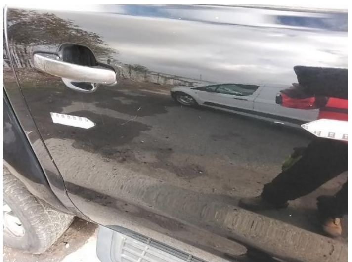
8: Door osr Scratched Over 25mm Thru Paint