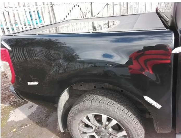
7: Qtr Panel osr Scratched Over 25mm Thru Paint