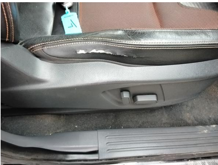
13: Seat Base Cover osf Torn Over 3mm