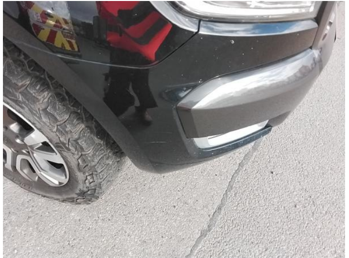
10: Bumper Front Scratched Over 100mm Thru Paint