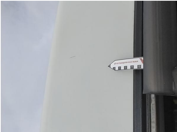
2: Roof Scratched UpTo 25mm Thru Paint