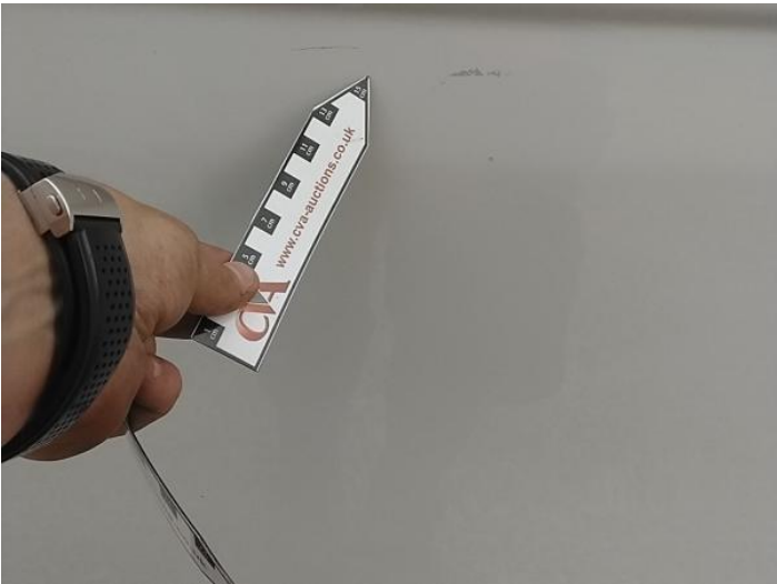
1: Qtr Panel osr Scratched UpTo 25mm Thru Paint