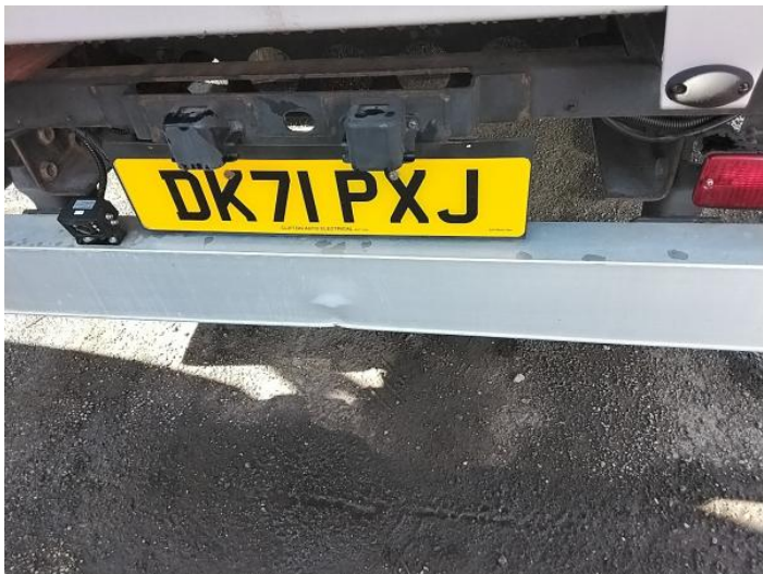
1: Bumper Rear Dented Over 30mm