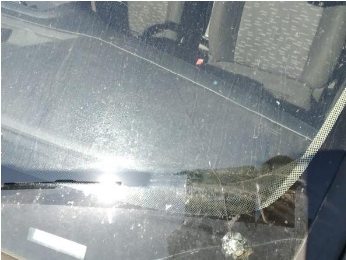
12: Screen Front Cracked Replace

Carpet Condition Average Seat Condition Average