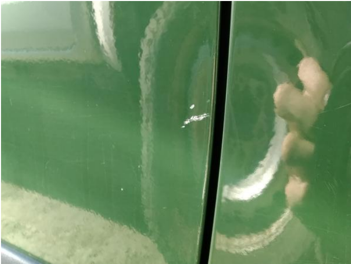
9: Door osf Scratched UpTo 25mm Thru Paint