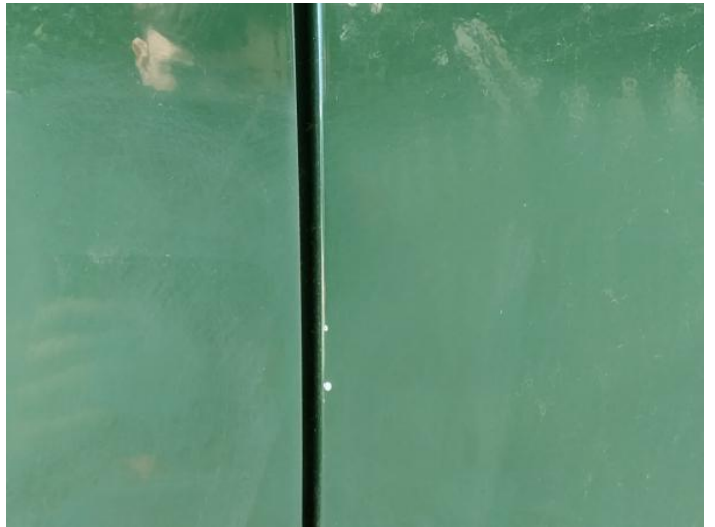
6: Panel Rear Chipped Edge Chip