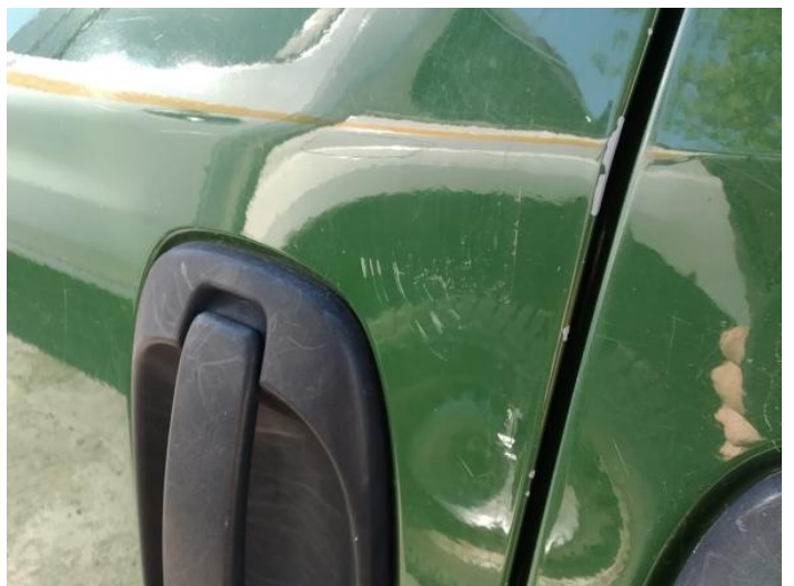
8: Door osf Scratched Over 25mm Not Thru Paint