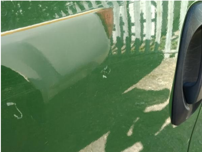
10: Door osf Dented Between 10mm + 30mm