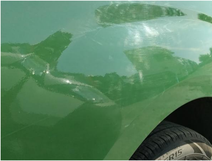
3: Moulding nsf Wing Scratched (Painted) Over 25mm Not Thru Paint