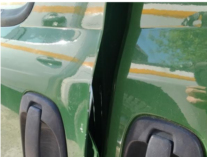
7: Door osf Chipped Edge Chip