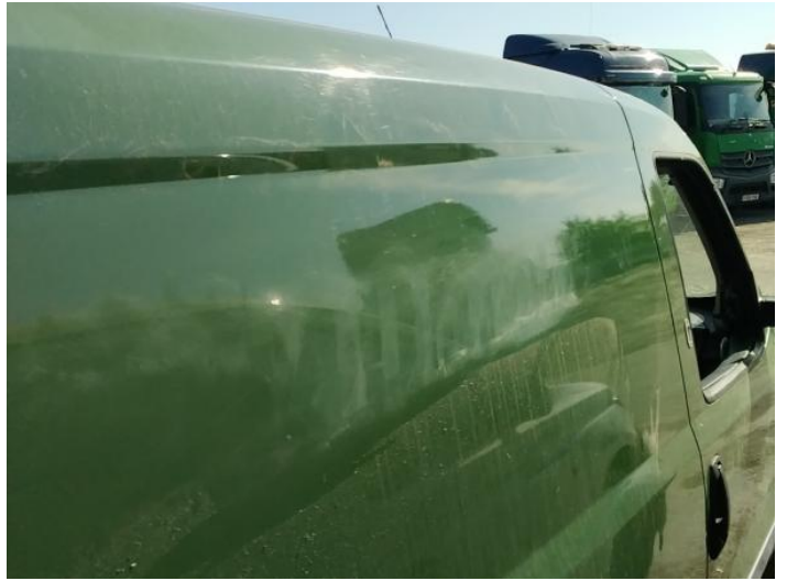
4: Panel Rear Scratched Over 25mm Not Thru Paint