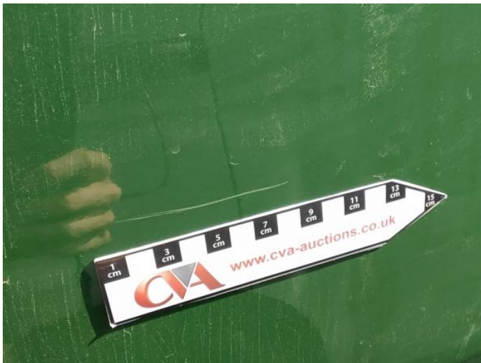
1: Panel Rear Scratched Over 25mm Not Thru Paint