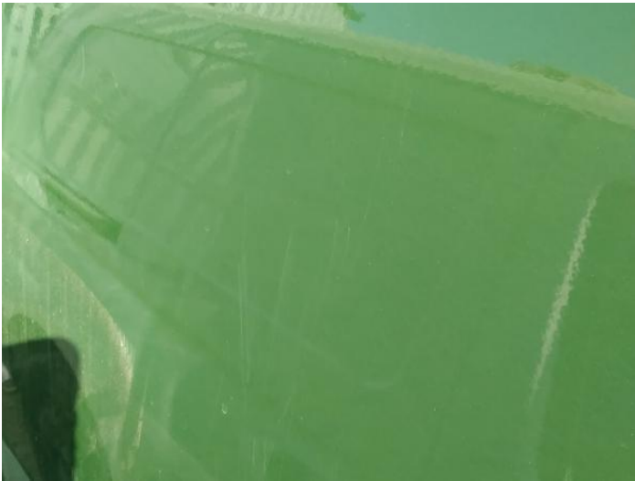
5: Panel Front Scratched Over 25mm Not Thru Paint