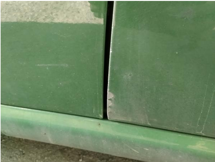
11: Door osf Chipped Over 5mm