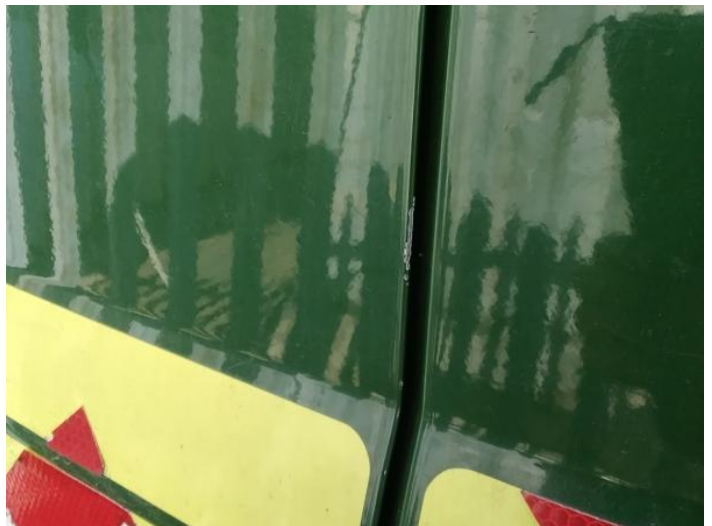
2: Panel Rear Chipped Edge Chip