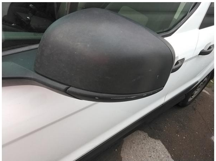
2: Door Mirror Assy nsf Scuffed (Unpainted) Over 100mm