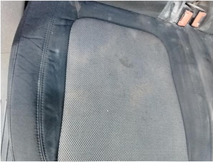
9: Seat Base Cover osr Soiled Heavy