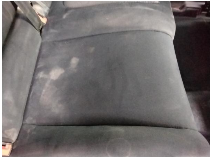
6: Seat Base Cover nsr Soiled Heavy