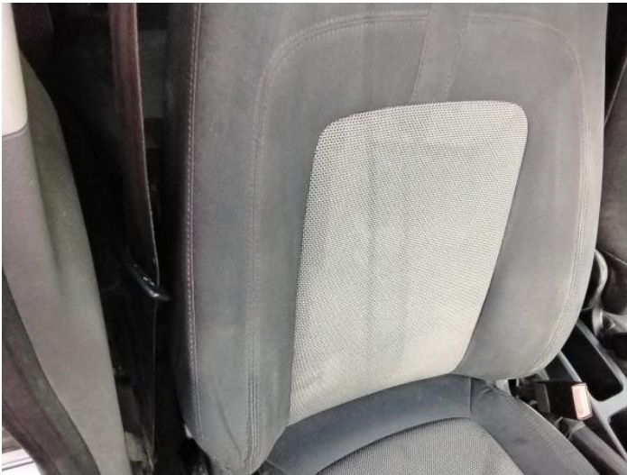
11: Seat Back Cover osf Soiled Heavy