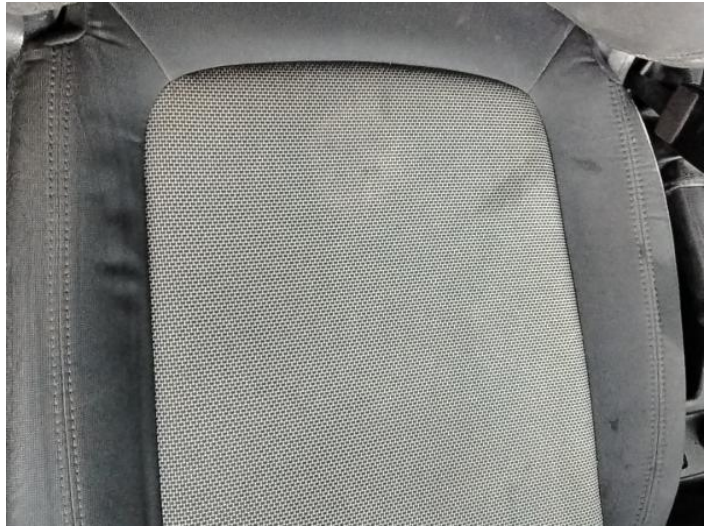
10: Seat Base Cover osf Soiled Heavy