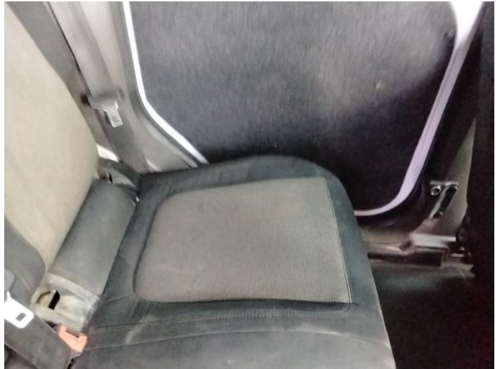
4: Seat Base Cover nsr Soiled Heavy