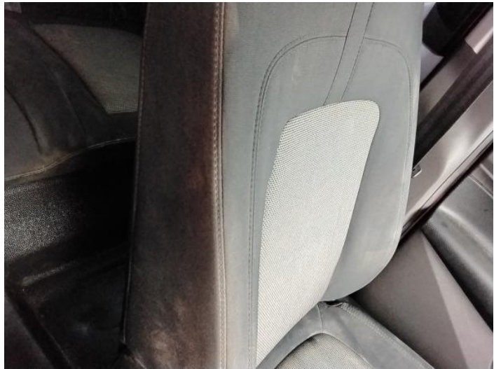
12: Seat Back Cover nsf Soiled Heavy