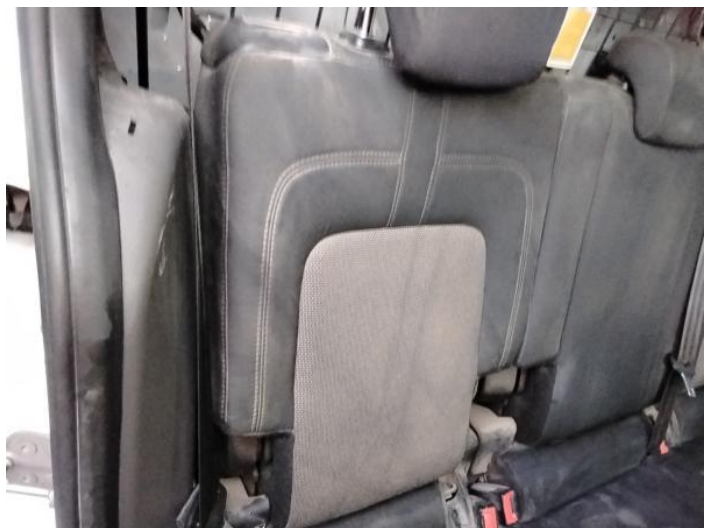
8: Seat Back Cover osr Soiled Heavy