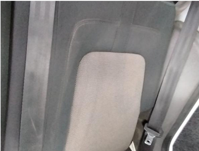
5: Seat Back Cover nsr Soiled Heavy