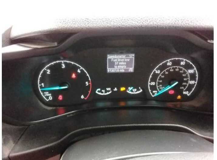
14: Dash Warning Lights Displayed No Action