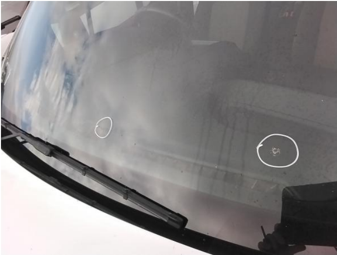
3: Screen Front Chipped Over 10mm