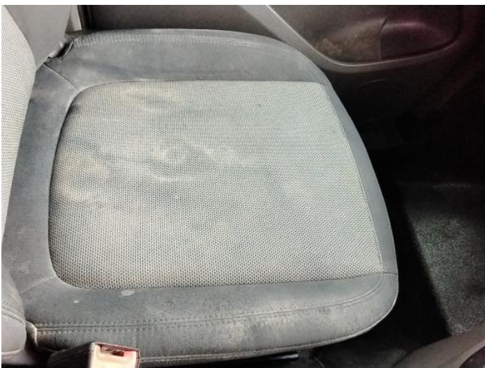
13: Seat Base Cover nsf Soiled Heavy