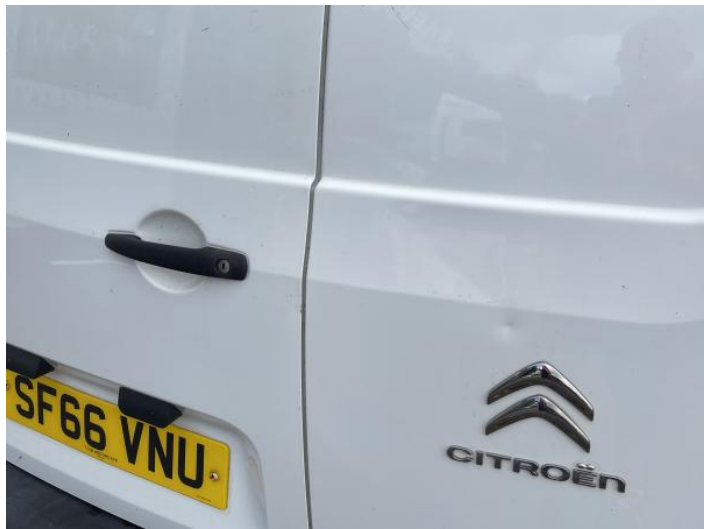
6: Tailgate Dented With Paint Damage