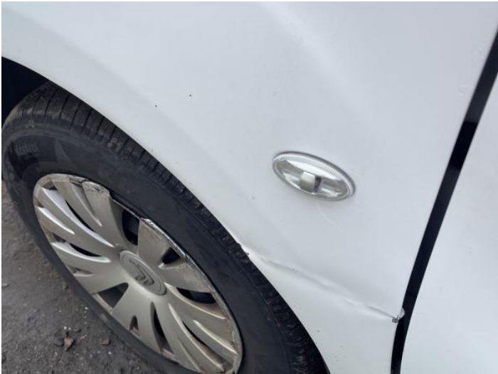
9: Wing nsf Dented With Paint Damage