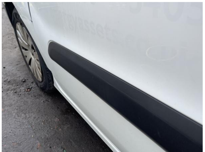
8: Door osf Dented Over 30mm