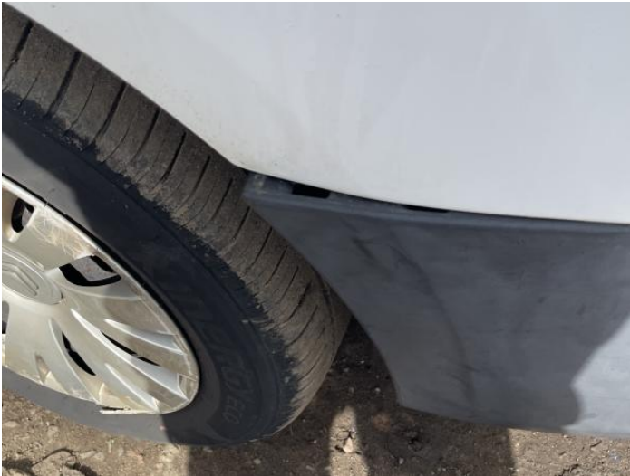
3: Bumper Front Insecure Action Required