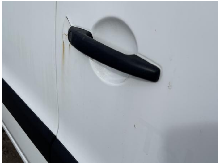
4: Door osf Dented With Paint Damage