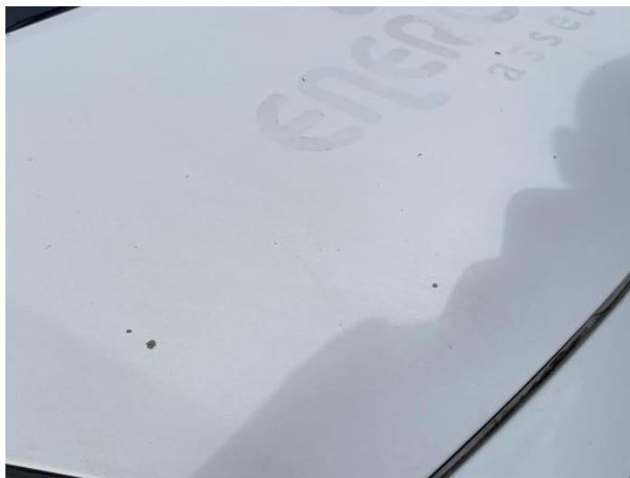
2: Bonnet Rusted Over 5mm