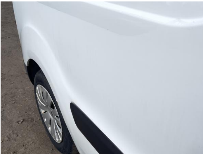
5: Qtr Panel osr Dented Over 30mm