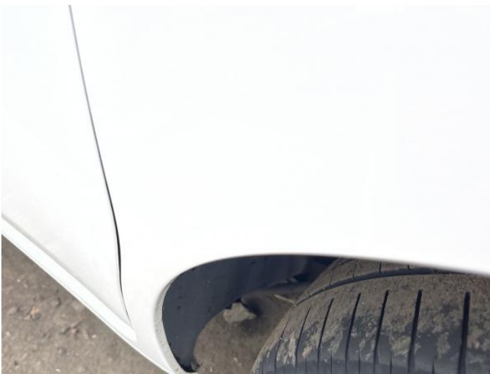
7: Qtr Panel nsr Dented Over 30mm