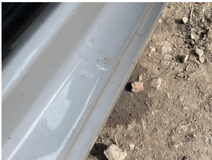
1: Sill os Rusted Over 5mm