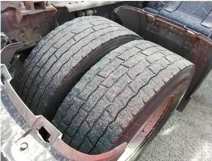
5: Qtr Panel Moulding os Missing Replace