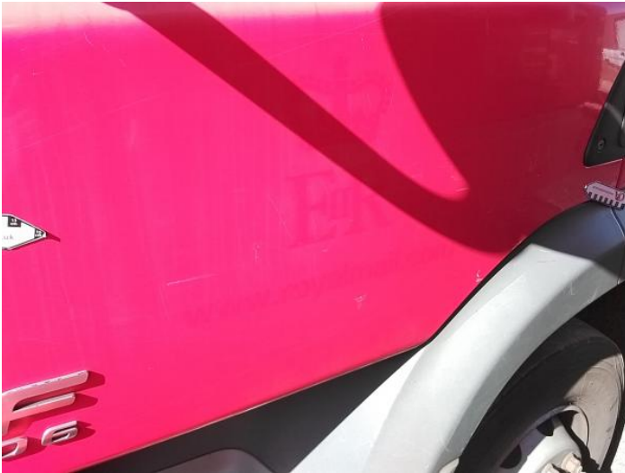
3: Door nsf Scratched Over 25mm Thru Paint