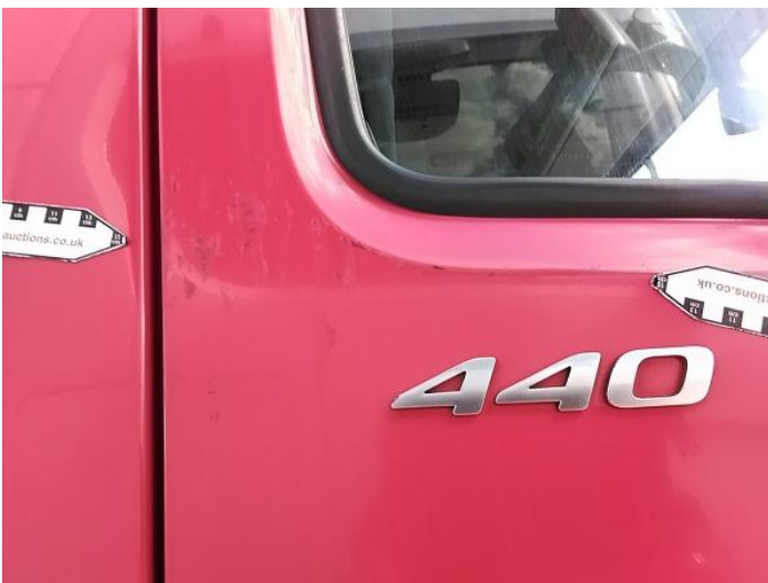
7: Door osf Scratched Over 25mm Not Thru Paint