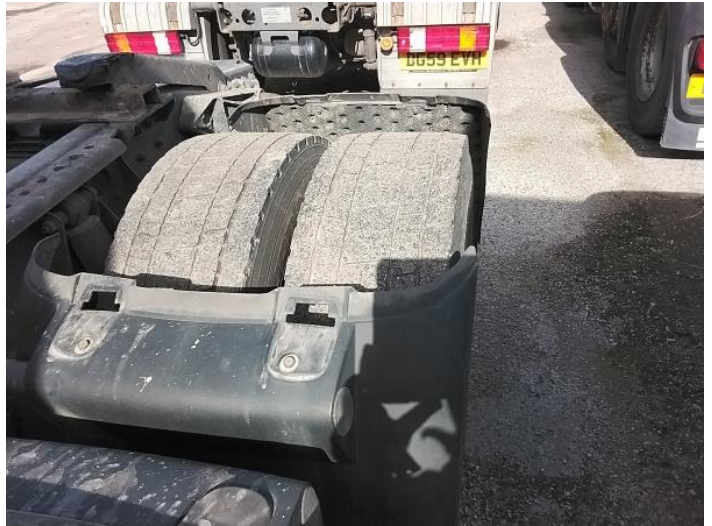
4: Qtr Panel Moulding ns Missing Replace