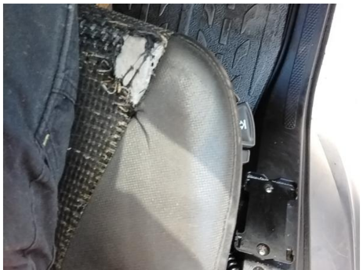
8: Seat Base Cover osf Torn Over 3mm