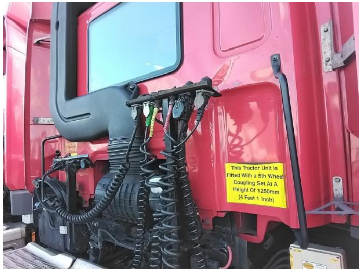
6: Panel Rear Dented With Paint Damage