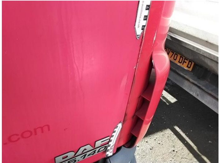
4: Door osf Dented With Paint Damage