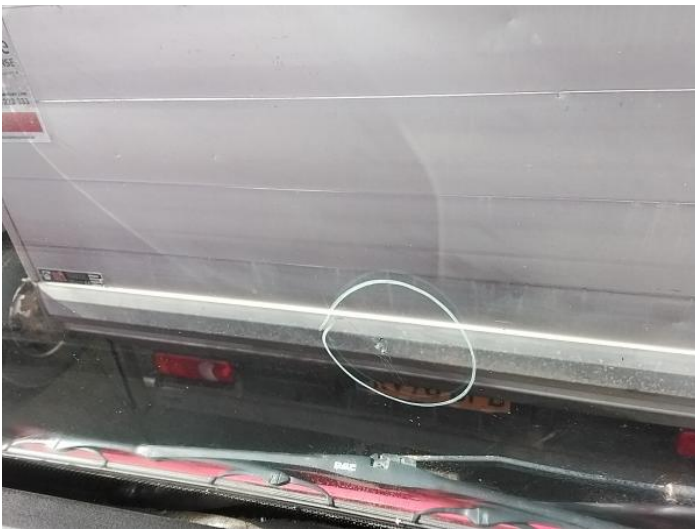
5: Screen Front Chipped Over 10mm