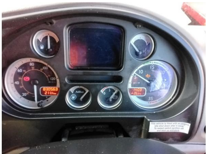
8: Dash Warning Lights Displayed No Action