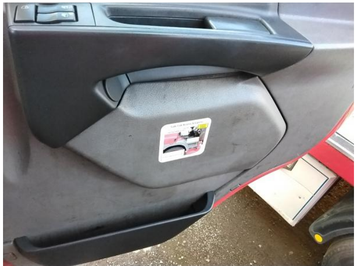
6: Door Pad osf Soiled Heavy