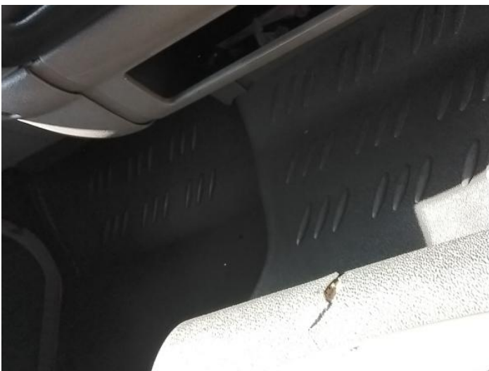
7: Carpets Front Torn Over 10mm