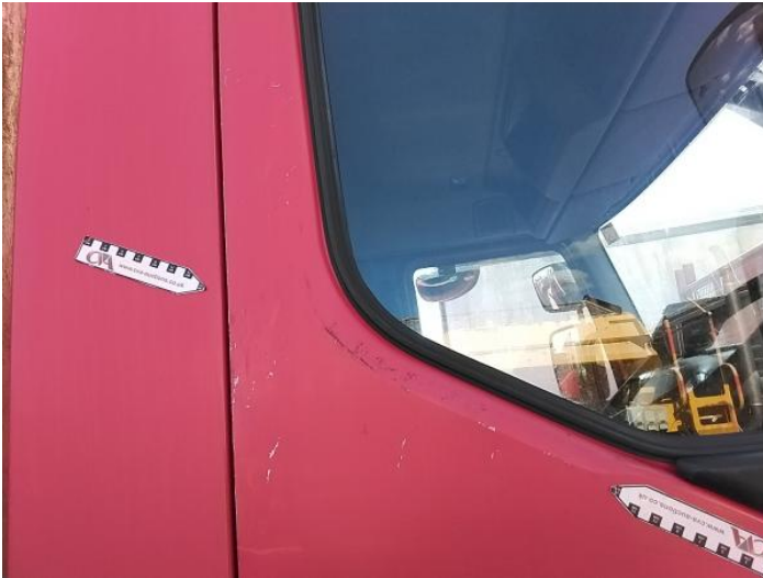
3: Door osf Scratched Over 25mm Thru Paint