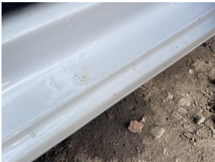
1: Sill os Rusted Over 5mm