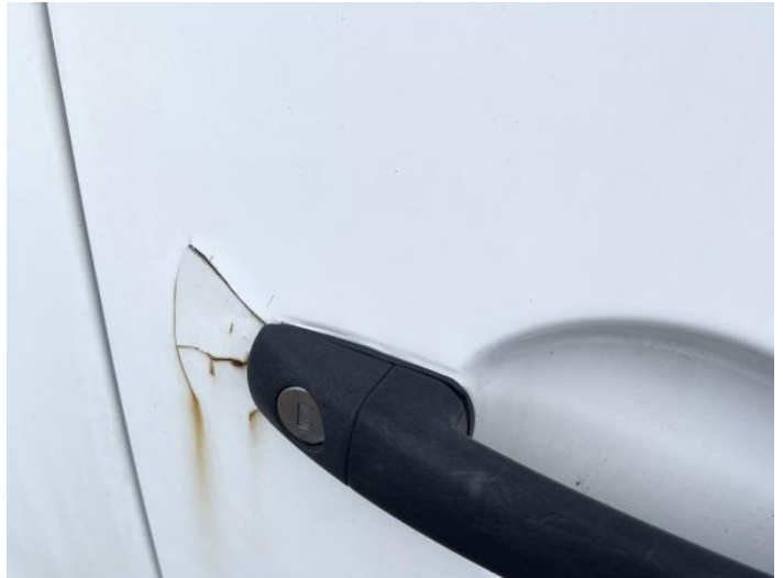
4: Door osf Rusted Over 5mm