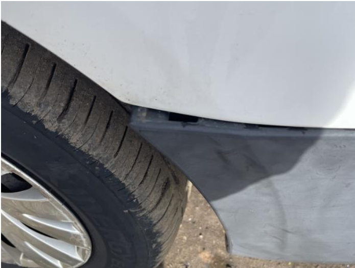
3: Bumper Front Insecure Action Required