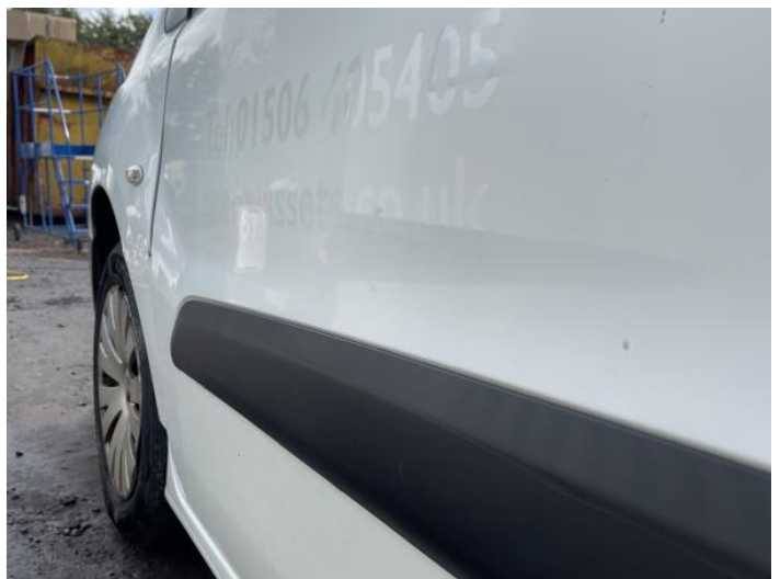
8: Door nsf Dented Over 30mm