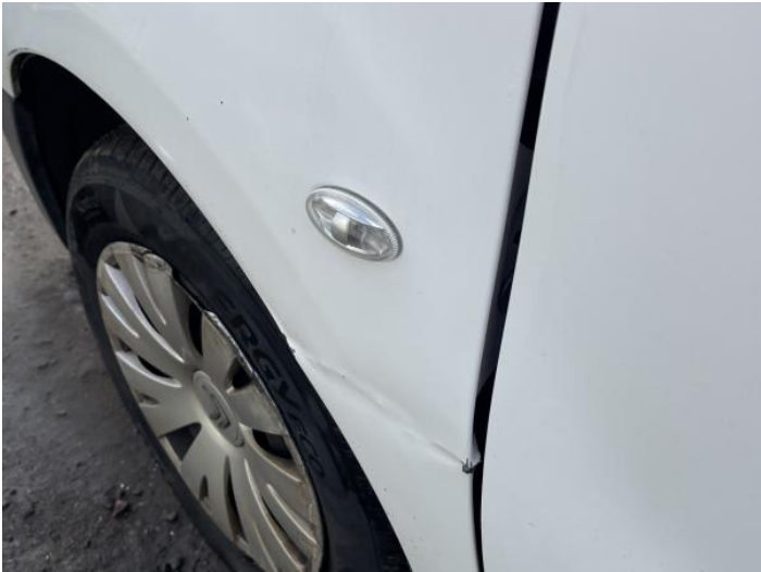
9: Wing nsf Dented Over 30mm