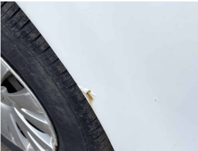
5: Qtr Panel osr Rusted Over 5mm