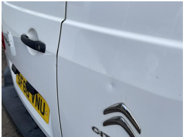
6: Tailgate Dented Over 30mm