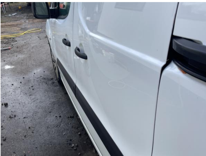
7: Door nsr Dented Over 30mm