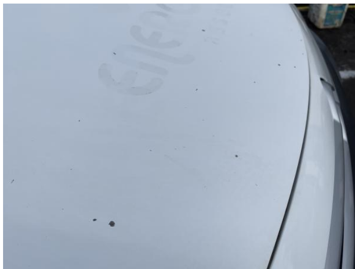
2: Bonnet Rusted Over 5mm