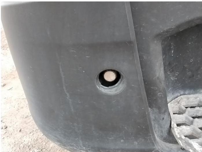
4: Bumper Front Missing Replace

Carpet Condition Average Seat Condition Average