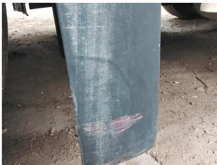
2: Panel Front Scratched Over 25mm Not Thru Paint