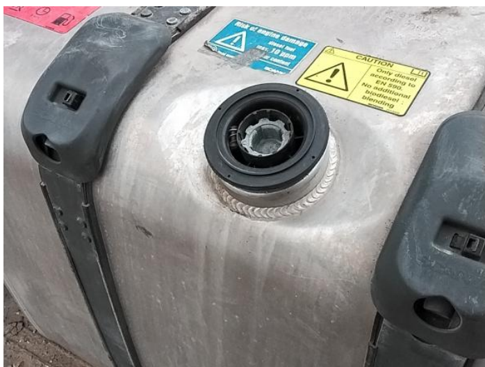
1: Fuel Flap Missing Replace