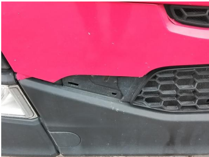
3: Bumper Front Missing Replace