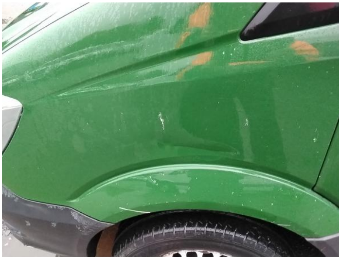
5: Wing nsf Chipped Multiple Chips