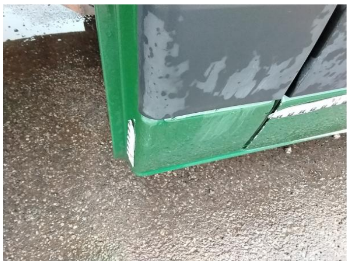
8: B Post os Scratched Over 25mm Thru Paint