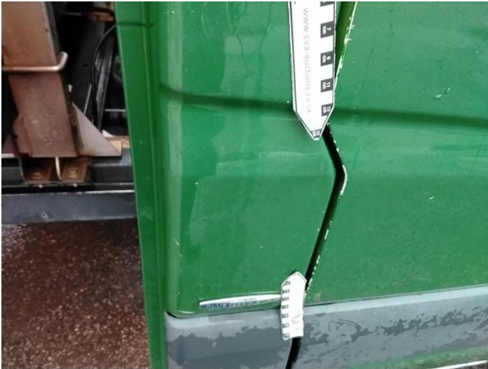
9: B Post osf Dented Over 30mm