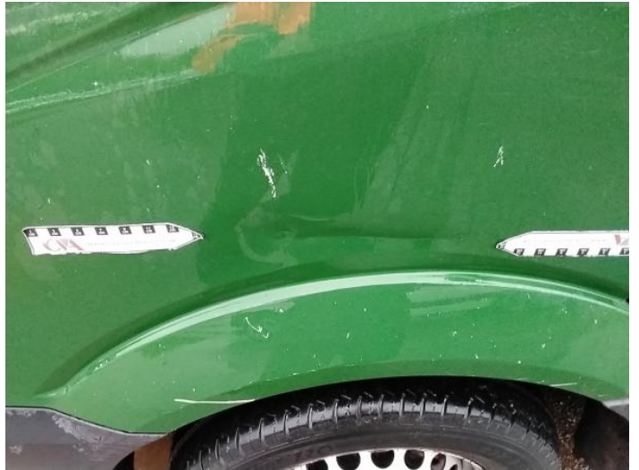
4: Wing nsf Dented Over 30mm