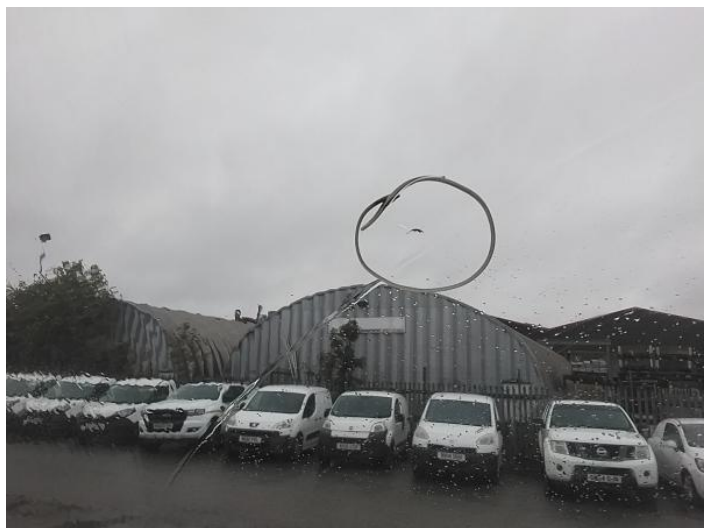
14: Screen Front Cracked Replace