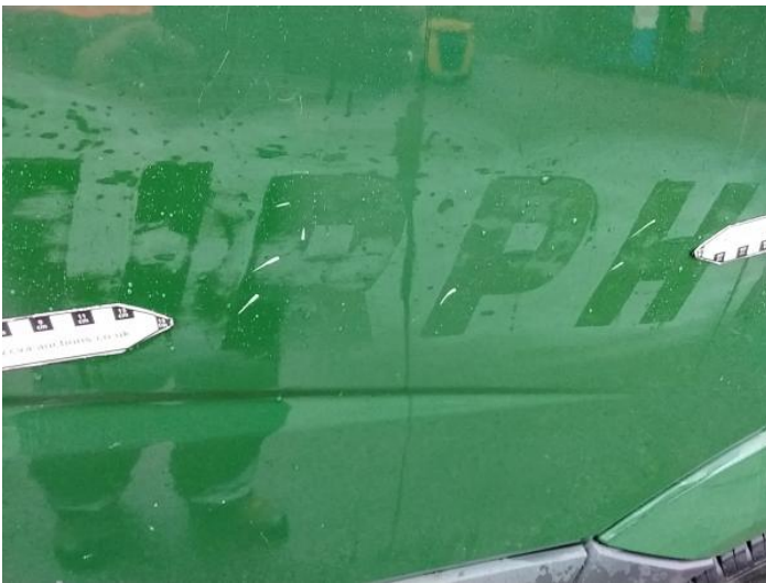
11: Door osf Scratched Over 25mm Thru Paint