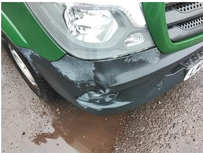
1: Bumper Front Dented Over 30mm