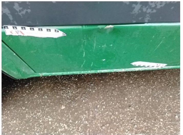
6: Door nsf Dented With Paint Damage