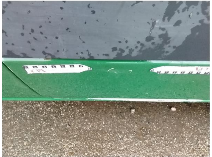
10: Door osf Dented With Paint Damage