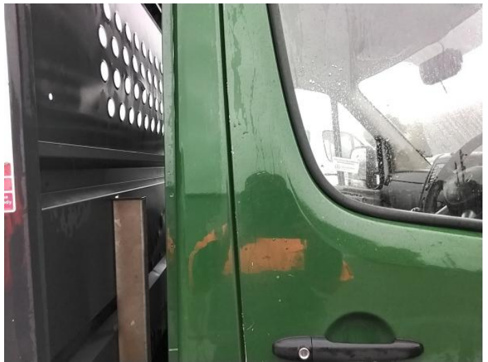
12: Door osf Chipped Multiple Chips