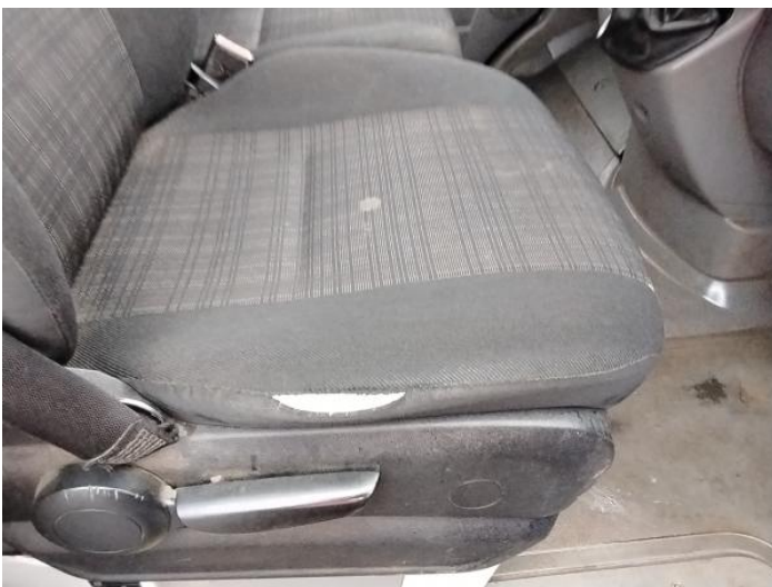
13: Seat Base Cover osf Holed Over 3mm