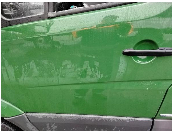
7: Door nsf Chipped Multiple Chips