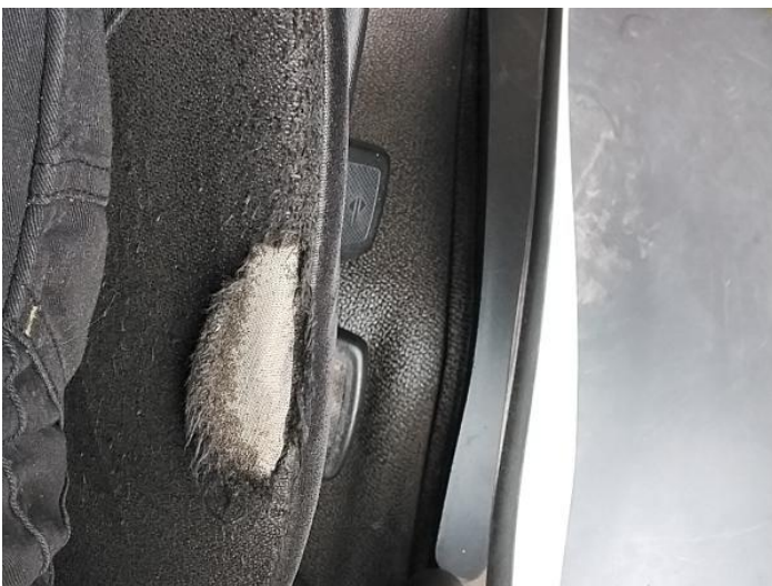
7: Seat Base Cover osf Torn Over 3mm