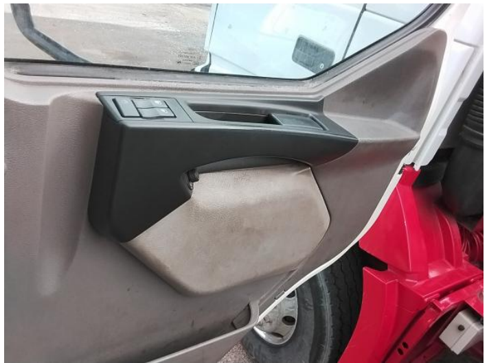
6: Door Pad osf Soiled Heavy