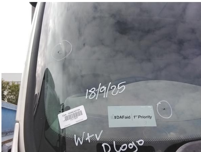
1: Screen Front Chipped Over 10mm