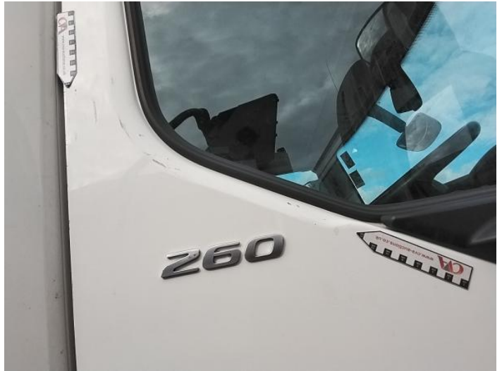
4: Door osf Scratched Over 25mm Thru Paint