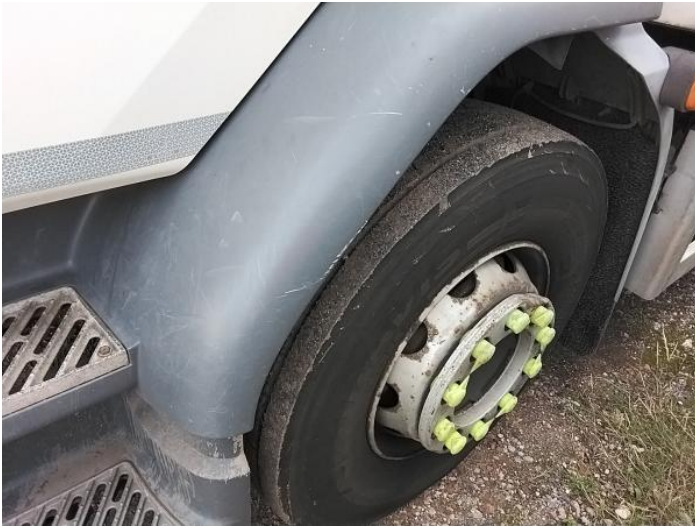
3: Wing nsf Scratched Over 25mm Thru Paint