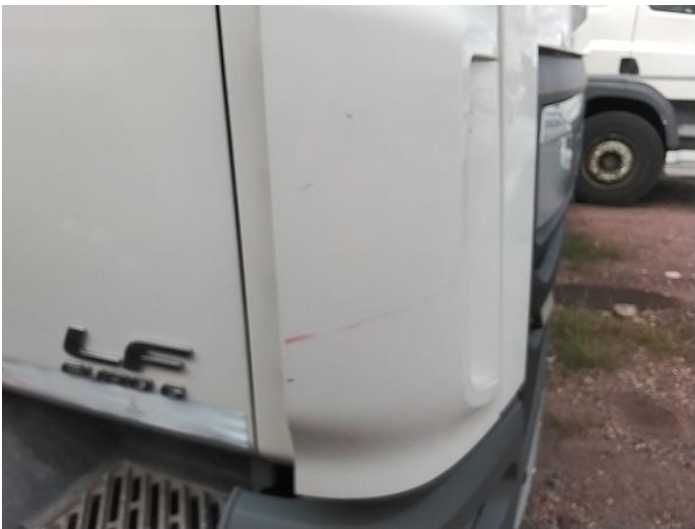
5: Panel Front Scratched Over 25mm Thru Paint