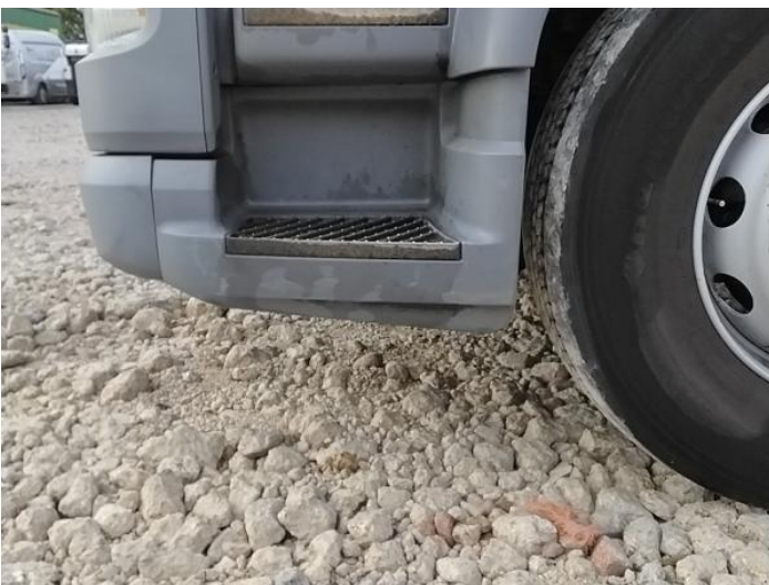
7: Other N/A N/A