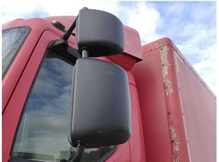
6: Door Mirror Assy nsf Scuffed (Unpainted) UpTo 100mm