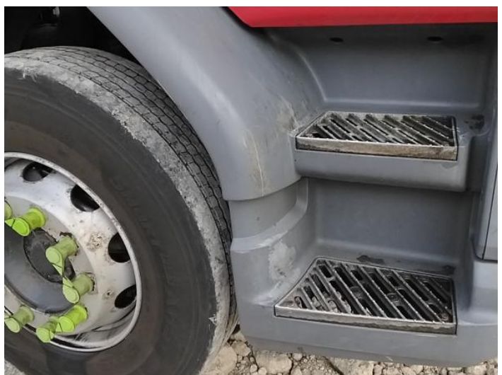
14: Other N/A N/A