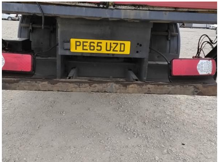
10: Bumper Rear Rusted Over 5mm