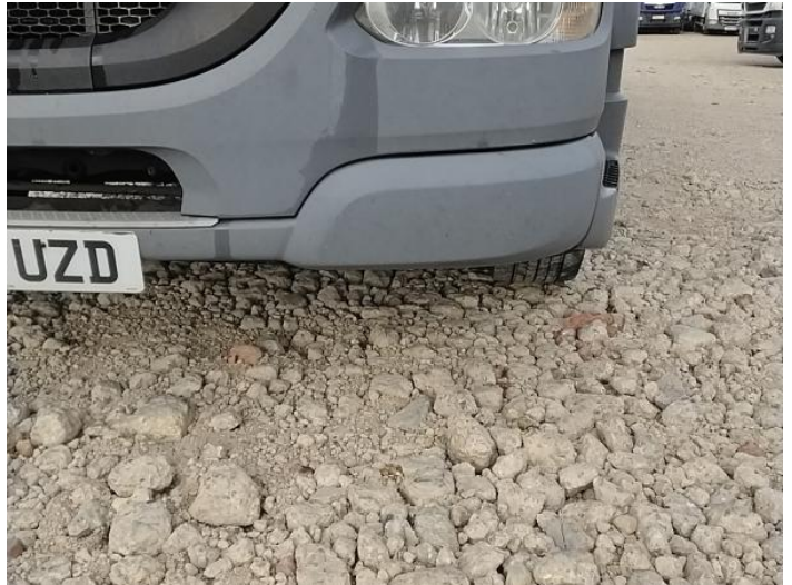
4: Bumper Front Chipped Multiple Chips