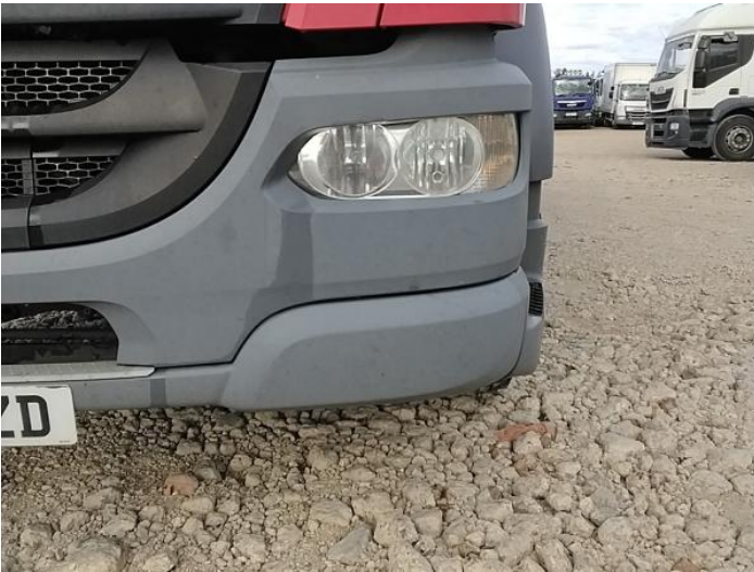
5: Other N/A N/A