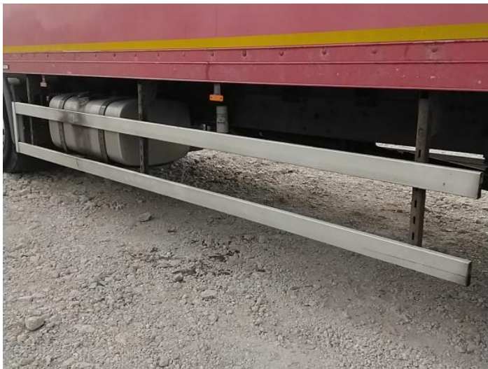
9: Other N/A N/A