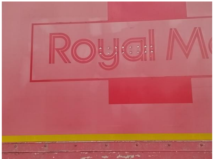
12: Other N/A N/A