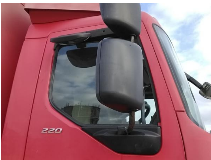
13: Door Mirror Assy osf Scuffed (Unpainted) UpTo 100mm