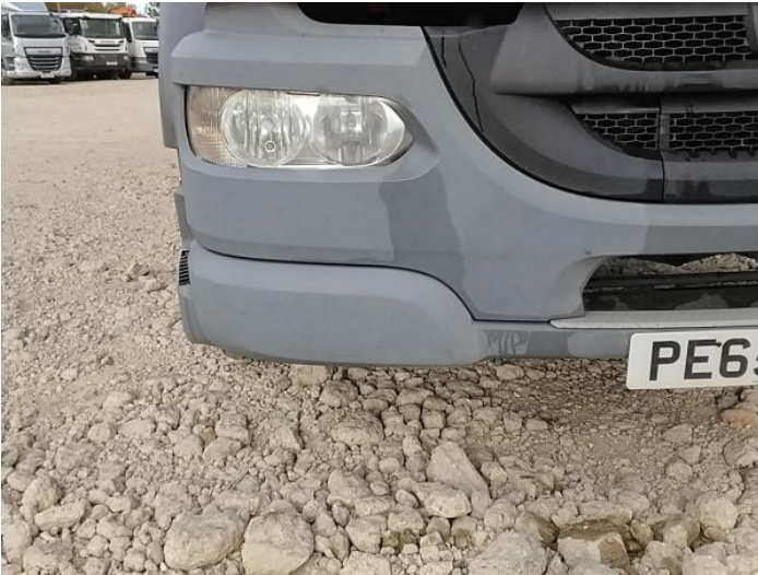
3: Other N/A N/A