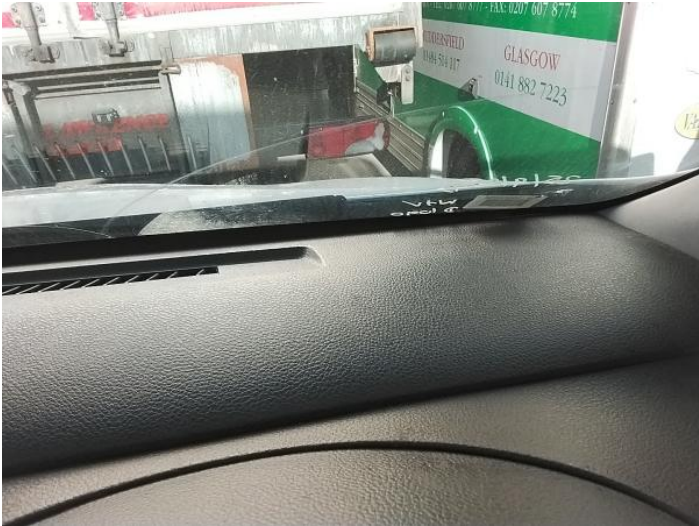
9: Screen Front Scratched Over 30mm