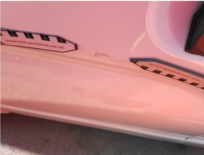
6: Qtr Panel osr Dented With Paint Damage