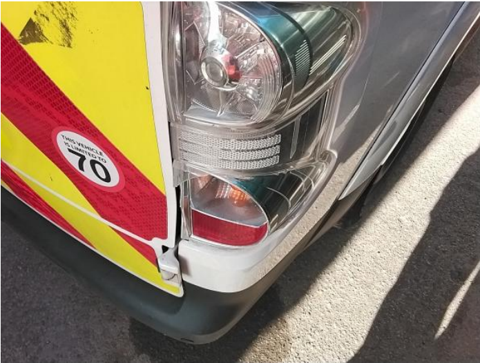
4: Lamp osr Broken Replace