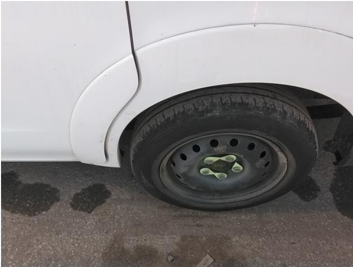
3: Qtr Panel Moulding ns Scuffed (Unpainted) Over 100mm