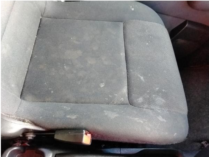
10: Seat Base Cover nsf Soiled Heavy