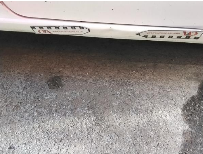
8: Sill os Dented Over 30mm