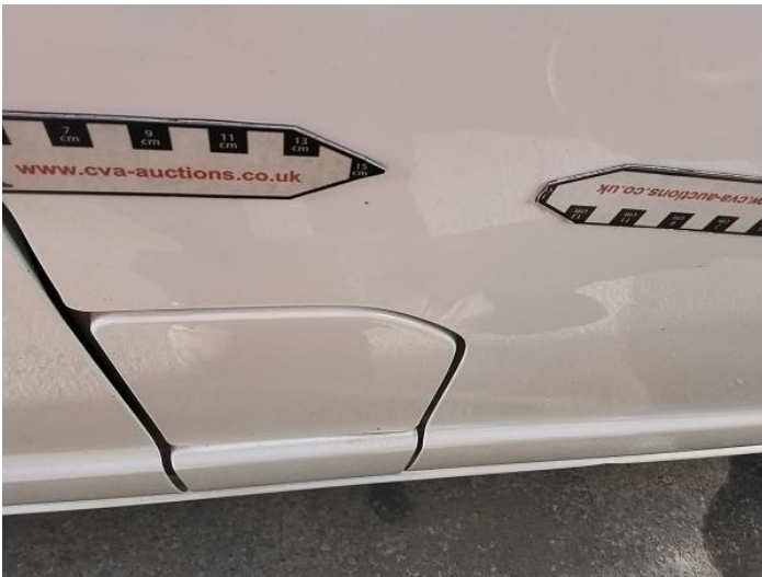
7: Door osf Dented Over 30mm