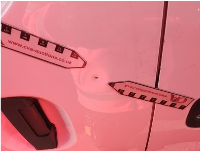
5: Qtr Panel osr Dented With Paint Damage