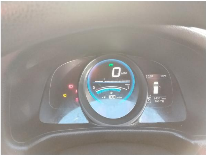
11: Dash Warning Lights Displayed No Action