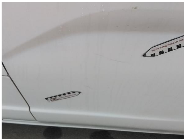
2: Qtr Panel nsr Scratched Over 25mm Thru Paint