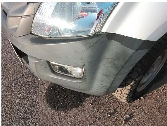
2: Bumper Front Scratched Over 100mm Thru Paint