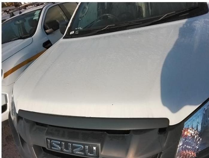
1: Bonnet Chipped Multiple Chips