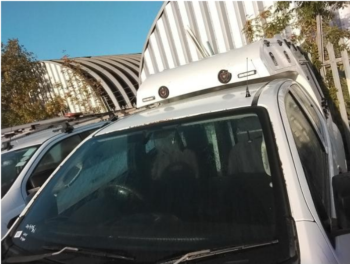
3: Roof Chipped Multiple Chips