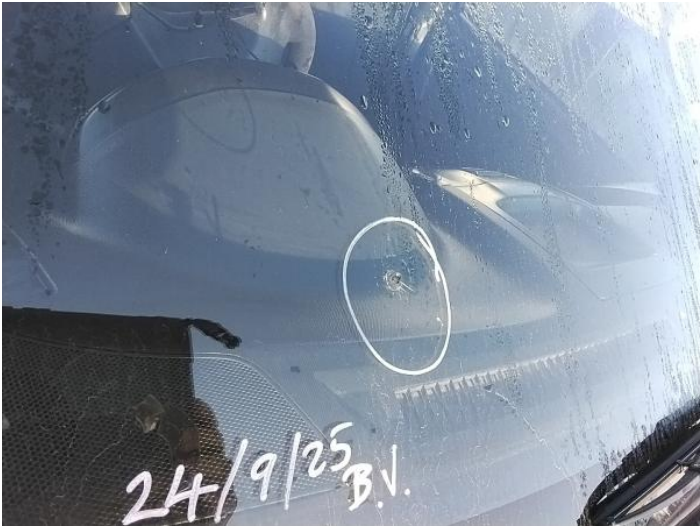
9: Screen Front Cracked Replace