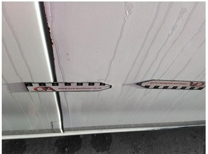
6: Door osf Dented With Paint Damage