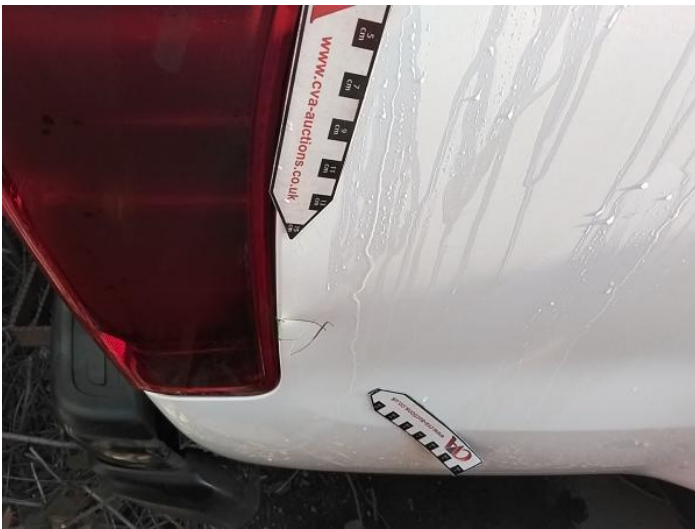
5: Qtr Panel osr Dented With Paint Damage