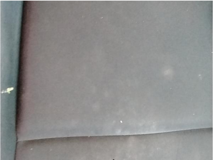
10: Seat Base Cover osf Burn Over 3mm