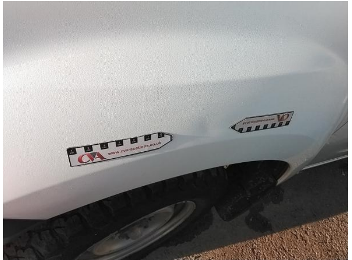
4: Wing nsf Dented Over 30mm