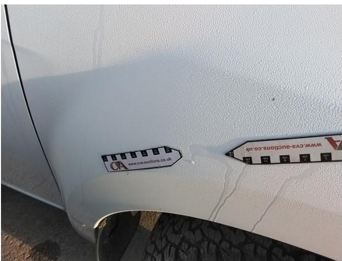
7: Wing osf Dented Over 30mm