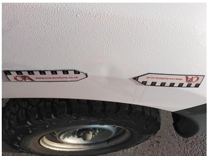
8: Wing osf Dented Over 30mm