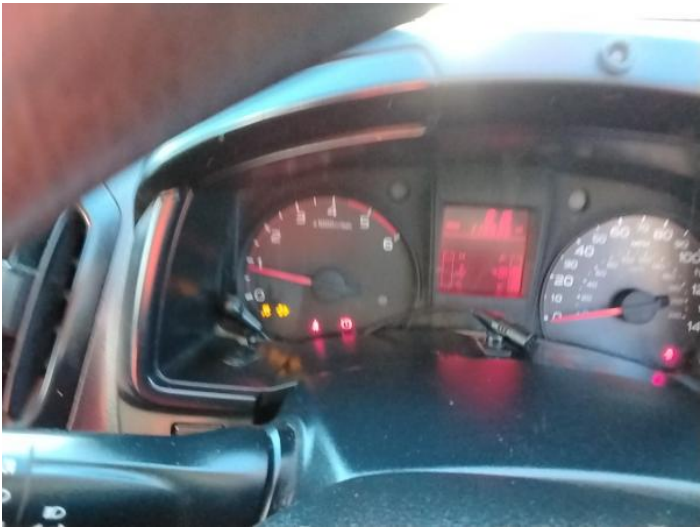
11: Dash Warning Lights Displayed No Action