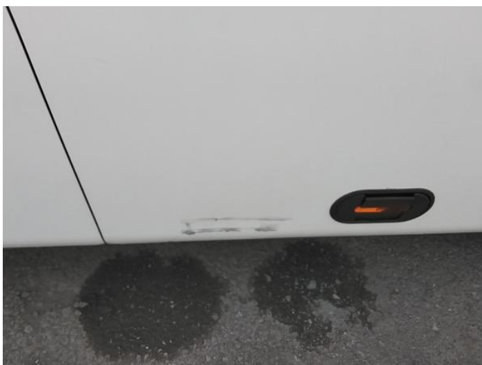
7: Qtr Panel osr Dented With Paint Damage