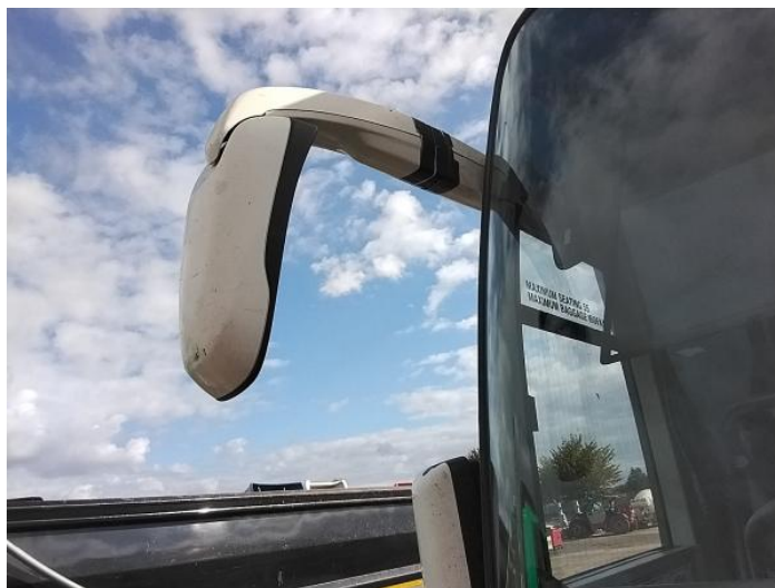
2: Door Mirror Assy osf Broken Replace