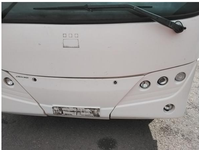
1: Bonnet Chipped Multiple Chips