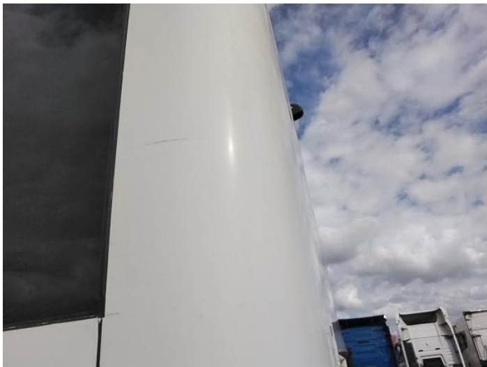
5: Panel Rear Scratched Over 25mm Thru Paint