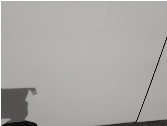
3: Qtr Panel nsr Scratched Over 25mm Not Thru Paint