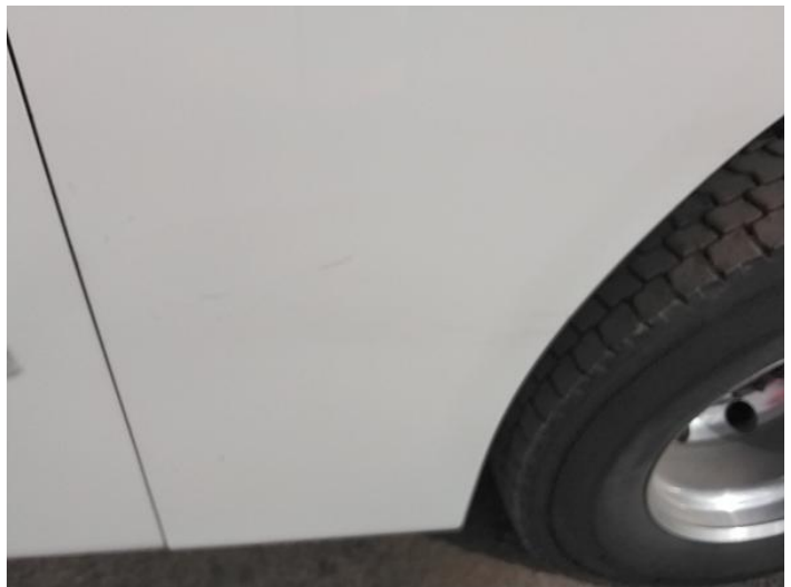
4: Qtr Panel nsr Scratched Over 25mm Thru Paint