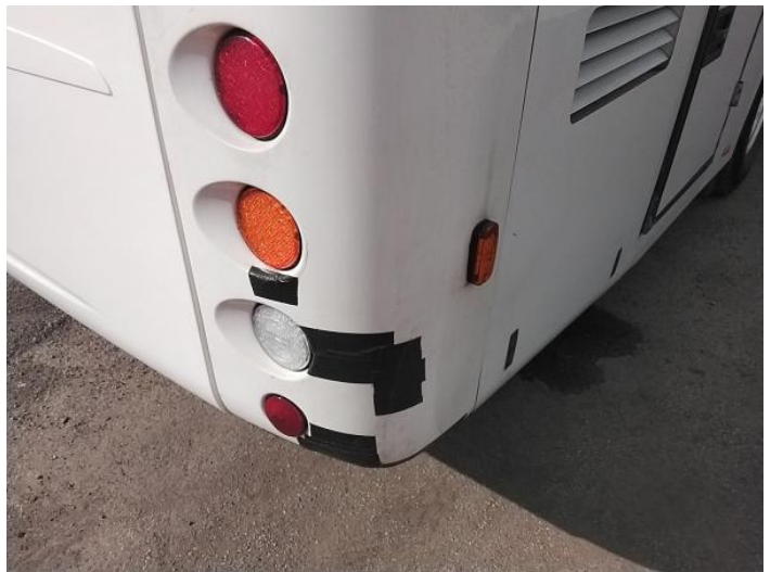
6: Panel Rear Cracked Replace