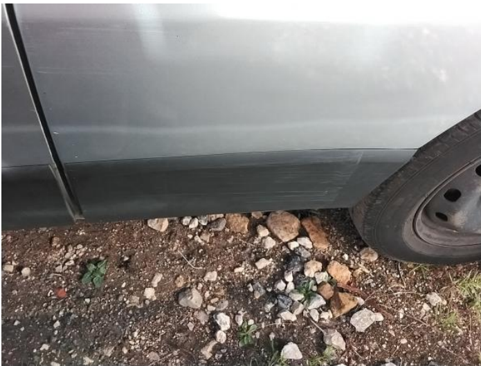
5: Qtr Panel Moulding ns Scuffed (Unpainted) Over 100mm