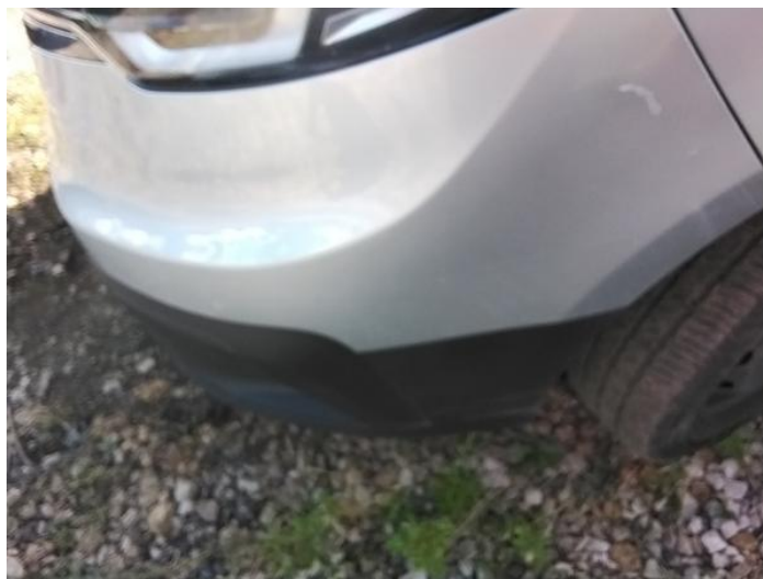
2: Bumper Front Scratched Over 100mm Thru Paint