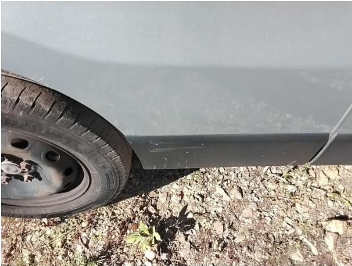
9: Qtr Panel Moulding os Scuffed (Unpainted) Over 100mm