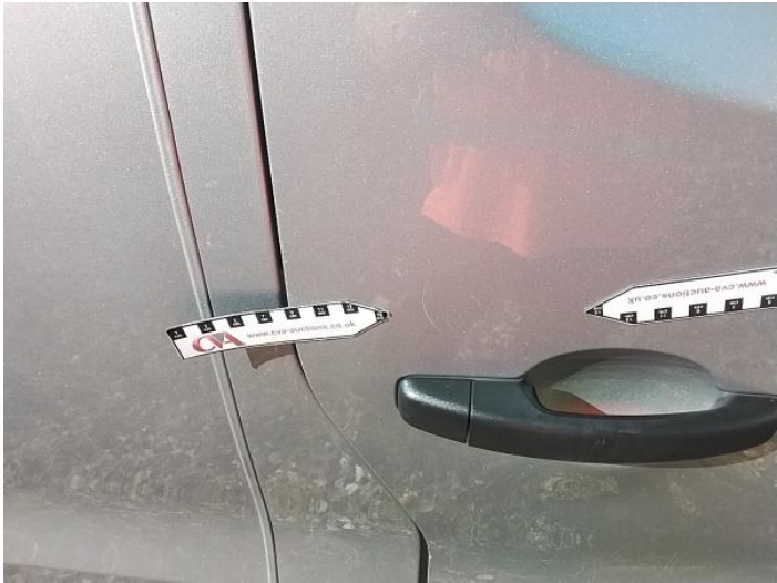
10: Door osf Scratched Over 25mm Thru Paint