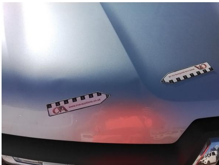
1: Bonnet Dented Over 30mm