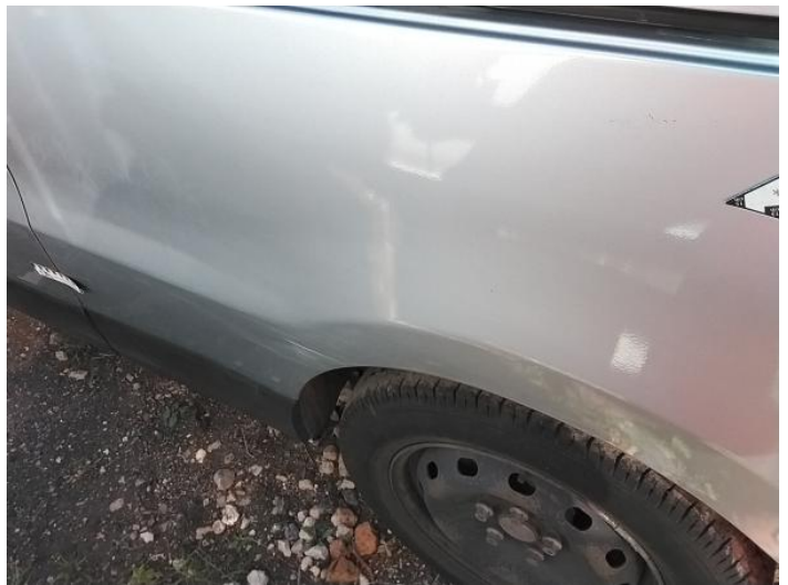
6: Qtr Panel nsr Scratched Over 25mm Thru Paint