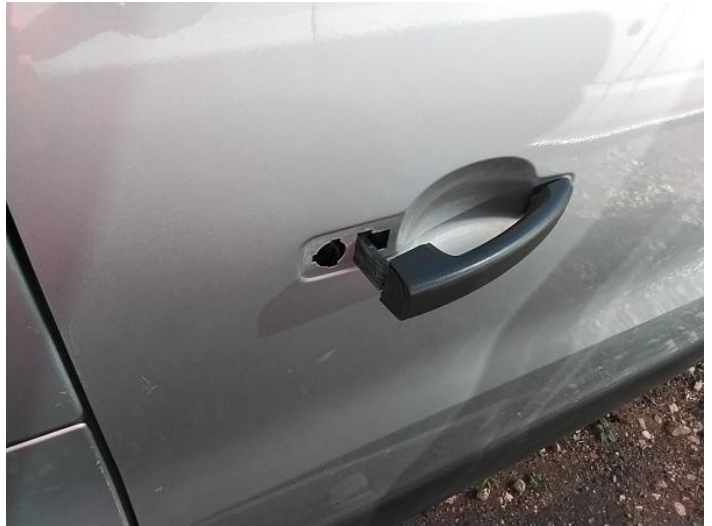
4: Door Lock nsf Broken Replace