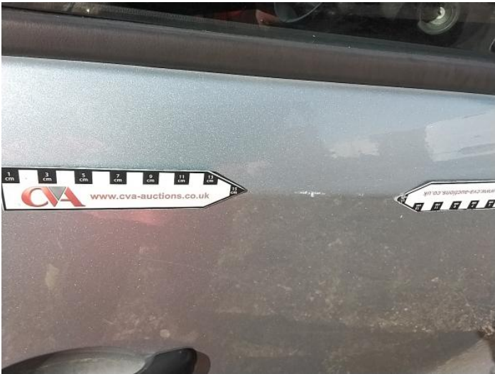
11: Door osf Scratched Over 25mm Thru Paint