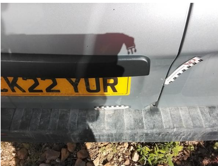
7: Door nsr Dented With Paint Damage