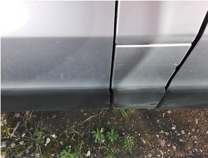
3: B Post ns Scratched Over 25mm Thru Paint