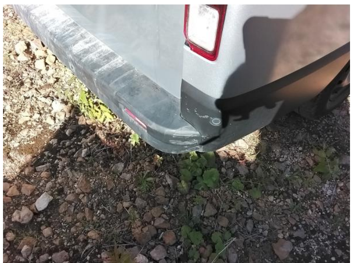
8: Bumper Rear Scratched Over 100mm Thru Paint